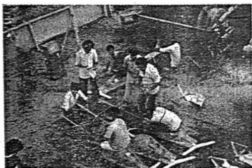
Geologists fitting the Boomrang Grabs

Earth's last mineral frontier—the 37 million square miles of Ocean floor, is being scanned for economic exploitation. As metallic minerals of land are getting exhausted, attention is focussed on Ocean. It is anticipated that a rich repository of non-ferrous minerals in the shape of Polymetallic Nodules are widely scattered on the deep sea bed. These nodules generally contain copper, nickel, manganese, cobalt—which are termed as strategic minerals. Especially nickel is in conspicuous demand of arsenal unit in the Defence sector.