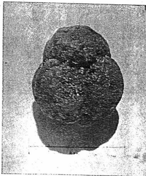
(Polymetallic Nodule