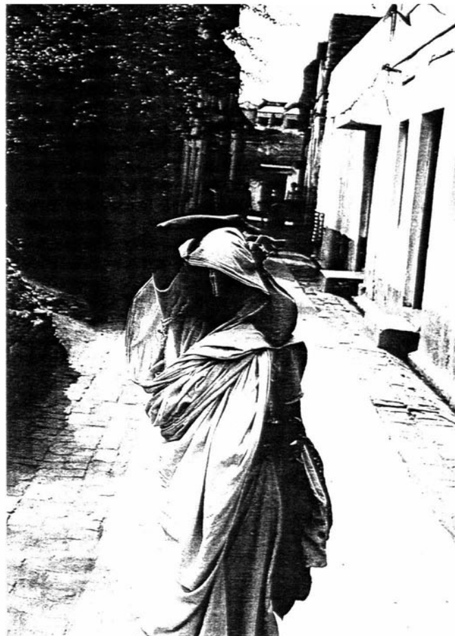
Left: A Ramanandi sect sadhu at Vrindavan — thinking beyond the Vaikuntha Right: Bengali widow in Vrindavan sporting a tilak of 'Nabodip' origin

In the Rig Vedic age, a tilak was applied when the yagya or homa (fire) ceremony was initiated. At the end of the homa ceremony, the people put marks on their forehead, the lower end of the neck, on the arms and on the chest. These marks were made with ashes and ghee (clarified butter) mixed together on the sacrificial ladle and applied on the body with the index finger.