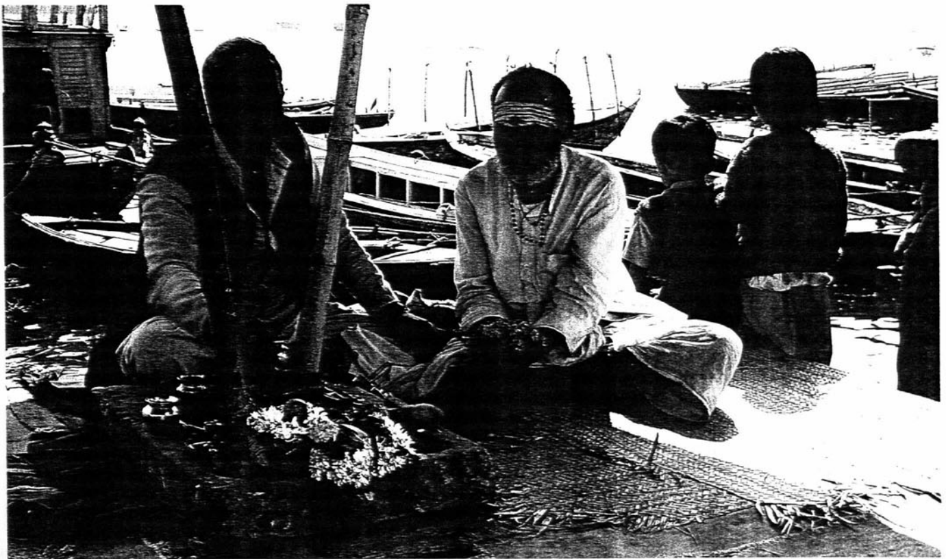
Above: Sporting Tripundara tilaks sadhus worshipping at the ghats of Varanasi — the land of Shiva Below: Sri Chaitanya followers still come to Vrindavan from Nabadwip in West Bengal

are Vibhuti, Bhadra, Bhasma, Ksara and Raksa.