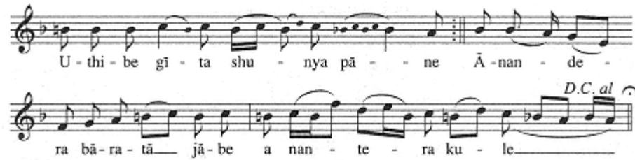
Ex. 5.1 cont.

Make me thy vina ; lift me in thine arms. All the strings of my heart will break out at thy finger-touch. With thy tender hands touch my life, and my heart will murmur her secrets in thine ears. In happiness and in sorrow she will gaze on thy face, and cry; and shouldst thou neglect her she will remain silent at thy feet. None knows in what new strains her songs will rise up to the heavens and send a message of joy to the shore of the infinite.