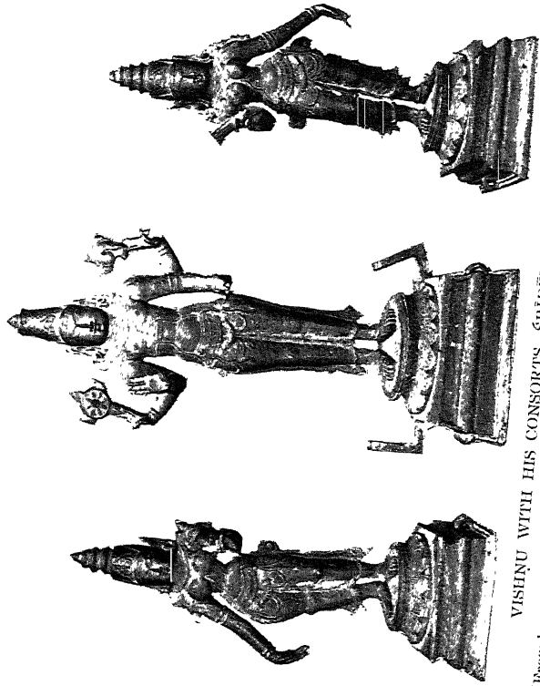
VISHNU WITH HIS CONSORTS, SRĪDĒVI AND BHŪDĒVI (From bronzes in the Madras Museum)