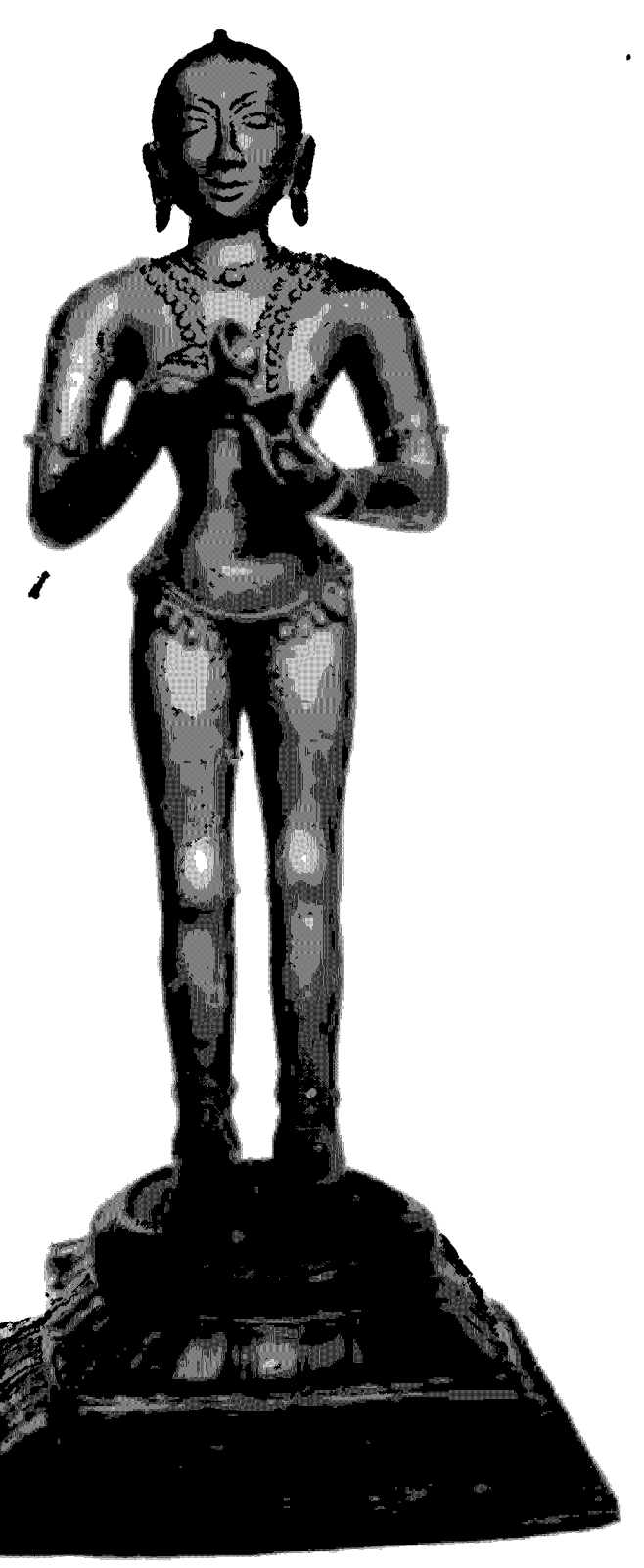
SAMBANDAR