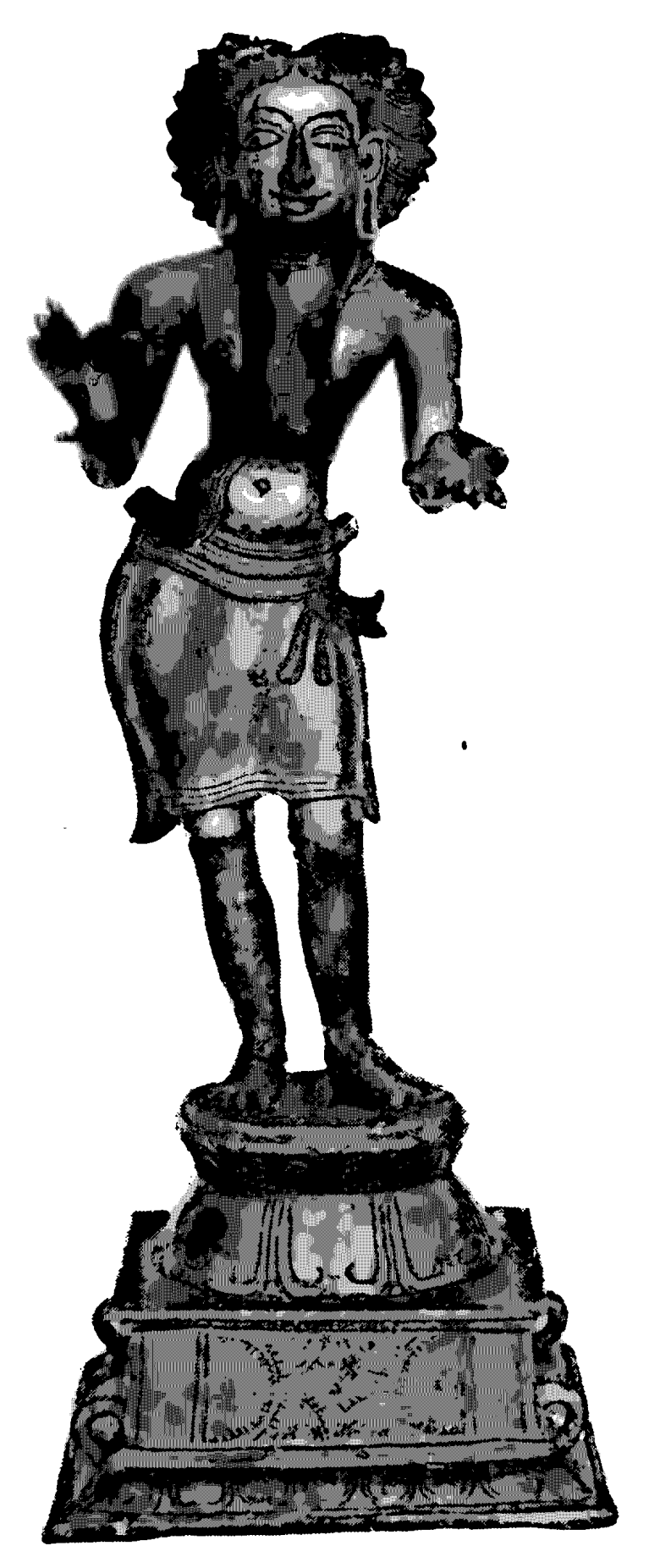
MĀŅIKKA VĀSAHAR