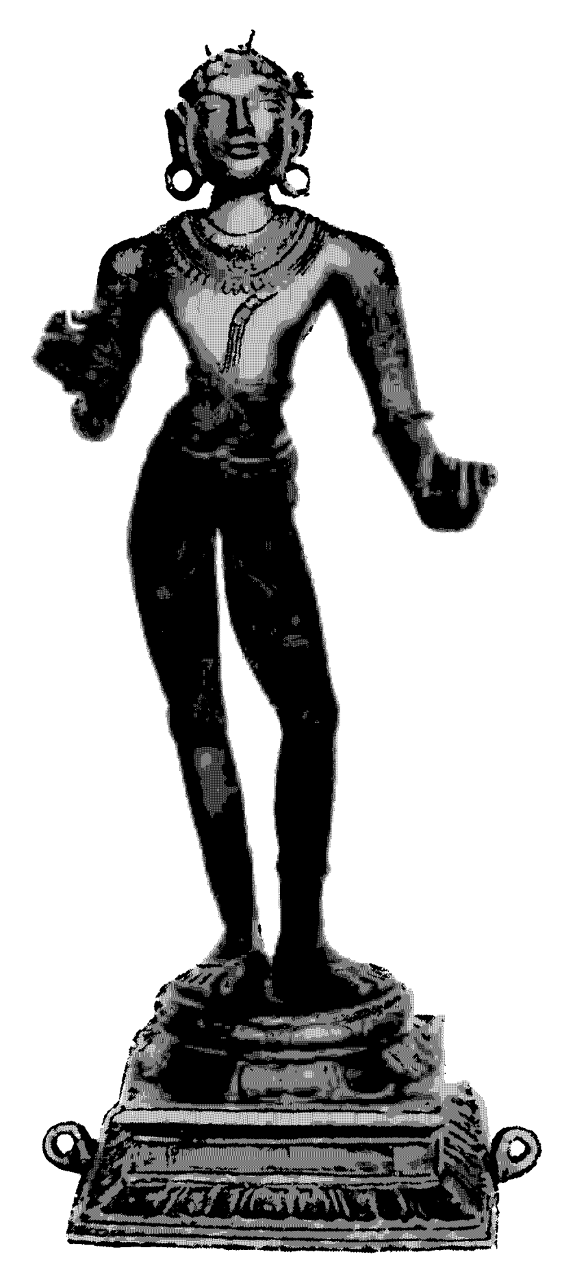
SUNDARAMŪRTI