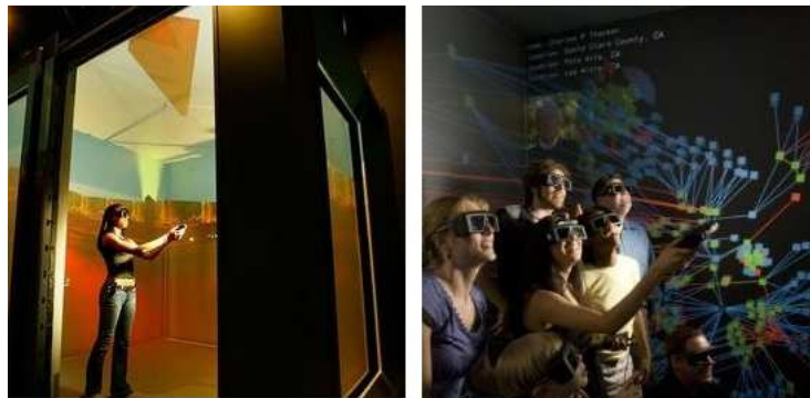
Fig. 1. DiVE: Left - Person in DiVE, Right - Exploring Social Networks in the DiVE

Redgraph is the first generic cross-platform Semantic Web virtual reality tool for visualization. It uses a custom parser to load the data file into a virtualized data structure, and has optimizations for speed over large data-sets. Vis3D annotations are used to determine which nodes (subjects and objects) and edges (properties) are rendered, and which nodes and edges are considered meta-data that is shown only as “details on demand” when a user “touches” the node. When the user touches the node, data associated with the node is presented to the user. Whatever schema is available can be retrieved, and the XML Schema data type provides the information needed to format the data in a human-readable form and provides captions for the data as well. The network visualization and extrusion technique is implemented in the Syzygy virtual reality library [27]. GraphViz [15] or Boost (only available on Linux) can both be used for the initial 2-D network layout. Vis3D is used to save and load visualizations. Pictures showing Redgraph in action are shown rightmost in Figure 1 and a movie may be viewed on the Web at http://www.redgraph.org .