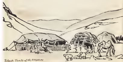
Black Tents of the KASHGARI

Weights and Measures. The metric system is used for all official measurement and weights in Iran. The unit of length in the metric system is the "meter," which is 39.37 inches, or a little more than one of our yards. The unit of road distance is the "kilometer," which is 1,000 meters or about five-eighths (a little over one-half) of one of our miles. The unit of weight is the "kilogram," which equals 2.2 pounds in our system. Liquids are measured