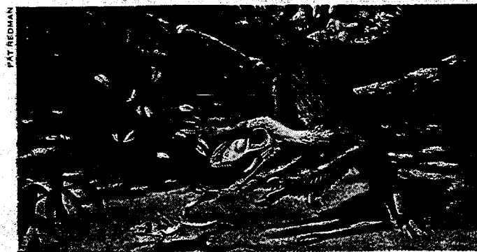
NOT SO DEAR: Bambiraptor probably ate baby dinos as well as frogs