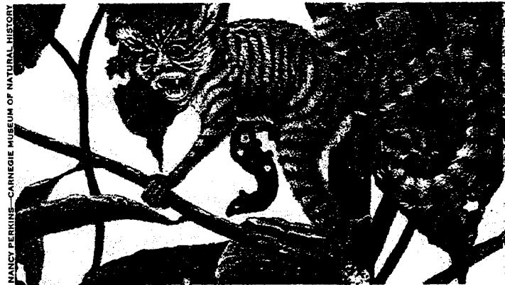
EOSIMIAS: Shy, nocturnal and small enough to fit in your palm