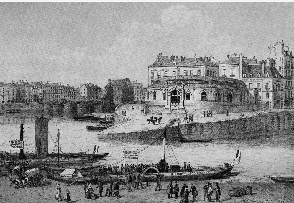
4. The Fish Market at the stern of Feydeau Island, with pyroscafs in the foreground