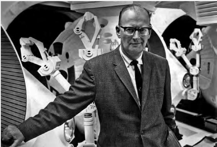
1. Arthur C. Clarke during the filming of 2001: A space odyssey (February 1965)