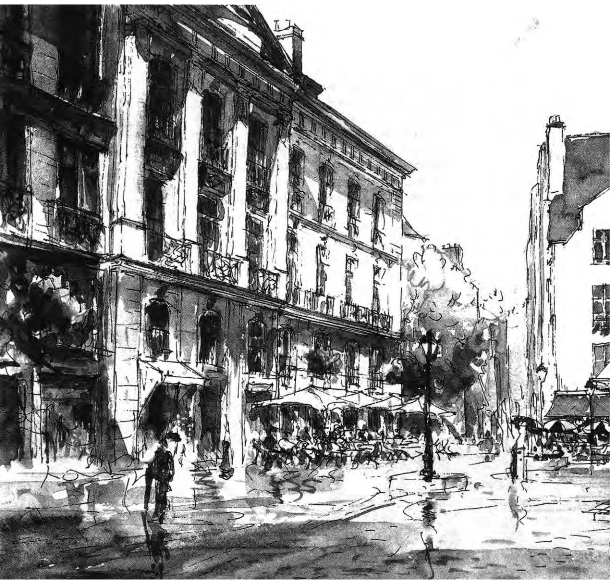
12. Verne's first school, on Place du Bouffay

Pierre also reputedly beat or starved his son, undoubtedly normal in that class and time. However, the father's transition from the unnatural self-mutilation to the pain inflicted on his son may have created doubts about its justice. Even a small boy could wonder whether the brilliant but twisted psyche constituted a fair judge and jury. The paternal violence may have led to the timidity that blighted much of Jules's life.