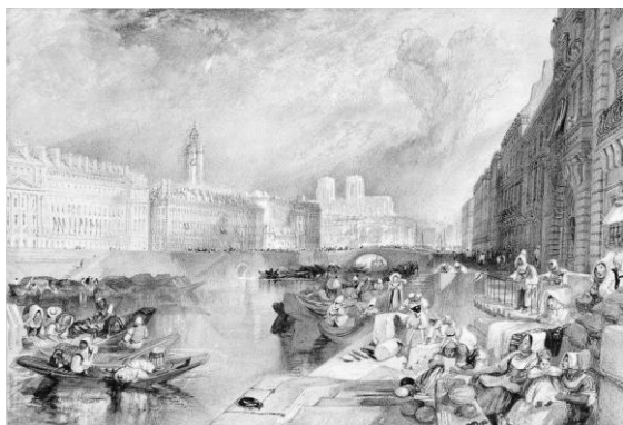
8. Nantes from Feydeau Island (JWM Turner, 1828)

For the banquet, although really it should be the debauched Au-