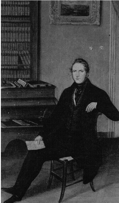
11. Pierre Verne (1799–1887), Musée Jules Verne, Nantes (François de la Celle de Châteaubourg)

The quayside promenade had walls higher than Jules's head, with tempting slippery steps down to the sewage-laden water, his mother's nightmare. But the boy's attention was especially captured by a man who hired boats at a franc a day. True, the boats had water sloshing around, but one of them, he noticed, had three masts, just like the real luggers (MCY). Jules was already a keen boat-spotter,