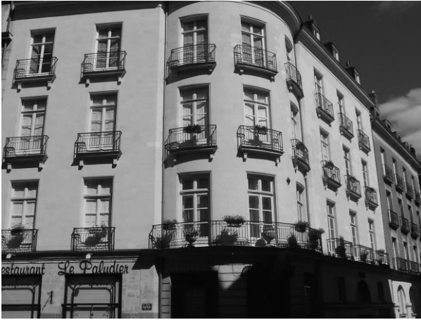
6. Uncle Châteaubourg's on Rue Jean-Jacques