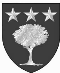
5. The Verne coat of arms