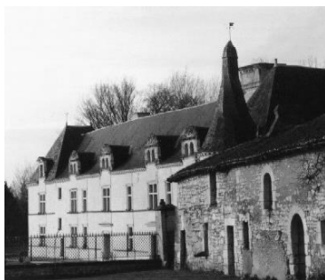
9. Château de la Fuÿe

Fortunately an unsuspected cornerstone survives. A building purporting to be the Château de la Fuÿe, the home of the Allotte de la Fuÿe family, is still standing, on the southwestern outskirts of Loudun. Curiously, no biographer has thought of looking it up in the phone book. The surprise on locating the building could not be greater than that of discovering Captain Nemo a pensioner in a seaside boarding house.