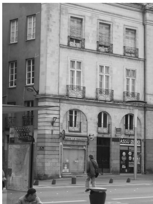
7. Verne's birth place on Rue de Clisson