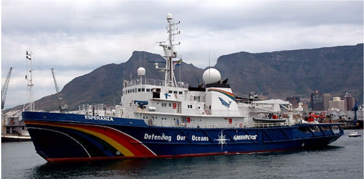
The ESPERANZA in the port of Cape Town

"We are facing a growing wave of ocean extinction, our seas have reached a tipping point with scores of species of fish, birds and mammals edging toward extinction," he said.