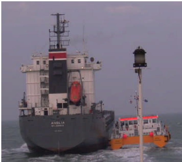
The new pilot tender CETUS seen here during trials at Maaspilot station