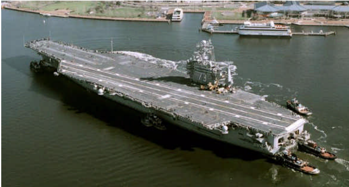
The USS GEORGE WASHINGTON (CVN 73)

The Navy has decided to send the Norfolk-based aircraft carrier George Washington to Japan to replace the aging carrier Kitty Hawk when it is retired from service in 2008, a senior defense official said Thursday.