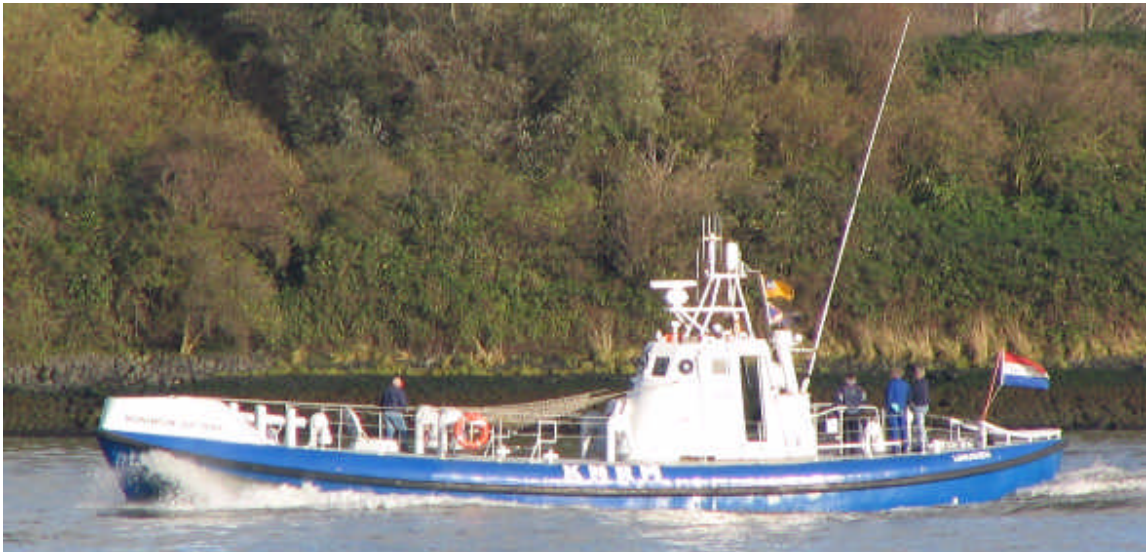
The museum-lifeboat KONINGIN JULIANA seen here enroute from Rotterdam to Hoek van Holland