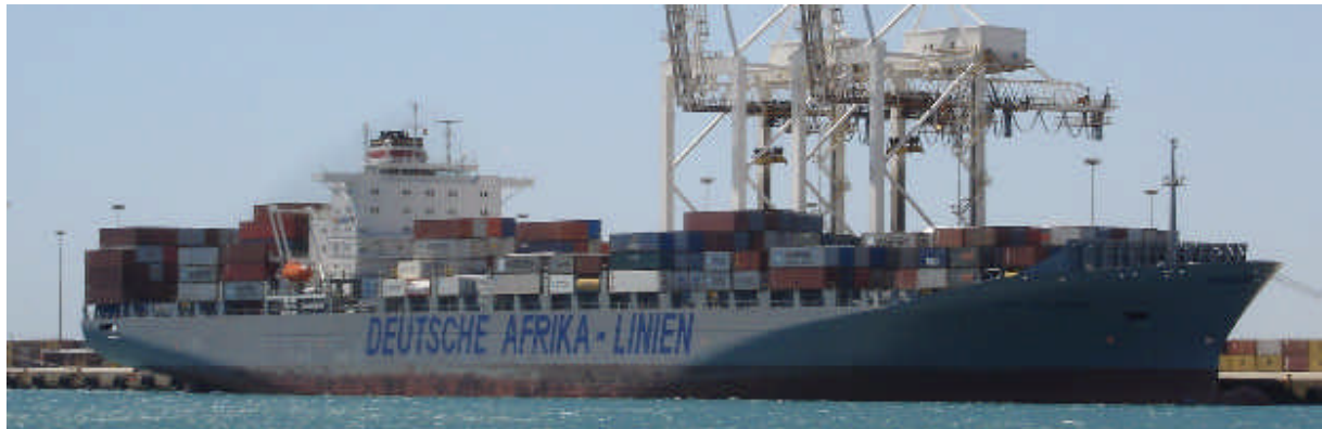
The DAL KALAHARI moored in the port of Cape Town

With effect from 1 February, 2006, MOL acquires the right to enter in the place of PONL into a co-operation agreement with Safmarine, Deutsche Afrika-Linien (DAL), and Maersk Line.