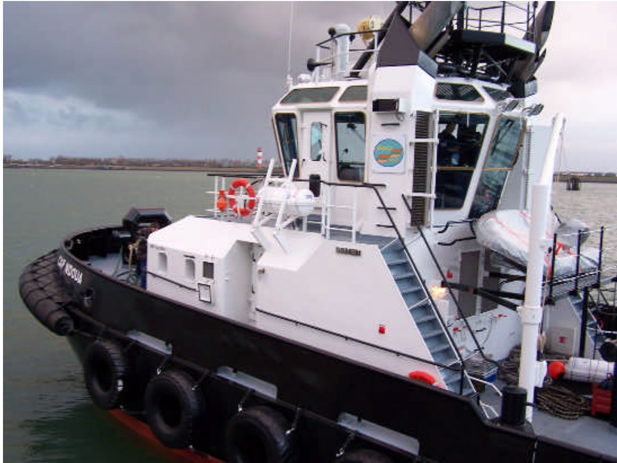
The CAP NDOUA seen during trials in Rotterdam-Europoort