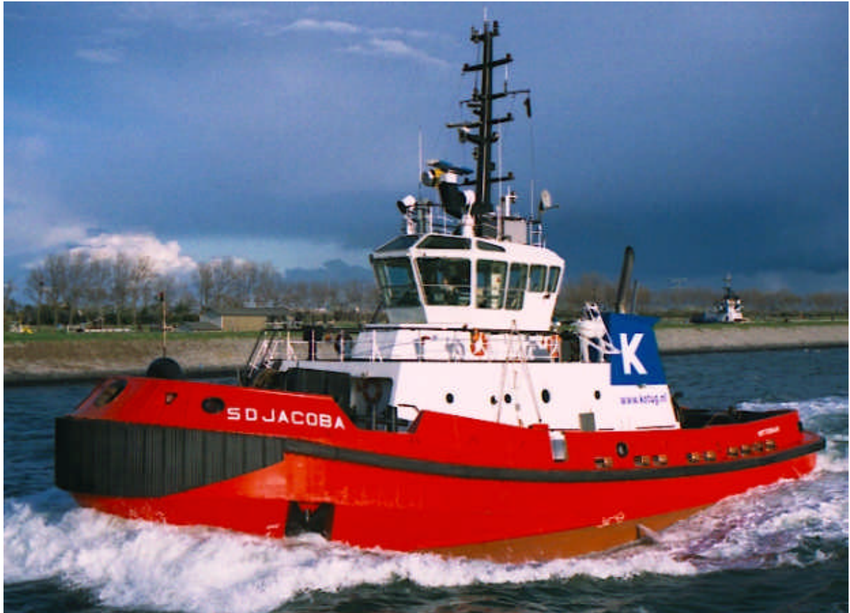
The SD JACOBA seen in the Europoort – Photo : Willem Koper ©