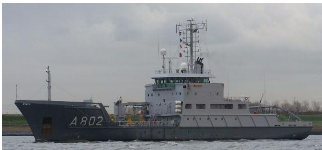
The Dutch AGOS A 802 SNELLIUS

VLIERODAM, STRONG QUALITY IN LIFTING AND HOISTING EQUIPMENT.