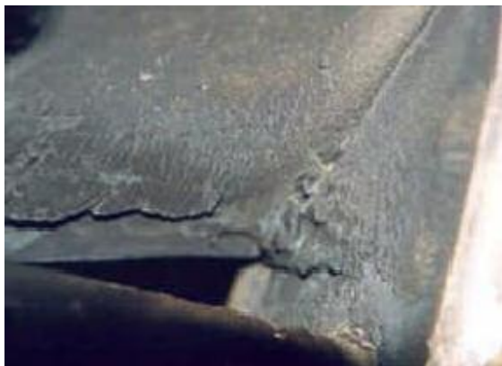
Before using RENERGI

>> RENERGI will increase the efficiency of the combustion process.