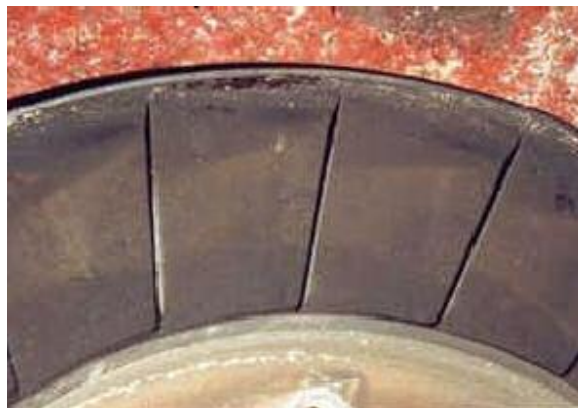
After using RENERGI