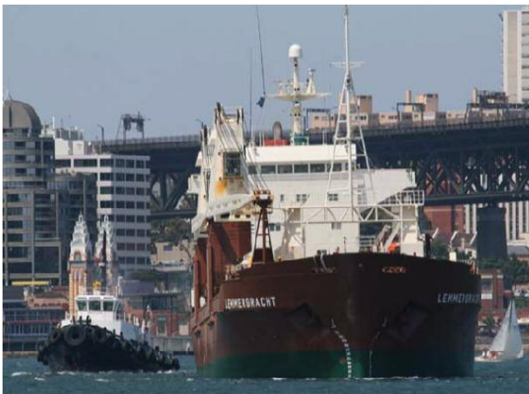
Spliethof's LEMMERGRACHT seen arriving in the port of Sydney, after Sydney the vessel is proceeding to Melbourne and Esperance (Australia)

The 2003 built NATACHA C is owned by Carisbrooke and built at the Damen Shipyard in Galatz under number 1003, the vessel measures 145.6 mtr in length and 10621 DWT, the general cargo vessel is flying the British flag.