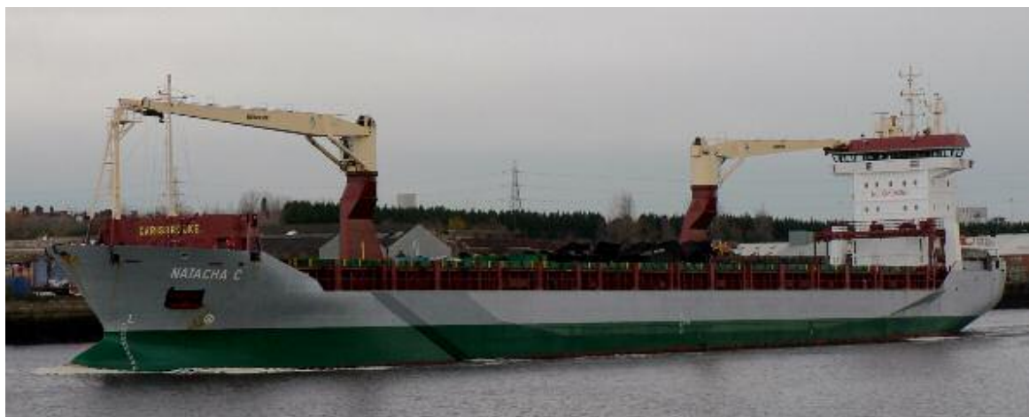
The NATACHA C seen arriving on the Tyne

The 2003 built NATACHA C is owned by Carisbrooke and built at the Damen Shipyard in Galatz under number 1003, the vessel measures 145.6 mtr in length and 10621 DWT, the general cargo vessel is flying the British flag.