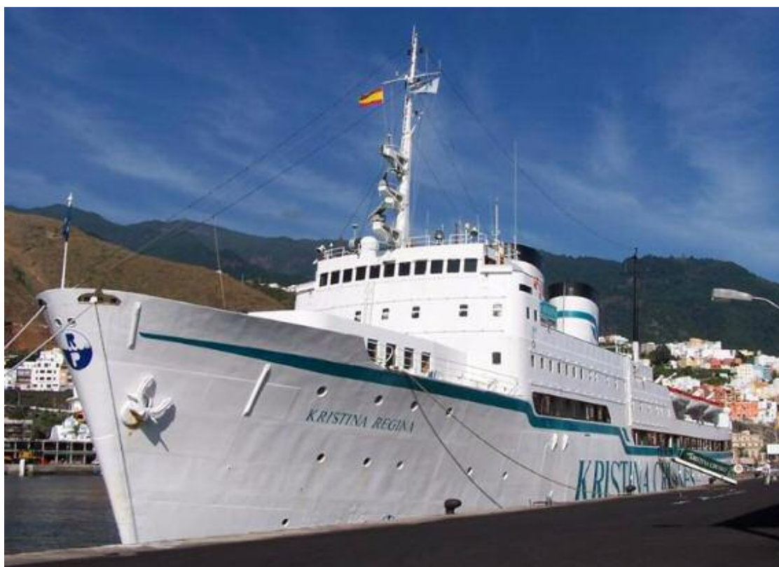
The KRISTINA REGINA seen in the port of La Palma

The vessel departed later Saturday for an eight-day trip to Costa Maya, Mexico; Limon, Costa Rico; and Colon, Panama, returning Dec. 3.