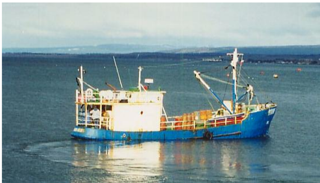
A crab fishing vessel seen operating at Punta Arenas (Chile)