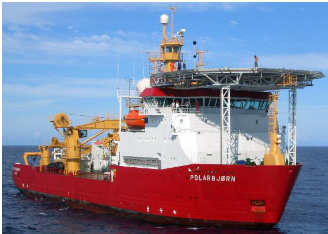
The POLARBJORN

Sealand Express is the best known of all five ships to South African readers. She spent some years on the US - SA service until one fateful stormy night in August 2003 when she went aground in Table Bay. After a protracted but successful refloating conducted by Cape Town's Smit Salvage , the ship was taken to Durban where she became a lucrative repair job in the Durban dry dock, with a large amount of South African steel fitted permanently to her hull bottom. Having been replaced by Sealand Liberator in the interim, Sealand Express was then withdrawn from African waters.