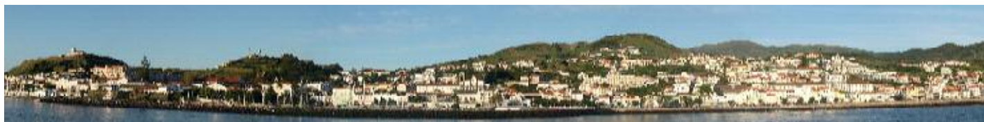
A panoramic view of Horta at the island of Faial (Azores)

"It was covered with lead lamination to conceal it from radar," said Peralta. The tubes protruding from the boat turned out to be exhaust pipes rather than snorkels.