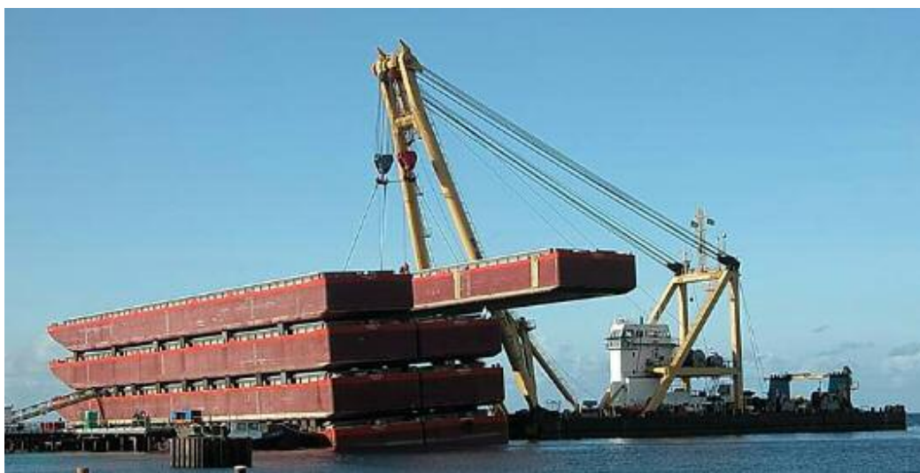
The TAKLIFT 7 started offloading the barges in Caracas bay (Curacao)

After seven hours rescue efforts, the powerless ship was pulled over to safe area and all 37 endangered sailors aboard were saved. Also on Wednesday, the rescuers with the Beihai bureau of the Ministry of Communications handled another four boat accidents caused by strong wind in Bohai Sea, saving a total of 41 sailors.