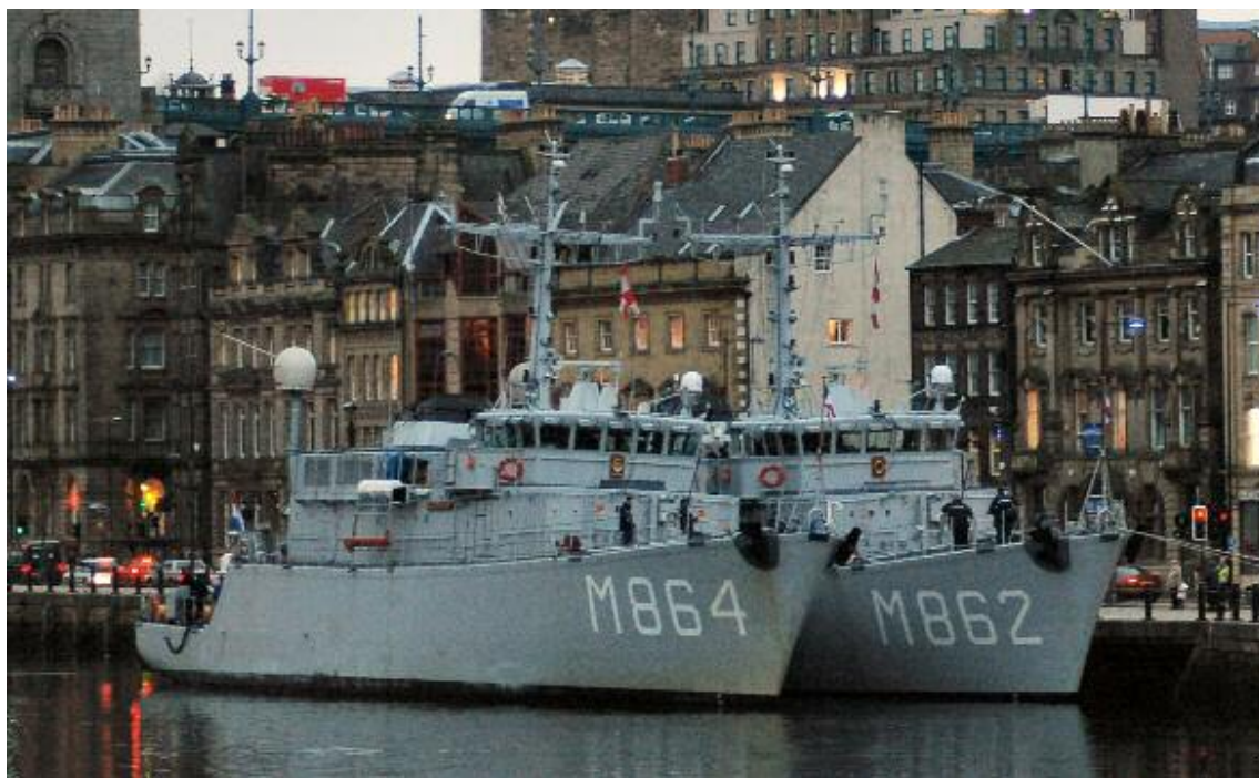
The Dutch Mine counter measure vessels M 864 WILLEMSTAD & M 862 ZIERIKZEE arrived in Newcastle's Quayside for a port visit.