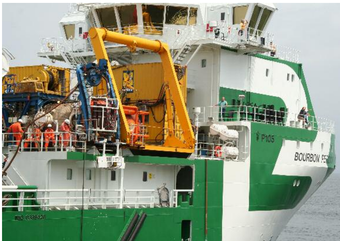
The BOURBON PERIDOT

The compiler of the news clippings disclaim all liability for any loss, damage or exense however caused, arising from the sending, receipt, or use of this e-mail communication and on any reliance placed upon the information provided through this free service and does not guarantee the completeness or accuracy of the information. If you want to no longer receive this bulletin kindly reply with the word "unsubscribe" in the subject line.