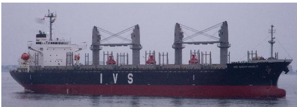
The IVS NIGHTINGALE seen departing from Callao port

Het nieuwe cruiseschip Norwegian Pearl arriveert woensdag 29 november in Rotterdam. Het schip vertrekt diezelfde middag om 17.30 uur voor een korte trip op de Noordzee. Donderdagmorgen vroeg komt ze weer binnen, donderdag einde middag gaat ze weer weg.