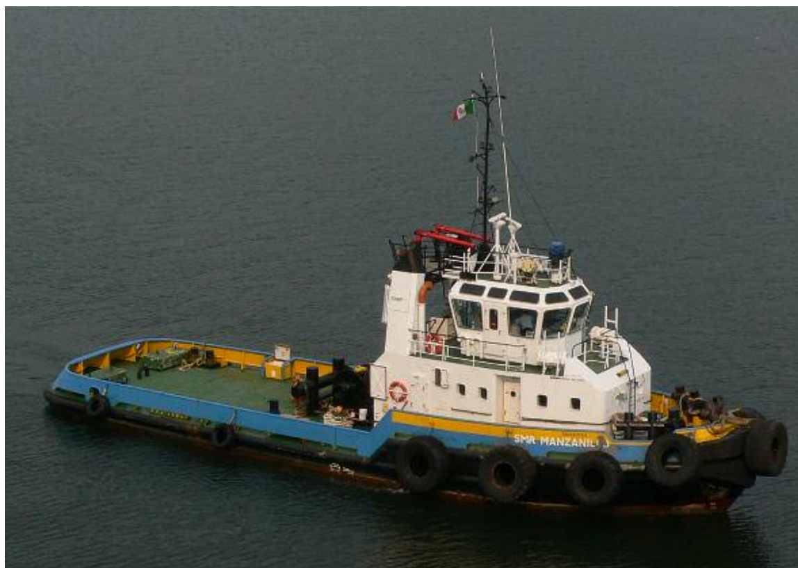
The SMR MANZANILLO is operating in the port of Manzanillo (Mexico)