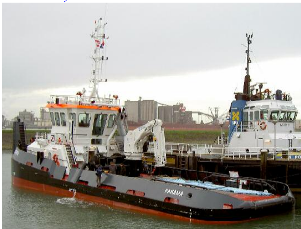
The IHC new building SARBAS seen in the Scheurhaven in Rotterdam-Europoort