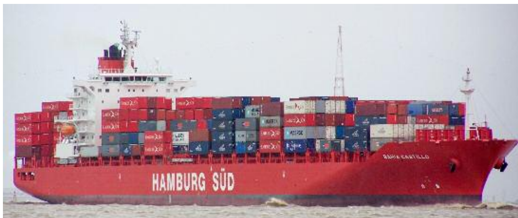
Hamburg-Sud's BAHIA CASTILLO seen departing from Rio Grande