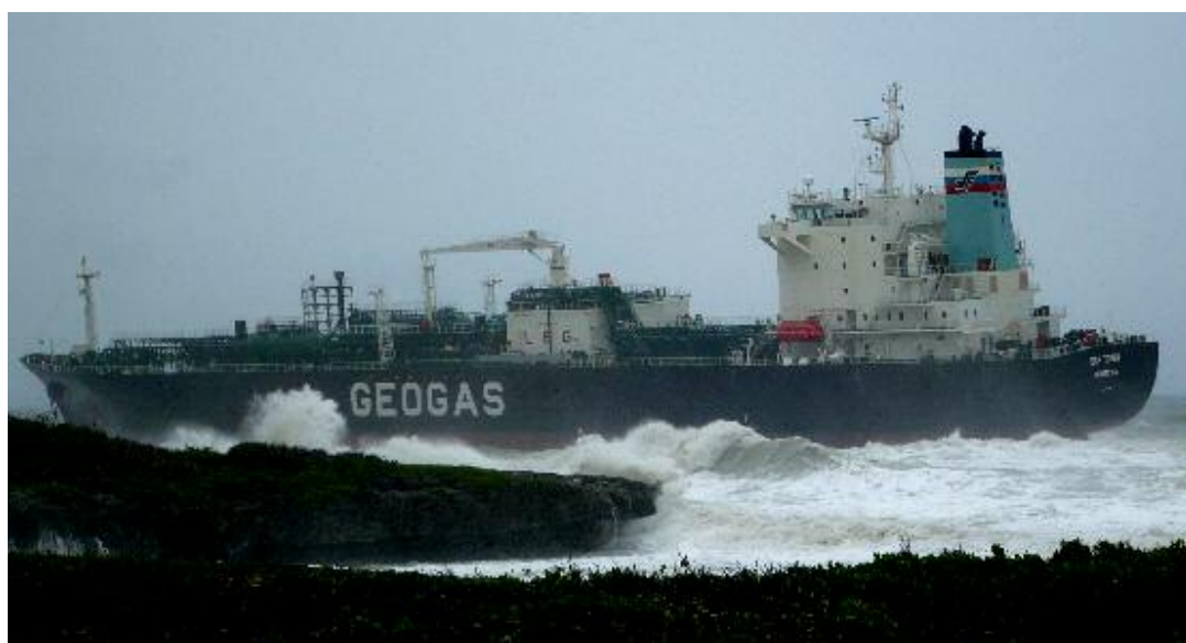
The SCF TOMSK seen aground at the Dominican Republic coast, TITAN Salvage is awarded the salvage contract

Tel: +31 115 645000 - www.multraship.com