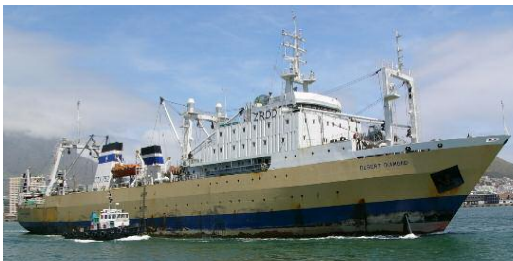
The DESERT DIAMOND seen departing from Cape Town