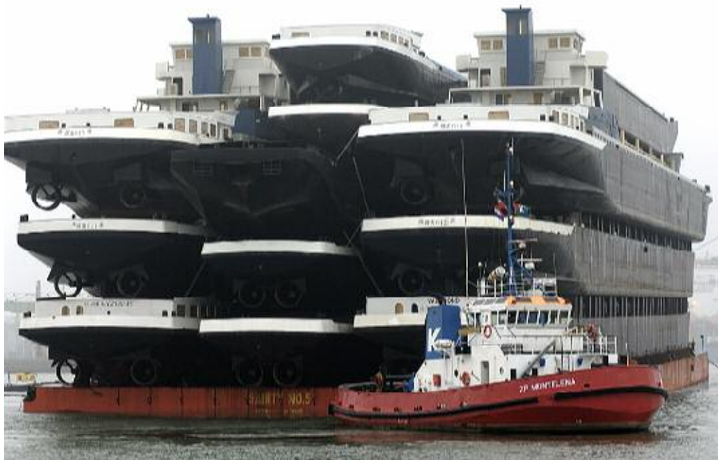
The loaded SAINTY No 5 seen arriving in Rotterdam-Waalhaven