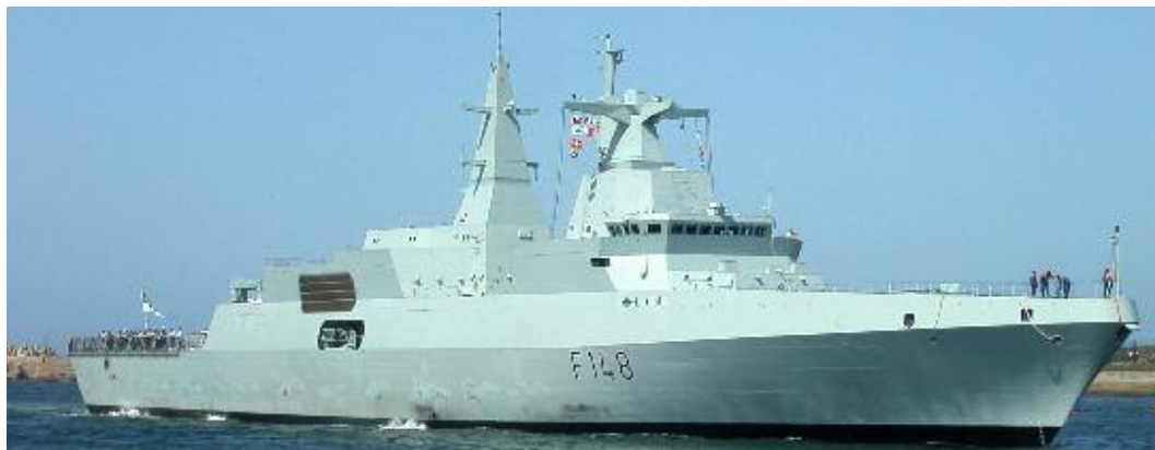
The present SAS MENDI

To kickstart the event, Minister Pallo Jordan and other dignitaries will officially open the SAS Mendi for public viewing.