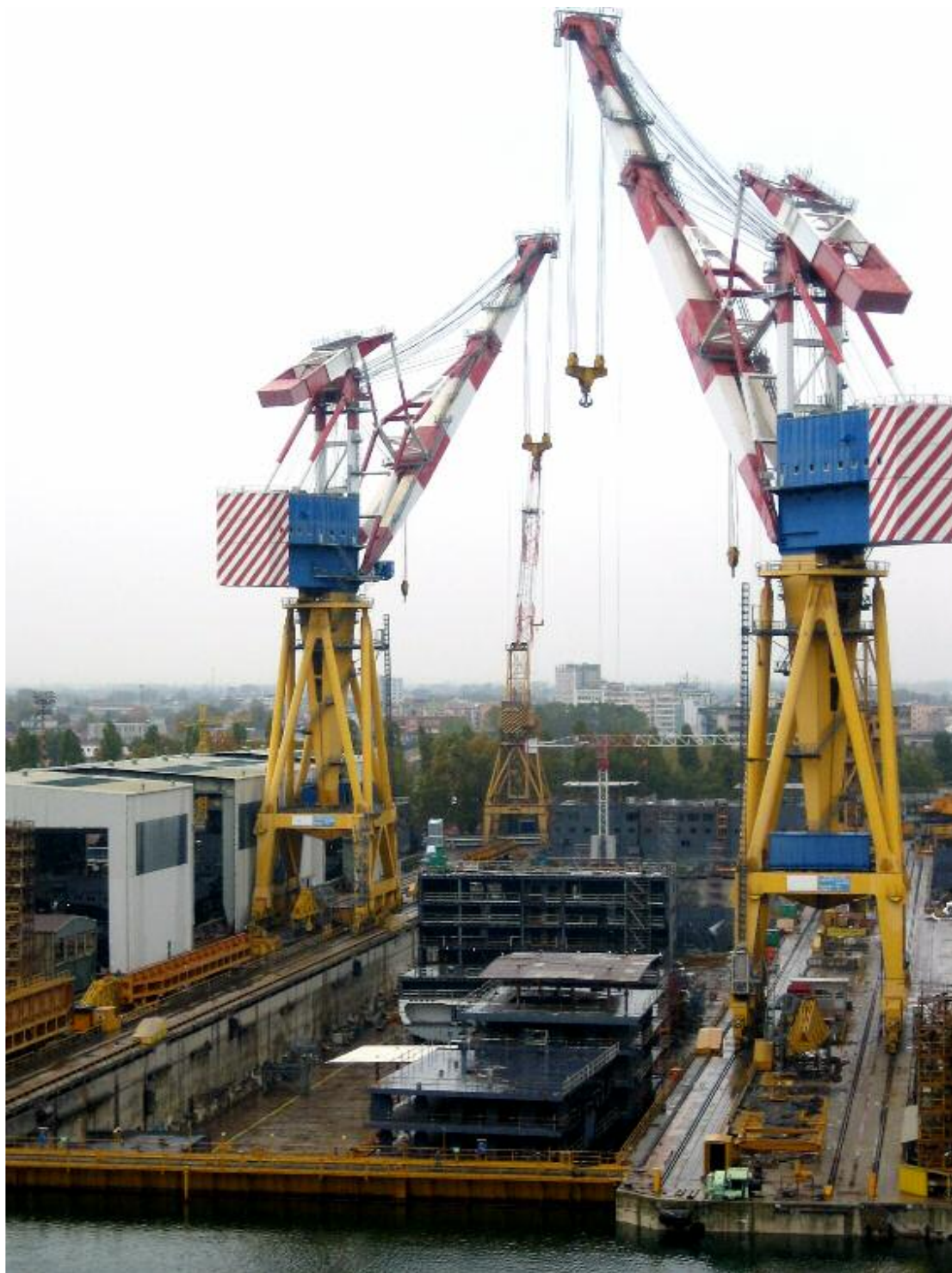
Newbuilding hull 6155 ( for COSTA CRUISES ) seen at Fincantieri in Marghera