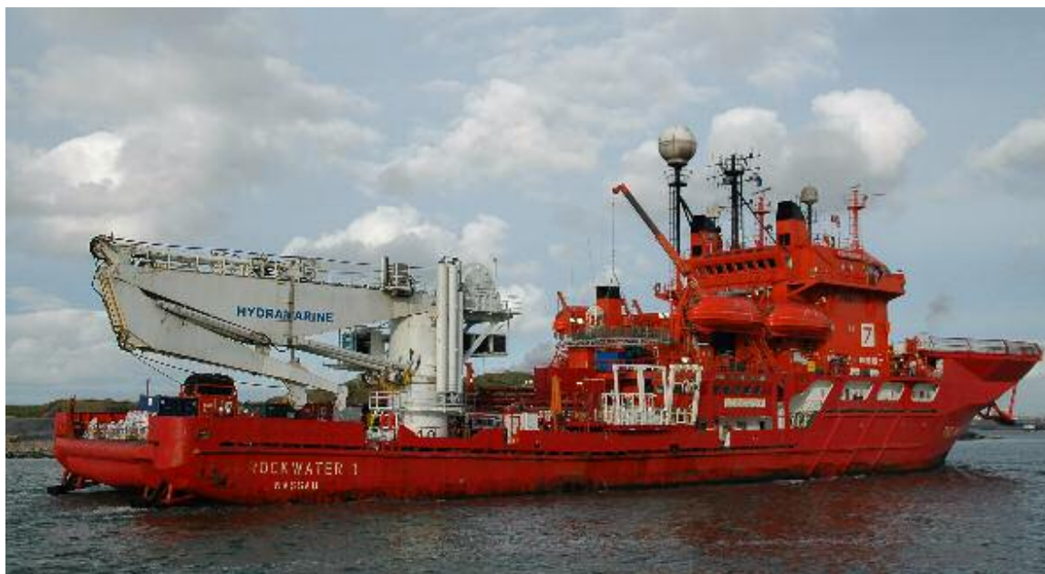
The ROCKWATER 1 seen arriving in Ijmuiden

The compiler of the news clippings disclaim all liability for any loss, damage or expense however caused, arising from the sending, receipt, or use of this e-mail communication and on any reliance placed upon the information provided through this free service and does not guarantee the completeness or accuracy of the information. If you want to no longer receive this bulletin kindly reply with the word "unsubscribe" in the subject line.