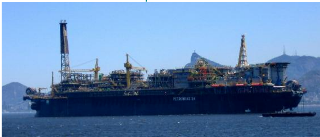
The PETROBRAS 54 seen in Rio de Janeiro

The consortium of Keppel FELS Brasil S/A and Technip Brasil Engenharia, Instalacoes e Apoio Maritimo S/A (Technip), FSTP Pte Ltd, has secured a $1.2 billion contract to build a semisubmersible Floating Production Unit (FPU) for Petrobras Netherlands BV (PNBV).