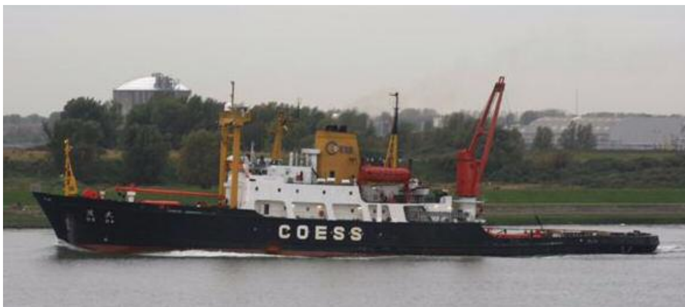
The DE-DA seen arriving in Rotterdam