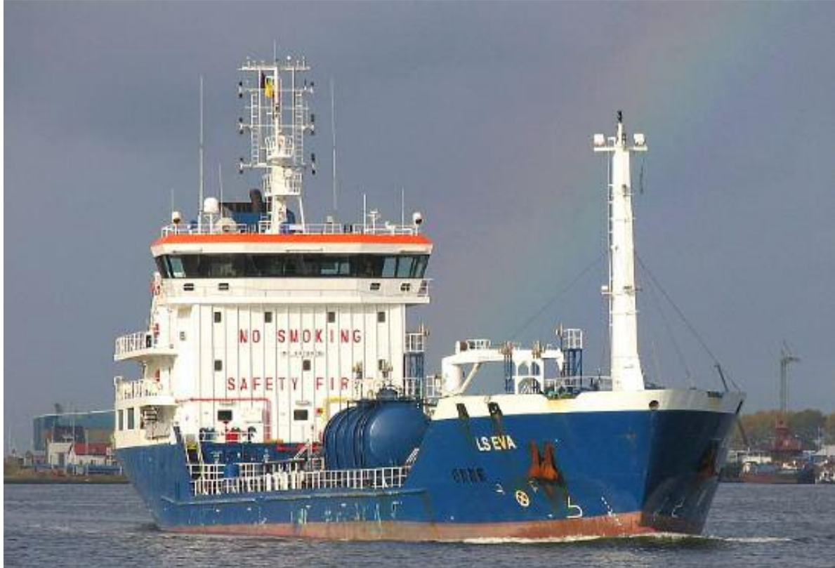
The LS EVA seen at the Westerscheldt River

some 280,000 barrels of water in the reservoir, the P-56 will be connected to 22 wells, 11 of which are oil and gas producers and 11 are to inject water. Source : MarineLink