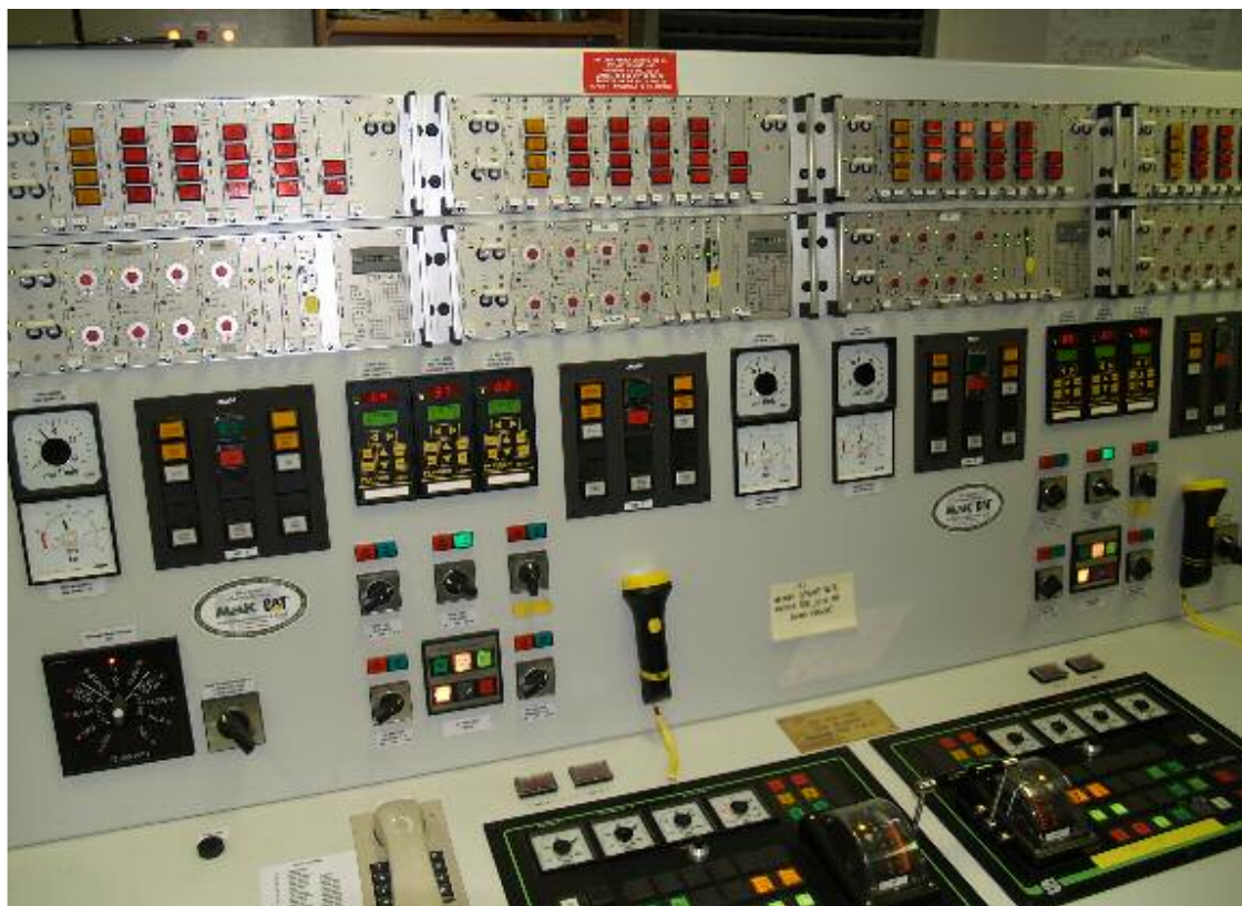
The Engine room control stand in the engine control room