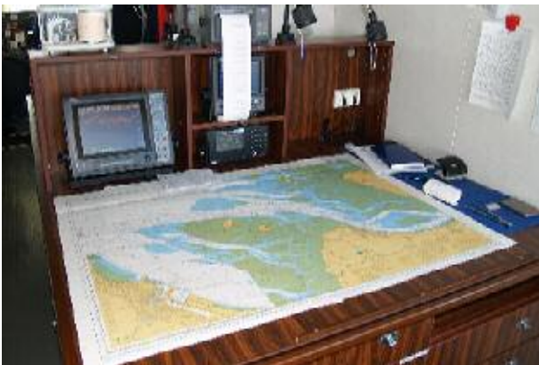
Top : the Chart table

Left: the Main manoeuvring console in front of the wheelhouse.