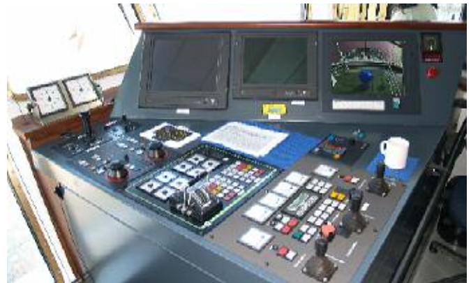
Top : The PS aft manoeuvring consol

Distribution : daily 3320 copies worldwide