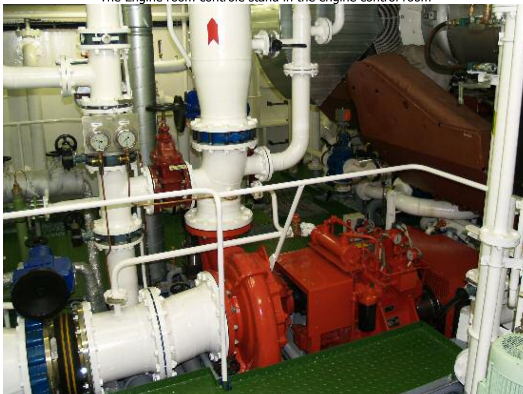
Above seen the one of the 2 Fire fighting pumps with a capacity of 1.200 cbm/ hr. at 14 bar also driven by the main engine.