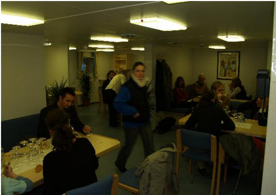
The JANUS is having Air-conditioned spaces for 27 Persons, consisting of 7 officers cabins, 9 crew cabins, galley, mess, stores and sanitary spaces