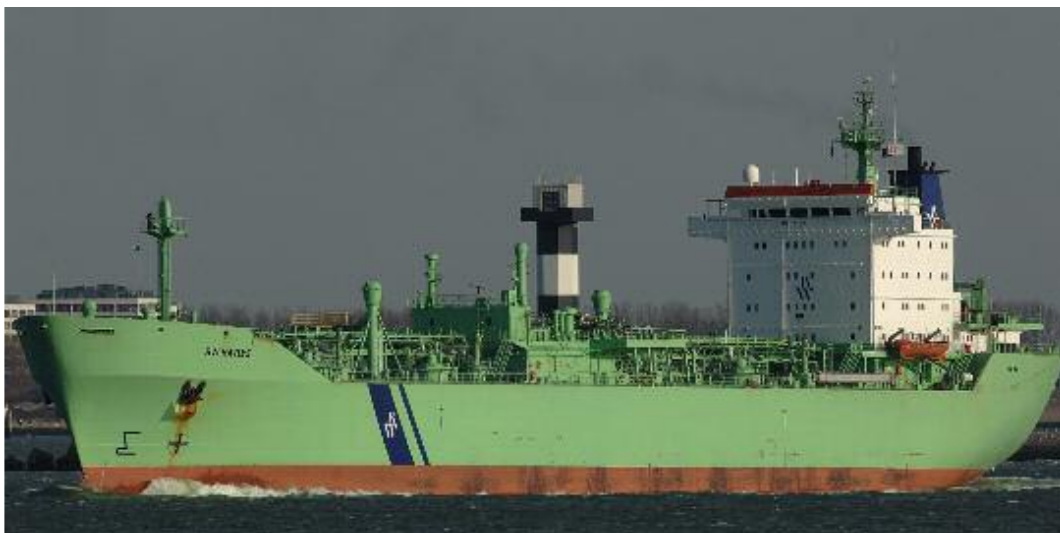
The BW HAVLYS seen outward bound from Rotterdam Photo : Fred Vloo ©

South Tyneside College is one of only a handful of training organisations across the world to offer a live link-up between the bridge and the engine room. To find out more, please contact the information centre at South Tyneside College on (0191) 427 2900, www.stc.ac.uk . Source : Shiptalk