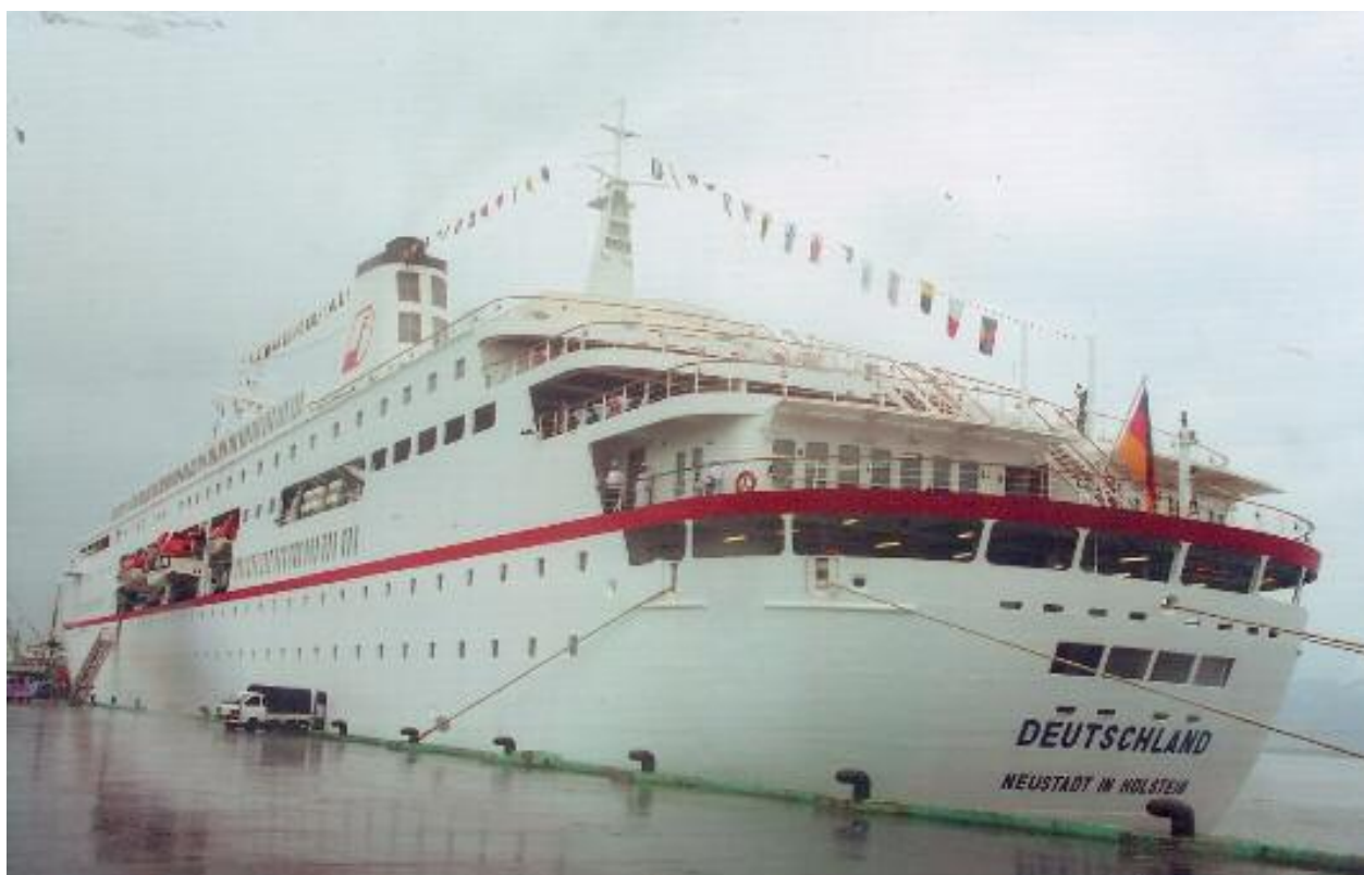
The DEUTSCHLAND visited a rainy Puerto Princesa City (Palawan) Philippines

Asked whether or not the group would ask for ransom, the man said: "It has been the tradition to take ransom payment, but we will bring these ships in front of the law." A spokesman for the Puntland administration said security forces have been dispatched to Eyl to oversee release efforts. Puntland Fisheries Minister Ahmed Said O'Nur condemned foreign ship owners for contacting and "dealing directly with pirates." Source : allafrica.com