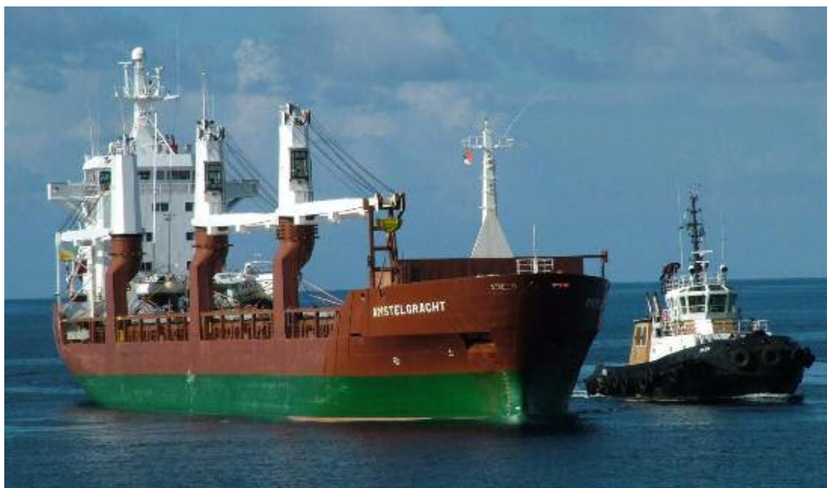
The AMSTELGRACHT arrived in Willemstad-Curacao with as deck cargo some yachts

Compagnie des Iles du Ponant currently operates three luxury cruise yachts, Le Ponant, Le Levant and Le Diamant with respectively 32, 45 and 115 cabins each. Source : MarineLog