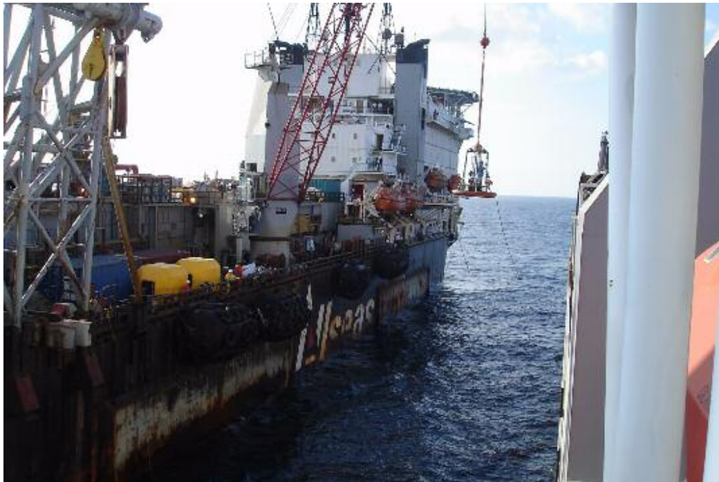
Transfer of crew between Allseas vessels Lorelay & Calamity Jane