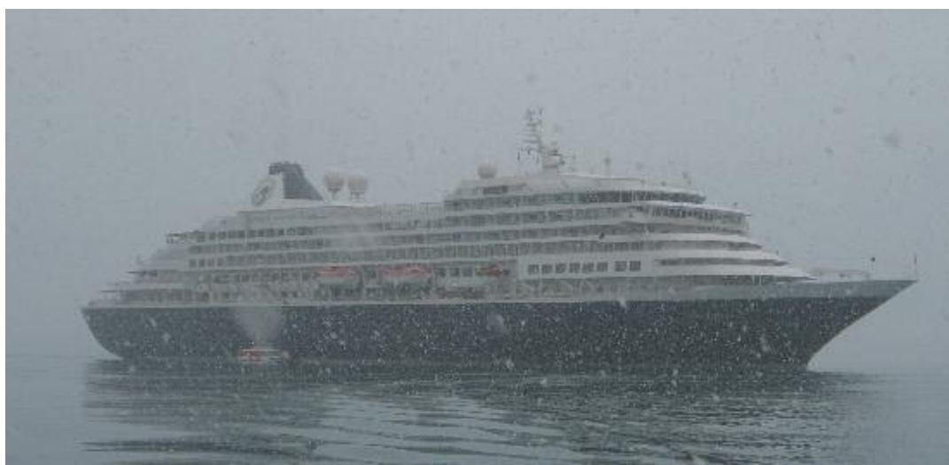
MS Prinsendam seen in the snow anchored off Cumberland Bay, South Georgia

He said the work contracts signed by the seafarers in Manila, which stipulate a monthly wage of 0 with overtime pay, were changed by their agency in Singapore. Source : ShipTalk