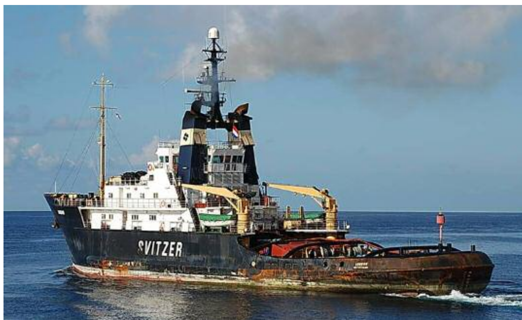
SVITZER's LONDON seen departing from Willemstad – Curacao

Telephone : + 31 2555 627 11 Telefax : + 31 2355 718 96 E-mail: oceantowage.sales@svitzer.com