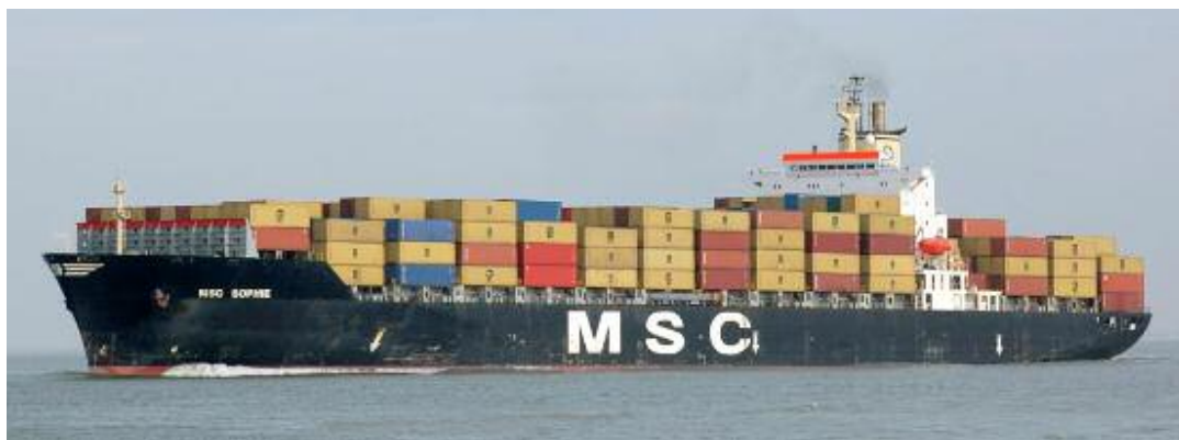
The MSC SOPHIE seen at the Westerscheldt River