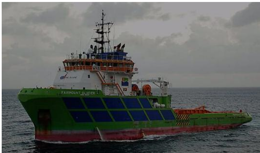
The FAIRMOUNT GLACIER seen arriving in Willemstad-Curacao