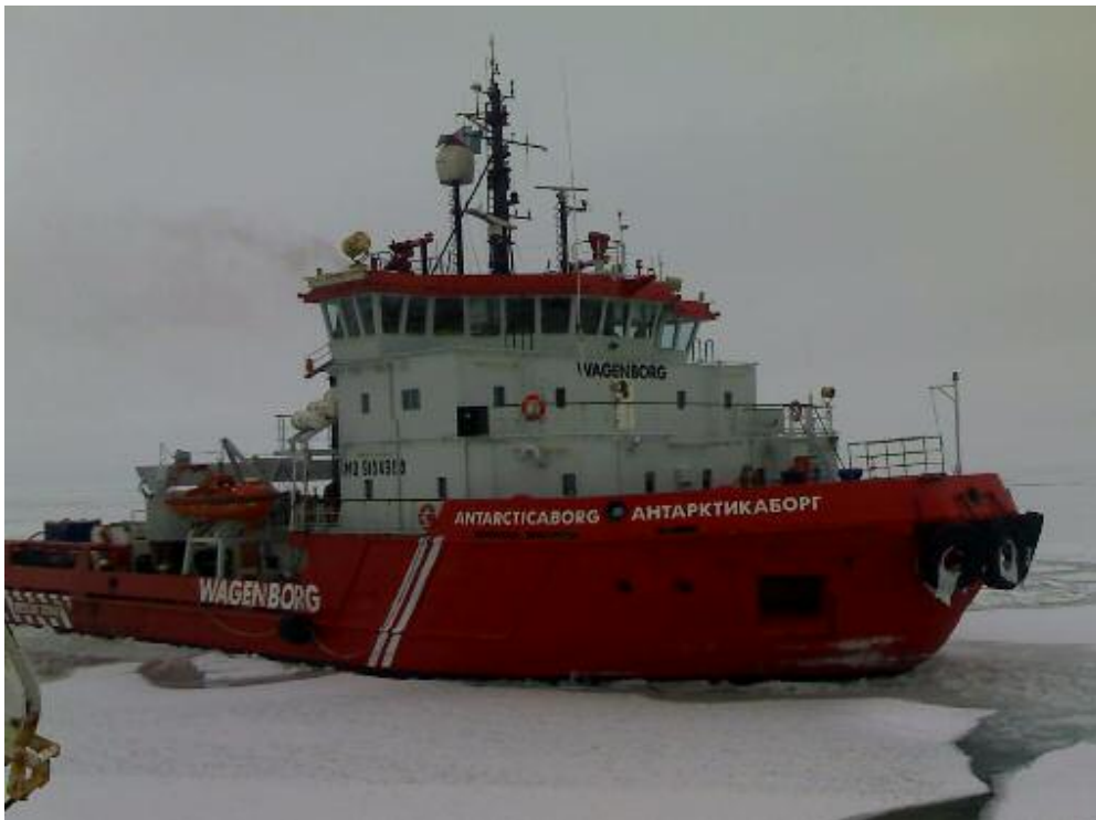
The ANTARCTICABORG in the North Caspian Sea

A year on from the grounding of the containership MSC Napoli the Prairie Machine & Parts Manufacturing (PMPM) of Saskatoon is taking action to seek damages for the loss of cargo. The company filed a claim on 1 February against Paltainer, a Canadian freight forwarding company, held liable by PMPM to deliver a mining equipment shipment safely to South Africa. The claim is for in excess of C$2M ($2M) for what PMPM says is a breach of the terms of carriage and the continuing refusal of the company to compensate the company, although a Paltainer spokeswoman told Fairplay, "Our president is not making any comment about the Napoli at present." The PMPM shipment comprised a 66-tonne mine conveyor system loaded into five containers, of which four ended up on the Napoli . So far Paltainer, which is a subsidiary of the Ontario-based Manitoulin Transport, has not filed a defence statement. The consignee paid a $1M deposit in November 2005 and a further $1M on completion of the system a year later. PMPM award the transport contract to Ghost Transportation, which in turn used Paltainer to arrange the shipment. Source : Lloyds-Fairplay Daily News