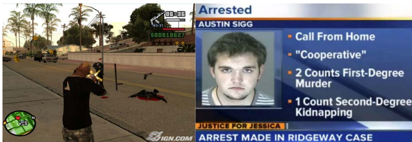
Figure 1: virtual and actual murder

What this figure— a composite of two files culled from Google Images— tries to provoke is the specific difference between virtual and actual murder. On the left is a screenshot from a video game, and the right frame shows a typical newscast report of the arrest of a suspect in a murder investigation. Since the two terms “social” and “cultural” are often synonymous with each other in discourse, and so slippery or tricky to disentangle, we need a handle, and this seems to be a good one (real vs. actual murder), a “great place to start” so to speak, since we can immediately align “the social” with the image on the right – the social process of identifying a suspect, police forces, laboratory evidence, court proceedings, in short, all that we would normally mean by Society in this kind of situation – whereas the image on the left is clearly a piece of Culture, as the murder is NOT real but virtual, occurring in an imaginary zone of action that does not call forth the forces of Society but does of course mobilize industries of cultural production which produce these kinds of virtual cultural objects, such as video games, films, books and so on where murder or anything else, because of its virtuality, is contained or sanctioned or cordoned off from the real in some way.