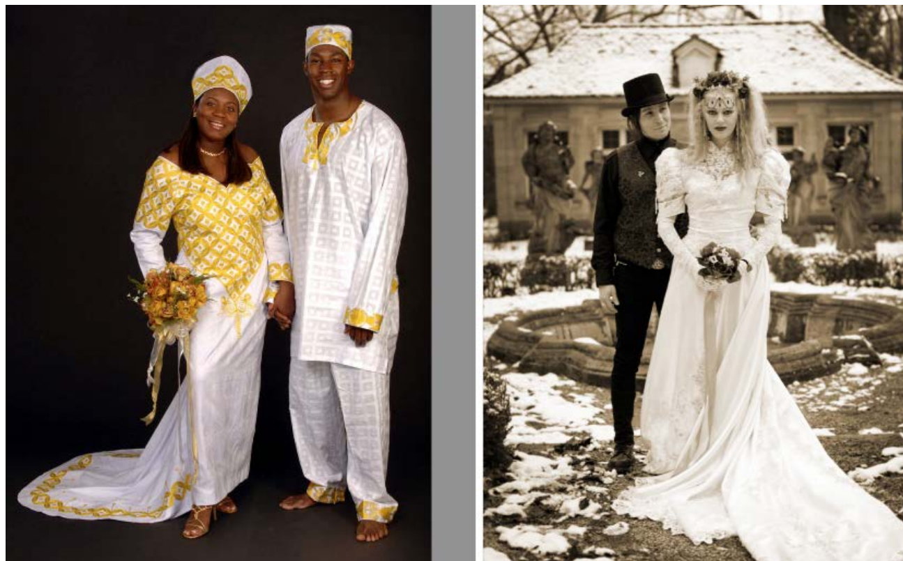
Figure 3. Photos of two wedding ceremonies

crowd; a rhythm of upraised arms and clenched fists; mouths open in loudly vocalizing chants, slogans or songs; taking to the streets and blocking vehicular traffic, a gesture of interrupting the day-to-day routines of normality; camera-friendly dispositions (the wish to communicate the message beyond the scene); a self-to-crowd gradient, with individual members more-to-less “into it” as shown by some bemused or detached individuals in the crowd. This is a general form of social protest found around the world, perhaps somewhat stabilized from the circulation of images as to how these kinds of social protest acts are to be performed. Imaginative variation can be performed on any number of social formations. Here are other photographs from Google Images, of two heterosexual weddings: