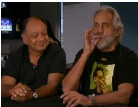
Figure 6. Marijuana legalization media, Cheech and Chong

Culture, as actual-virtuals, can mobilize with much less “drag of the real” than anything social. Laws are virtualities as well – ink on paper like anything else that can be textually imagined – but laws are different from circulating culture because they are wired directly into force, the social mobilization of the real. Sociologist Anthony Giddens, in his highly influential theory of structuration, attempted to create a conceptual balance between human agency and social structures of opportunity. Yet Giddens’ conceptualizations of the virtual social order – that each of us internalizes as patterns and externalizes through actions – tends to argue that social structures are maintained because people keep believing in them. His conception of social structure is: