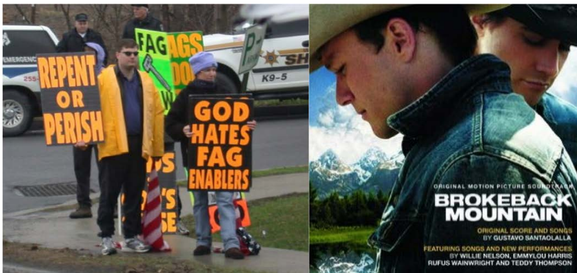
Figure 5. Anti-gay marriage picketing, film poster

The plane of mediation suggests that culture can be conceived as the plane whereby societies work out their transformations in advance, or at least their possibilities for transformation. In our own time, for example, we can track the gradual cultural acceptance of both gay marriage and marijuana use as being prefigurative of changes to social law (organization of the real).