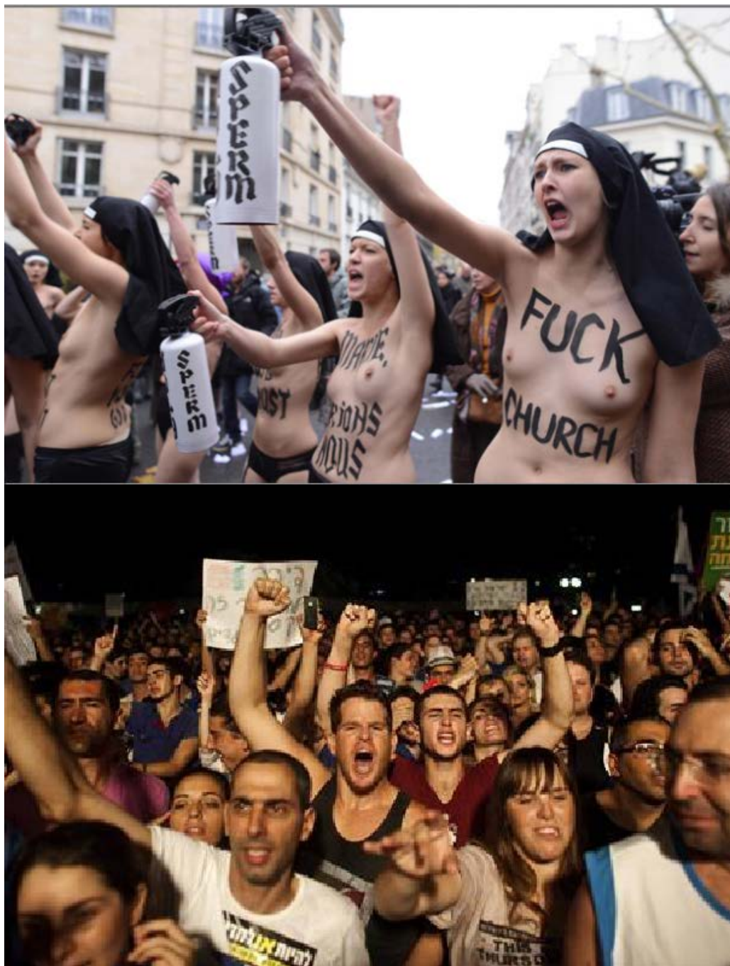
Figure 2. Photos of two social protests

We can further “test” the hypotheses above through imaginative variations. Below are two contrasting images from differing kinds of social protest (obviously hundreds of similar images could be utilized, but two suffice for the point being made):