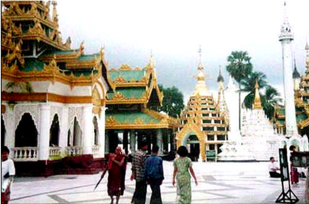
Figure 1. Northeast corner of the Shwedagon platform, showing Htidaw Zeidi (right, with dark glass inserts to see the 19th C AD Htidaw of King Mindon preserved inside) and U Ba Yi Tazaung (left, with concrete arches and balusters)

Tun Aung Chain. 2000. Prophecy and Planets: Forms of Legitimation of the Royal City in Myanmar. Pp. 133-155 in Myanmar Two Millennia Conference, Proceedings (Part 3) Universities' Historical Research Centre, Yangon.