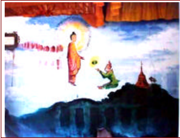
Figure 1a. (left) Mural painting of the traditional visit of the Buddha to Suvannabhumi, showing offering of alms upon His arrival. Painting from Mya Thabeik Zeidi, Bilin Township, Mon State. (right) U Ba Yi Tazaung interior showing standing laterite image of Ashin Gawampati along with other Ashin seated figures and bilingual inscription plaques.