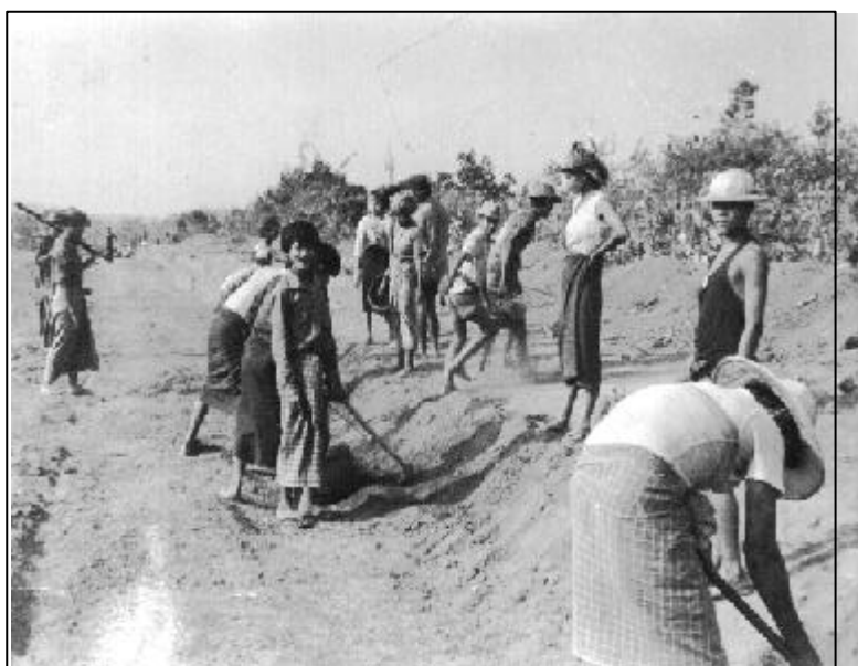
Forced labourers: Conscription of forced labour is widespread in Ye and Yebyu Township area.

Before the road construction started, the authorities from BADP also ordered the local villagers to give some fund and the government could allocate very limited amount of budget. In January, an officer from Department of BADP, Lt. Col. Myint Aye came to this area and called a meeting