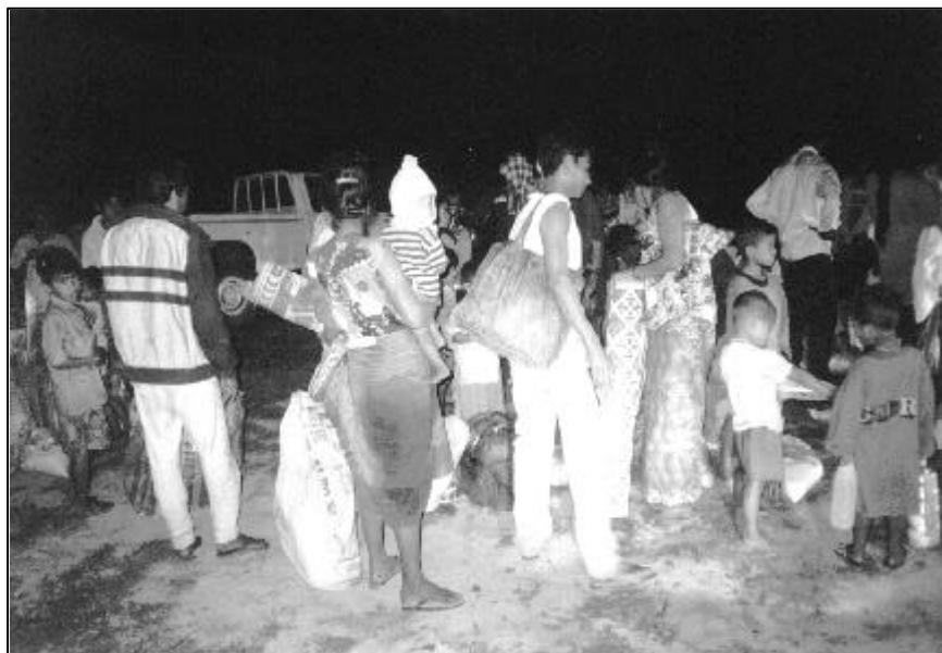
The spontaneous repatriation of Mon refugees from Thailand in 1998

During March and April 2000, Thai authorities have carefully checked the immigrants from Burma with a worry following the hospital seize in Rat-chburi. The authorities met those villagers have no ID cards to officially allow them to stay on in Thailand. On the other hand, since they were Mon people, the authorities did not choose to send them to a refugee camp, but deported them to Mon resettlement site.