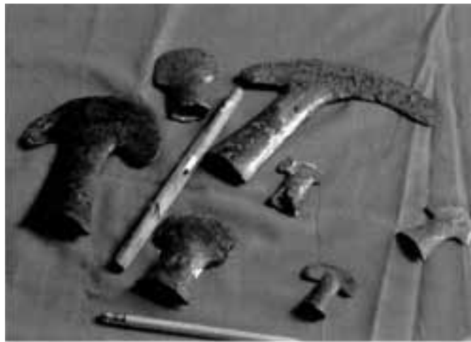
Fig. 5. Some of the bronze tools from the Nyaung-gan site. From left, upper row: National Museum no. 193/14-2 paddle-shaped tool recovered by Chit Hlaing; National Museum no. 193/17-5 burial feature SE6; National Museum no. 193/18-1 halberd from burial feature M5; 193/14-18 small axe recovered by Chit Hlaing; National Museum no. 193/14-16 from burial feature SE12. Front row, from left 193/17-5 from burial feature SE8, recovered in small pot; National Museum no. 193/14-17 from burial NW4.