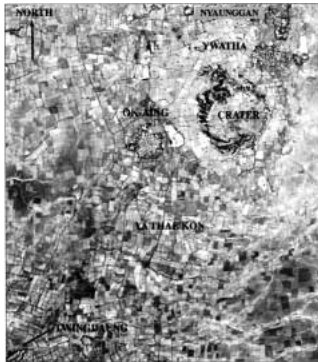
Fig. 1. The Nyaung-gan crater and surrounding villages of Nyaung-gan, Ywatha, and Ok-aing. Ya Thae Kon is seen south of Ok-aing and further to the southwest, the edge of the Twindaung crater.

situated in Budalin Township, Sagaing division, Lower Chindwin district. The area is bounded to the west and south by the Chindwin River and the Pondaung-Ponnyadaung ranges; to the east by the Mu and Irrawaddy rivers ( Burma Gazetteer 1912:1). The Chindwin is navigable for some 400 km north from the site, while the Irrawaddy is navigable year round to Bhamo (Penzer 1922:3-4).