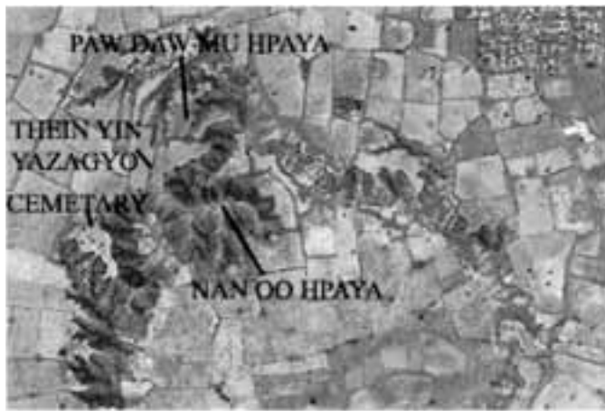
Fig. 3. The cemetery site shown in relation to Nan Oo Hpaya pagoda, the enclosed area of Thein Yin Yazagyo, and the Paw Daw Mu Hpaya pagoda.

shafts about 1 m in diameter, with highly vitrified interiors. Villagers are currently resmelting the refractory lining of these kilns to obtain copper.