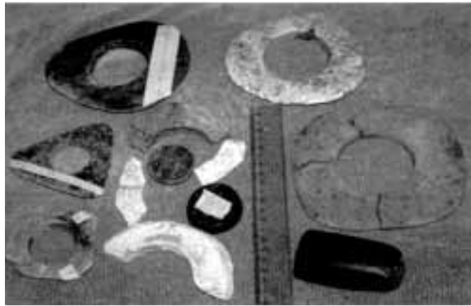
Fig. 4. Stone rings from Nyaung-gan. Black ovoid ring in upper part of picture (from SE pit) is 15 cm long, 13 cm wide, 1.1 cm thick, with a hole diameter of 5.5 cm. Triangular ring on bottom left (from NW pit) is 9.7 cm long, 7.5 cm wide, 1.0 cm thick, with a hole diameter of 3.6 cm. Disc is 3.6 cm in diameter and 0.4 cm thick.

Most of the stone in the Nyaung-gan crater and around Ok-aing is derived from acidic parent lava. Materials provisionally identified include crystalline igneous andesitic rocks, dolerite (diabase), basalt, rhyolite (greenish apatite), serpentine-bearing rock, and silicified tuffs. 4 Quartzes are also found on the crater floor, and around Ok-aing, but were not used for the manufacture of stone rings.