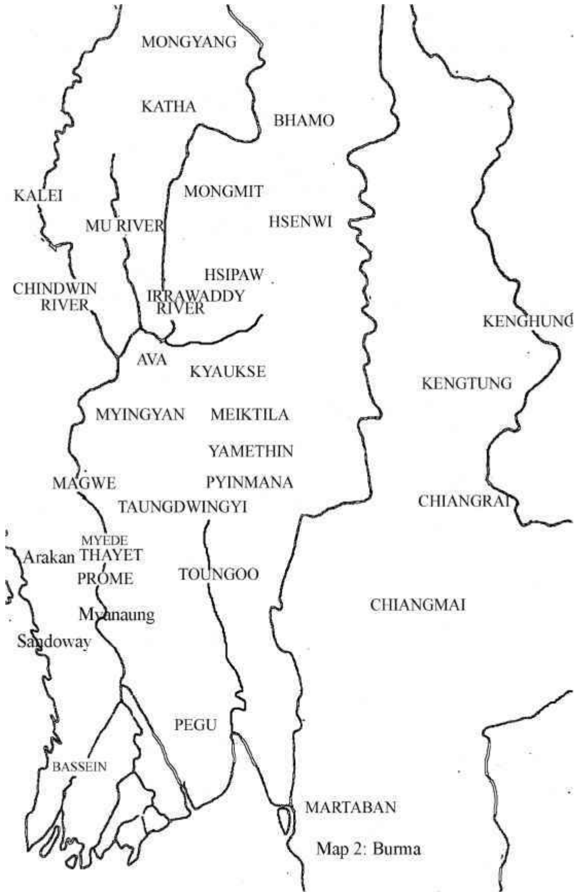
Map 2: Burma