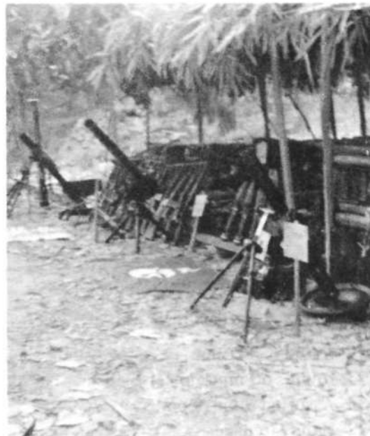
Some arms and ammunitions captured at Ka daing ti.