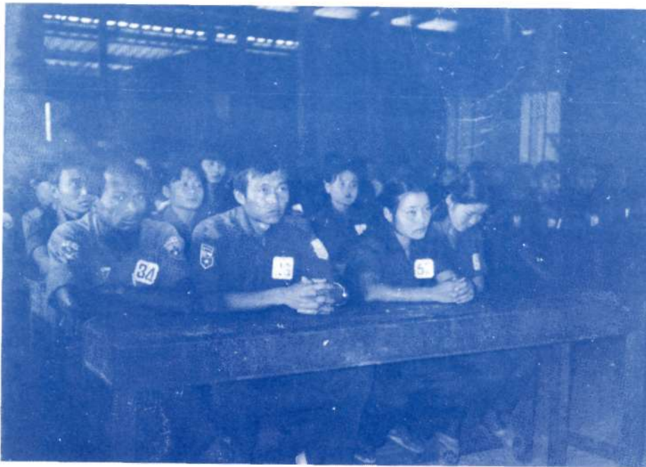
1986/87 Basic Medical Training Class.