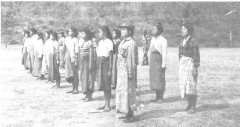
Some young girls at their 1st parade.