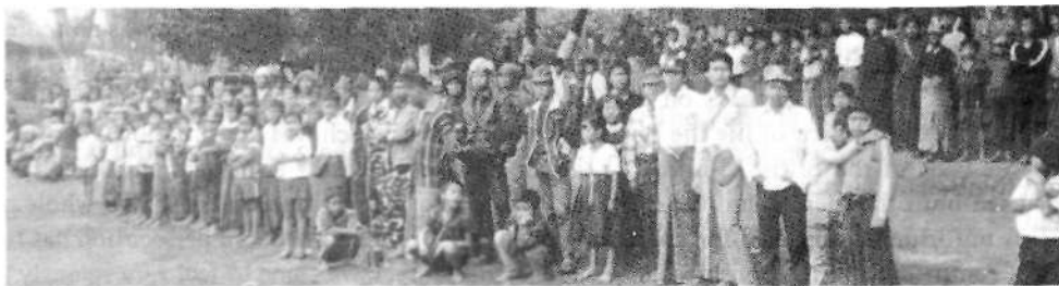
Masses attending 38th Karen Revolution Day at Manerplaw.

The noble and righteous Karen revolution is bound to be victorious.