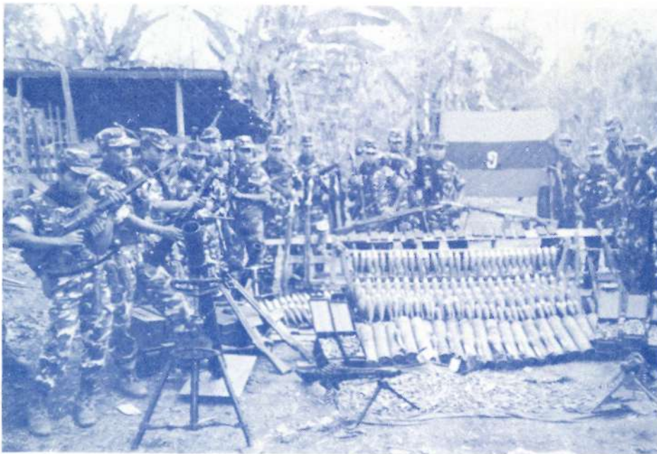
KNLA 7 Bde. captured enemy arms from Ta-la Aw Lu on 26-2-87.