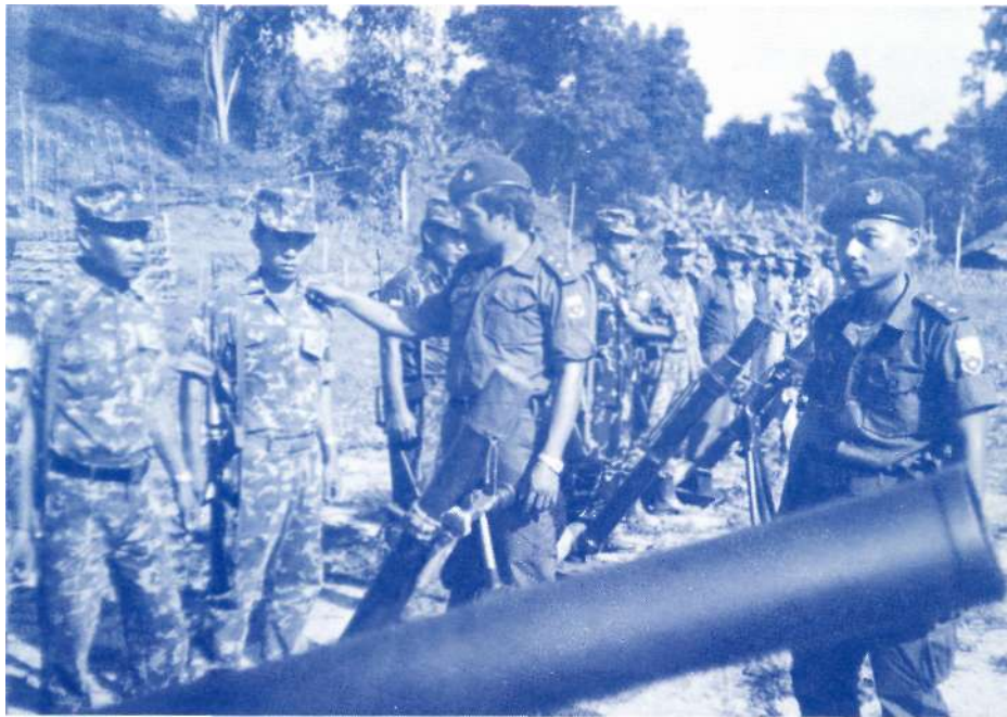
Heavy Arms training at GHQ.