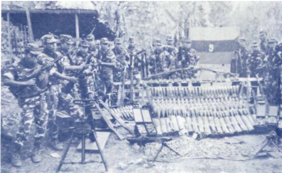
KNLA 7 Bde. captured enemy arms from Ta-la Aw Lu on 26-2-87.