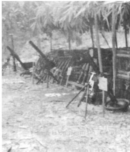
Some arms and ammunitions captured at Ka daing ti.