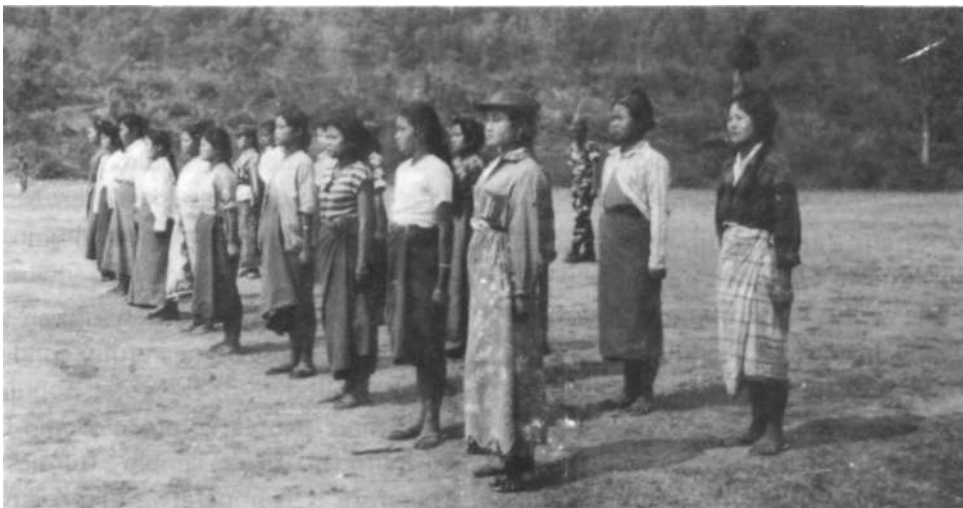
Some young girls at their 1st parade.