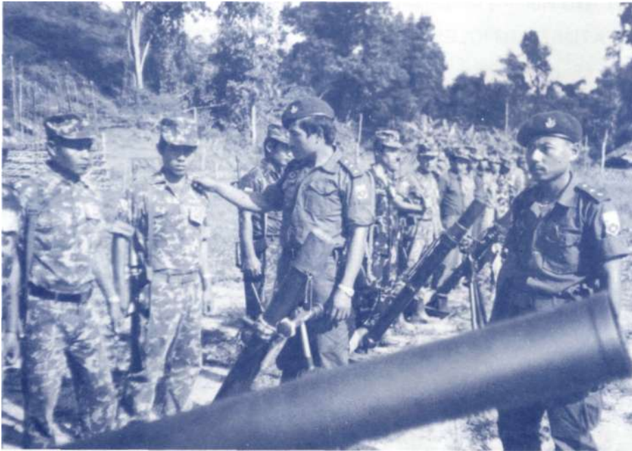
Heavy Arms training at GHQ.