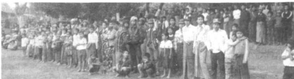
Masses attending 38th Karen Revolution Day at Manerplaw.

The noble and righteous Karen revolution is bound to be victorious.