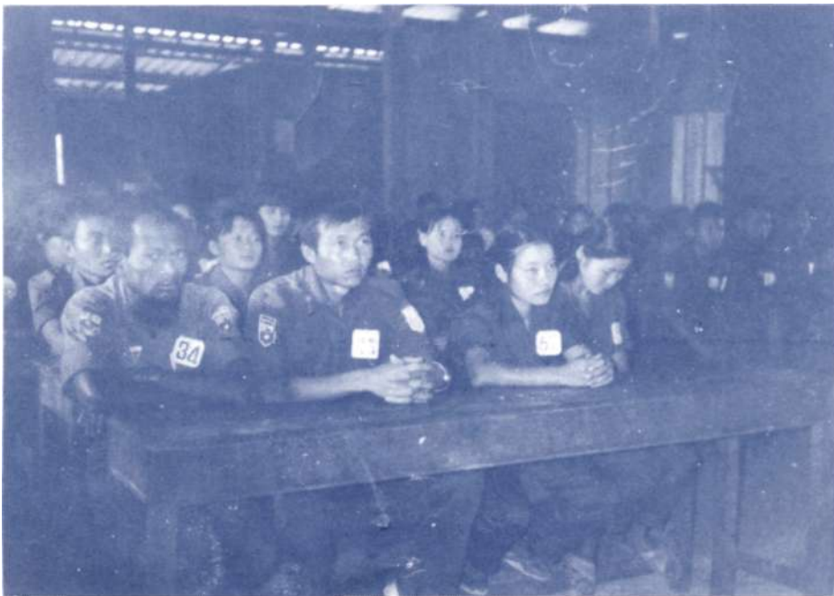
1986/87 Basic Medical Training Class.