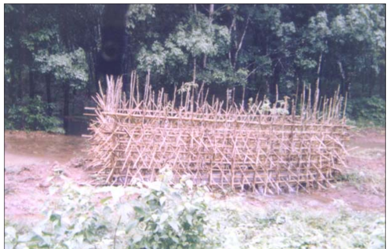
A Gas Pipeline-fence in southern Thanbyuzayat Township, Mon State

The soldiers also ordered to the villagers to bring all these building materials to their set places in their bases just