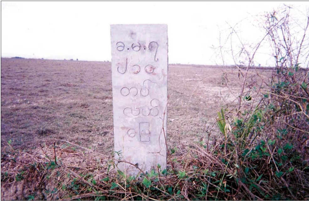
..... The confiscated paddy lands by the local Burmese army's LIB No. 210 in southern part of Ye Township, Mon State. .....

decided to pay them in number of acre and they will get only Kyat 4000.00 (4 US Dollar) of lands.