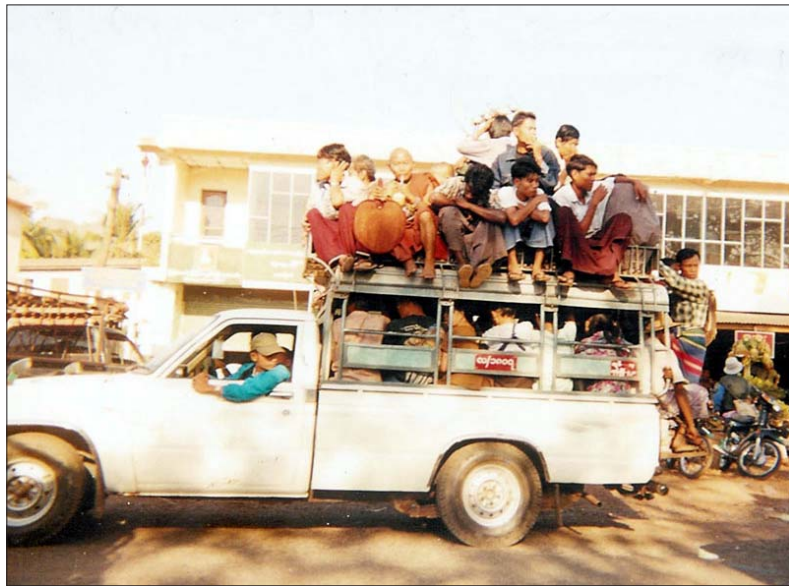
Passengers who came from Myawaddy to Paan Township, Karen State.

“The officials which included the polices, army, MI officers and authorities, in Kya-inn-seiky town, Karen State’s boat station, they always threatened the passengers, who came from border area with Thailand to pay them