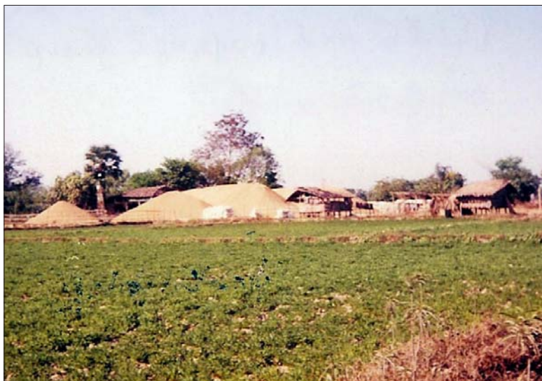
"Tarana (No. 3/03)", a paddy-buying center of local authorities in Kyaikmayaw Township, Mon State

The local authorities organized the local traders who involved in buying paddy from farmers with normal price and forced them to form the 'Chambers of Commerce' and then instructed to buy paddy from farmers at set low-price. The Chambers of Commerce also have to use the old