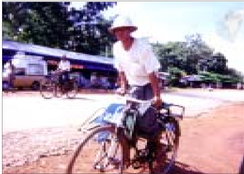
A hardship life forced the people from Burma to leave into Thailand

from UNHCR ( United Nations High Commission for Refugees ) in Thailand 4 . Most of those or thousands of Burma's (ethnic) war-refugees have disappeared in thick population of migrant workers.