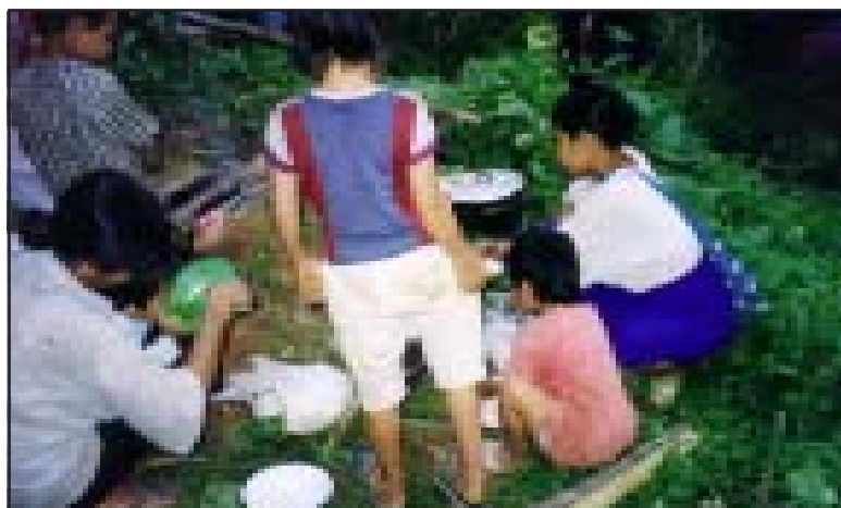
A family of displaced persons in a jungle