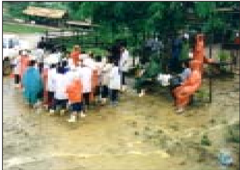
A group of female migrant workers are deported to Thailand-Burma border

HURFOM P. O. Box 11 Ratchburana P. O. Bangkok 10140, THAILAND E-mail: hurfomcontact@yahoo.com Webpages: http://www.rehmonnya.org/monforum_main.php