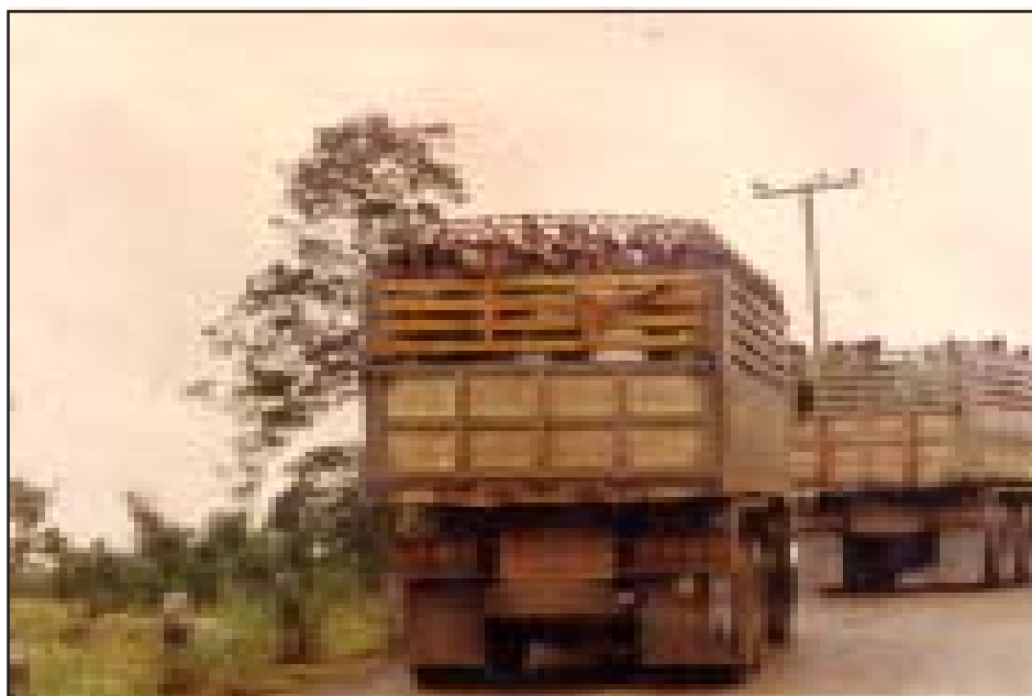
Hundreds of unregistered Burmese migrant workers are deported back to Burma border

Those unregistered workers still work in unsafe situation in many workplaces, especially in agriculture, fishing, construction, livestock and many other industries in many Thailand's provinces. Although Thai government has applied pressure to the employers, many of them failed to register their alien employees, because they would not like to spend registration and did not trust the workers whether they