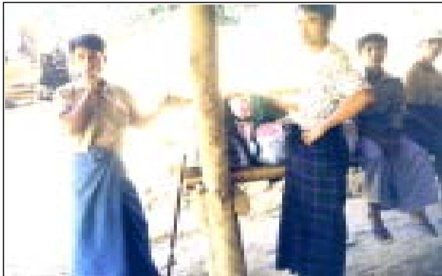
A man, who escaped from human rights violations planned to enter into Thailand as a migrant worker

The collection of these fees related to the military operations are also different and varied. In the areas, where the Burmese Army launched intensive military offensives, they took a lot of money from every household in villages regardless of female-headed and elderly families.