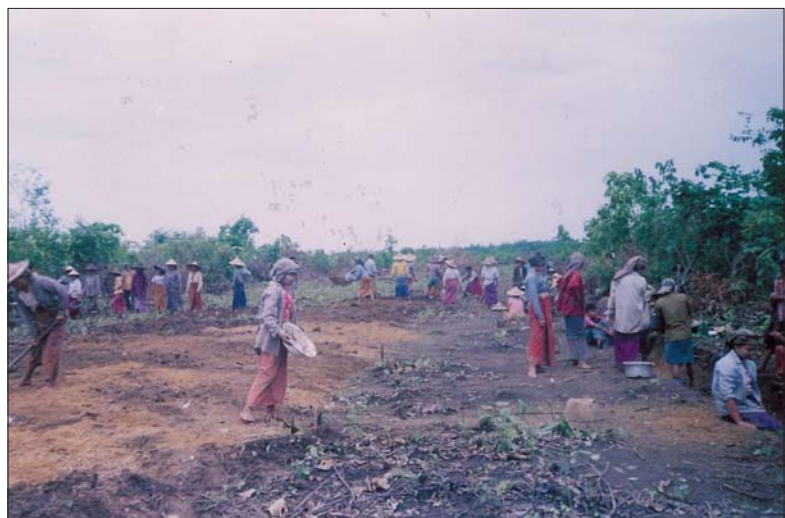
A group of forced labour used by the local Burmese Army

The village has about 300 households and it has about 1900 population. After the formation of militia force, the villagers have to take responsibility to provide foods for those militiamen and payment for their salaries and wages. Those militiamen have to take responsibility