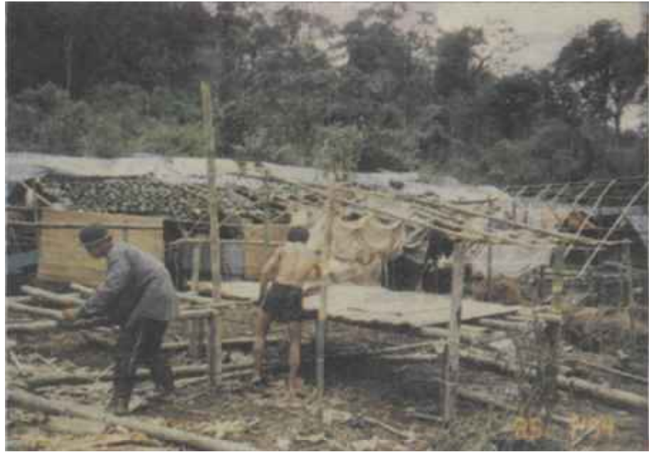
The Mon refugees constructed shelters with hopes to take refuge in Thai territory in 1994

In 2002, when the returned Mon refugees in Halockhani resettlement site, which is right on Thailand-Burma, face a serious security concern because of fighting happened in their camp-site, they were not permitted to go into Thailand. After NMSP cease-fire, no Mon refugee camp was allowed to set up in Thailand and therefore, thousands of Mon refugees like who fled in early 2004 offensives migrated into Thailand and most of them became as migrant workers 21 .