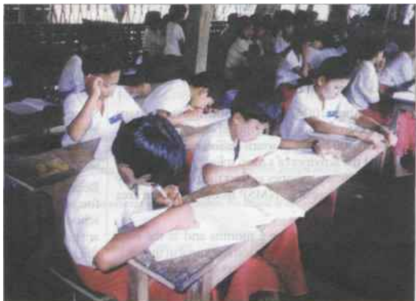
A Mon National School