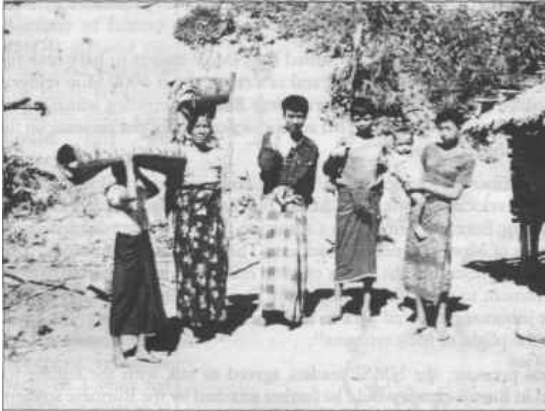
One family of new arrivals at Payaw Camp who escaped from the conscription of slave-labours in Ye-Tavoy railway construction in 1994.

took refuge in 7 camps in 1990. But later on, Thai army and local authorities tried to combine all small camps into a big camp and forcibly relocated the refugees.