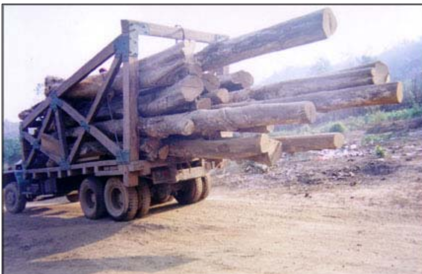
A truck with a lot of tons of wood on the way to Three Pagoda Pass Town

In May, the village authorities and militia declared that all farmers must not cross into pipeline route area from 6:00 p.m. in the evening until 6:00 a.m. in the morning. Maj. Naing Win of IB No. 31 instructed the militia force in every village that they have rights to shoot anyone who crossed or walked along the gas pipeline.