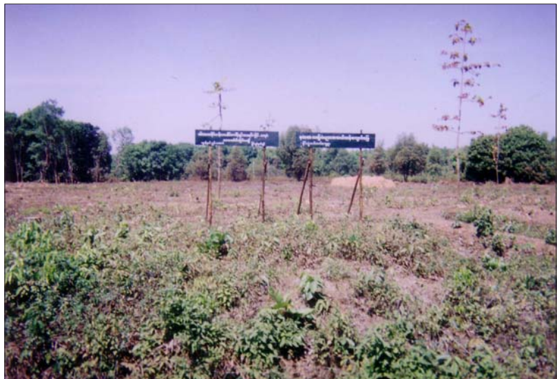
A new confiscated land by SPDC's Township government in Naing Hlone village of Mudon Township, Mon State

According to source, the military government is planning to build a new dam in the area, where it has a river called Win-yaw and a valley area.