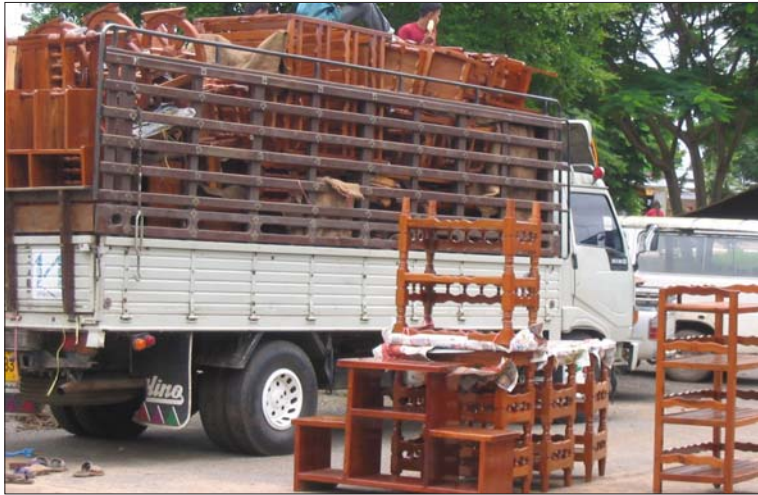
The furniture and lacquer wares are the main products of Three Pagoda Pass

The kinds of wood used as raw material include not only hard wood such as iron wood and Pa-dauk ( Pterocarpus macrocarpus ), but soft wood such as htawk Kyant ( treminalia tomentosa ), ( michelia champaca ), Auk-chin-zar ( diaspyros ehretioides ), and ( melanorrhoea ) that can be used for marking handicraft works and lacquer wares.