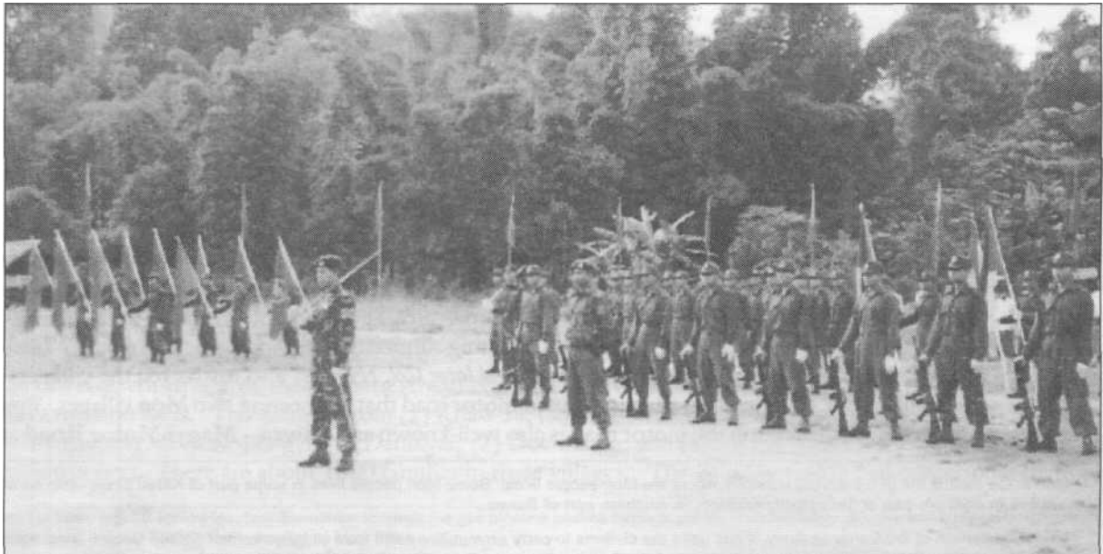
Troops of the MNLA in Ye Township, southern part of Mon State.

The establishment of federal union among the ethnic nationalities came into a failure, after the Burmese Army seized the political power in 1962.