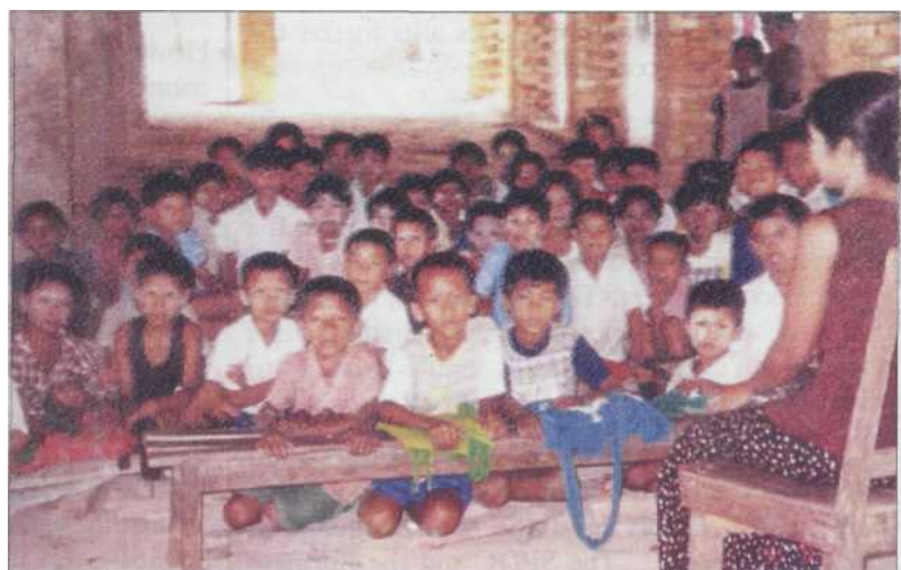
The SPDC authorities believed that teaching of Mon language would create more nationalist thinking and they tried to definitely close down these schools.

Accordingly to a local Mon teachers, the Burmese Army commander, Col. Nyi Nyi of No. 3 Tactical Command ( under the command of South-East Command bases in Moulmein, the capital of Mon State ) ordered to take out MHS's Signboards from Khaw-za, Yin-ye and Mi-htaw-hla-kalay, Kyone-kanya and Pauk-htaw village primary school and replaced them with the government's schools signboards.