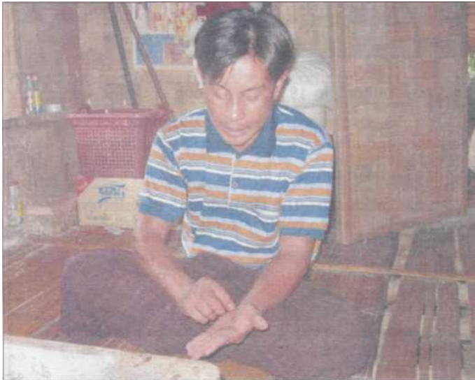
A villager from Southern Ye Township explains his experiences on human rights- violations committed by Burmese army

extending their troop deployment. Some lands are confiscated for the Burmese army businesses and self-reliance program, while some are used in their development projects.