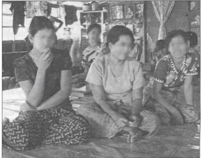
Many women fled from Southern part of Ye Township to escape from sexual violation committed by Burmese Army soldiers

Another rape case was occurred in Kwethonyima village of Yebyu Township which is the border town of Ye Township. On August 10, 2004, when a young Mon woman was on a travel near her village, Kwethonyima of Yebyu township, she was repeatedly raped by a Sergeant from the Burmese Army's Light Infantry Battalion No. 406, a according to the source close to woman. Note: HURFOM did not get exact name of the commander.)