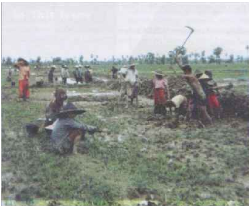
Forced labour in building a water canal

In Khaw-za, the government is building it's offices; immigration, Township Peace and Development Council office and others military government office. Many resident houses moved by forced for the military government offices.