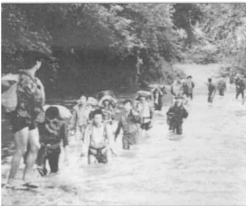
Civilians in the porter service for Local Burmese Army in southern part of Ye Township, Mon State

In December 2004, the troops of Burma's military regime, who are taking responsibility for the security of well-known Yadana gas pipeline to Thailand border, have constantly used villagers as unpaid porters during they lunch military offensives against the Mon Splinter group, which is previously a faction of Hongsawatoi Restoration Party (HRP) in Yebyu Township in the northern of Tenasserim Division, southern Burma.