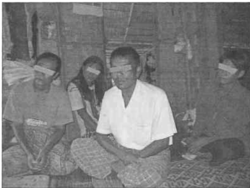
Some villagers who fled from the southern part of Ye Township. (In Halockanee Mon refugee camp)

Since the end of rainy season in October 2004, the troops of Burmese Army intensified its military offensives against the splinter groups and the villagers have been suffered more from the suspicion of rebel-supporter.