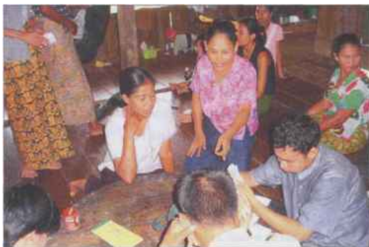
Members of Mon Relief and Development Committee (MRDC) are also helping some basic support for IDPs in Halockanee Mon refugee camp

Recently Southeast Command Commander against visited in that area for checking development in the area.