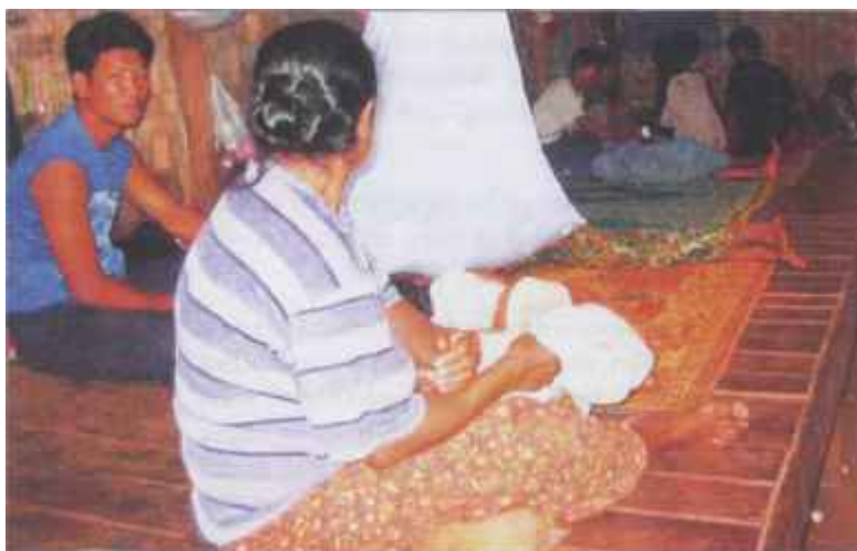
Displaced persons to which the villagers needed to provide building materials such as bamboo during their deployment

An escaped villager also added that besides they were forced to work for the military's projects, at the same time, they are also asked to pay taxes to the army on a rotation basis. If they asked permission to go