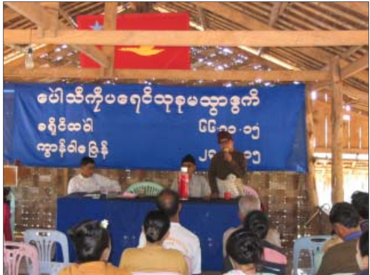
Mon traditional dance groups' meeting

Human Rights Foundation of Monland (HURFOM), which has monitored the situation in Mon areas and have connections with the CBOs in Mon State, want to call to independent INGOs and local NGOs to work more in Mon areas for the humanitarian and development programs for the Mon communities by coordinating with Mon CBOs.