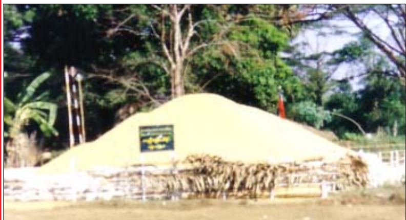
A paddy-buying center by the regime in the past

Battalion No.61 officer, Captain. Moe Aung Khaing joined with village-tract headman and planned to take rice 2500 baskets from the farmers in the area and started collecting the rice since May 20. The army only set the price 110, 000 Kyat for 100 basket of paddy while the paddy price is 200,000 Kyat for 100 basket in market.