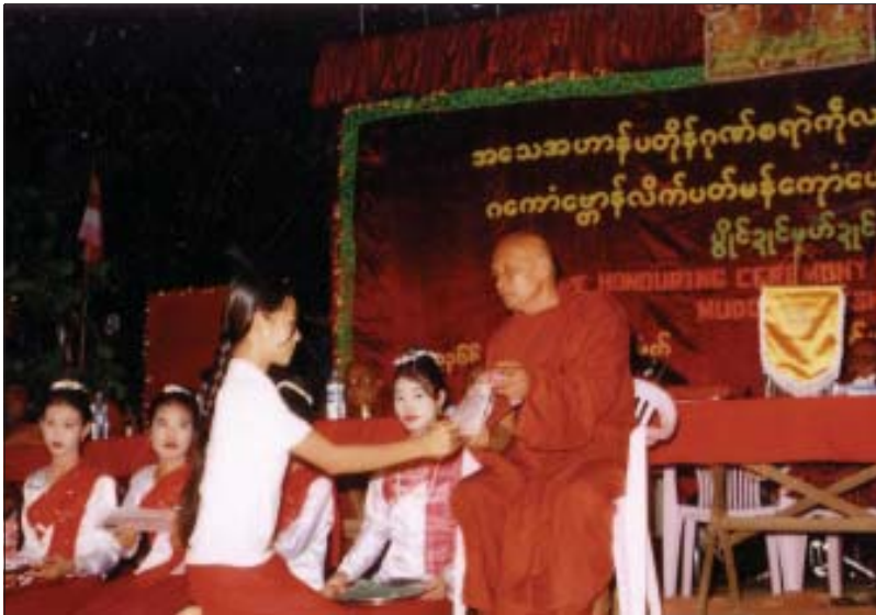
A senior Buddhist monks give prizes to outstanding students after training

After the meeting, the groups also formed a coordinating group in order to conduct the activities effectively and monitor each group's performance and their improvement.