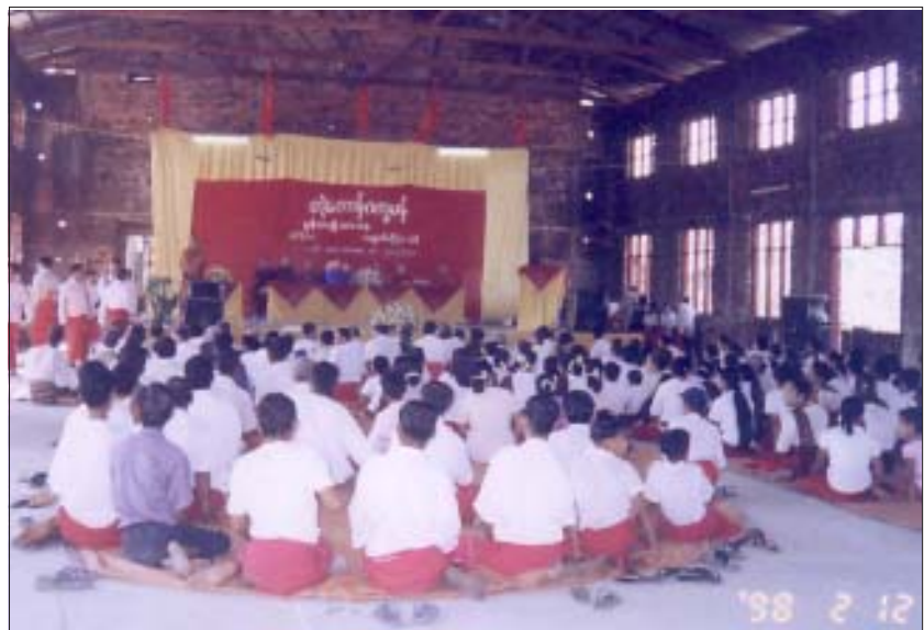
A Mon National Day ceremony

Thousands of Mon people joined and participated in the MND with their own desires and willingness. In some areas, the Mon villagers or town residents marched to MND ground village by village voluntarily, in silence and in disciplines.