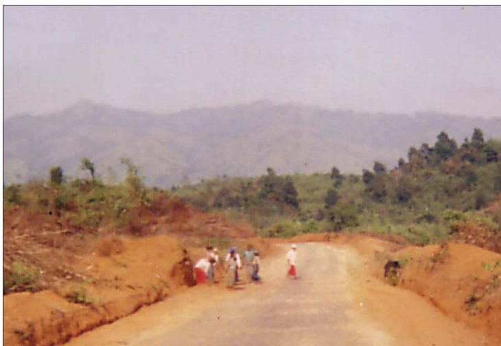
A group of villagers were forced to work in Kanbauk-Myaingkalay gas pipeline in Yebyu Township, Tenasserim Division

The villagers displaced because of two main reasons: first reason is to flee from daily human rights violations and second, some also fled because of the fighting in the area and are afraid to stay on in their villages.