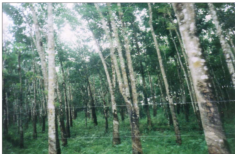
A rubber plantation which were confiscated by MOMC No. 19 of Mon State in Ye Township, Mon State

However, LIB No. 586 instructed the land owners to pay the battalion with 30, 000 Kyat per month, restrict to not cut trees and collect other