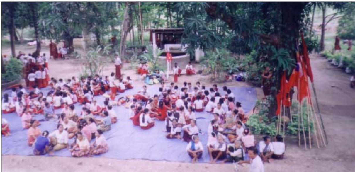
Mon Literacy students in Mon State

Nai Sein Aye led MLCC has been working for community development especially opening the Summer Mon Literacy Training School and involved in the religious activities. There are many similar MLCC organizations in different Mon areas and are not disturbed like this MLCC in Thanbyuzayat Township.