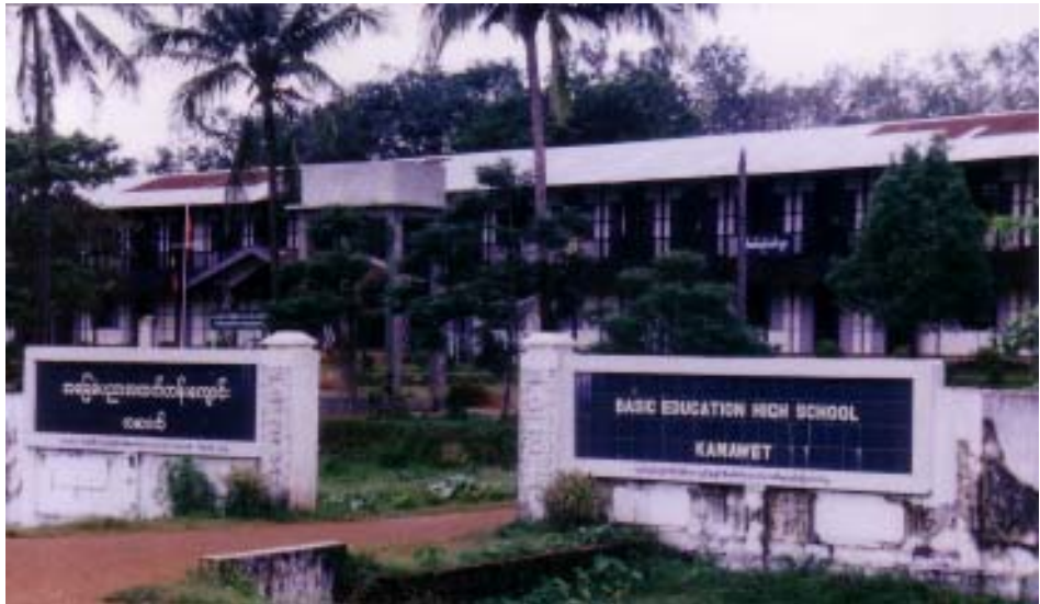
Basic Education High School in Kamawet village of Mudon township, Mon State

donate building materials needed to repair the school, such as cement, logs, and galvanized iron sheets. If they could not donate, the children will lose the chance to attend the schools.”