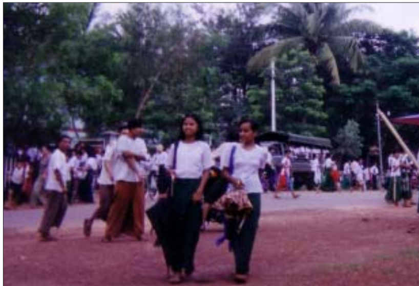
Students from Government's B.E.H.S in Moulmein Capital City, Mon State

against the Mon teachers and Mon national schools. NMSP also sent the letters up to the Commander of South-East Command, to respect the operation of Mon national schools. The Commander replied that the disturbance is just the acts of the commander concerned which was not acknowledged by the South-East Command.