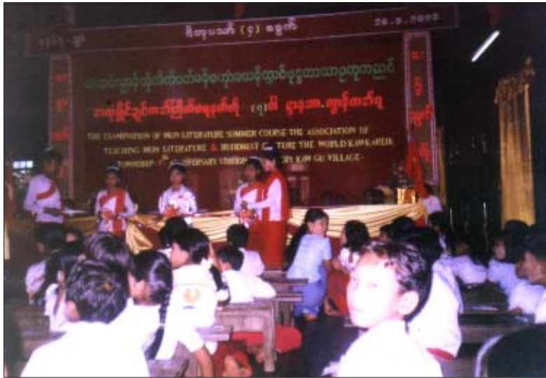
An examination of summer Mon Literacy school in Kaw-Kareik Township

No. 4 th Military Training School is under the command of South-East Command in Moulmein, the capital of Mon State and Col.Khin Maung Zee is also the head of the School and also newly formed "Sa-Ya-Pha", the military intelligent apparatus in the area. The new military intelligent apparatus was founded after the SPDC leaders kicked out the former Intelligent Chief, Lt. Gen. Khin Nyunt, who is also the Prime Minister.