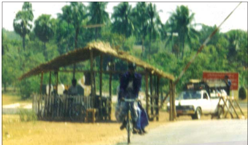
A check point of SPDC's Security team on Moulmein - Kyaik-ma-yaw motor road, Mon State.

The security force by the authorities has tightened up in Salween bridge. They set up a combined security team that comprised of soldiers (from Burmese Army), police officers, immigration officers, militiamen, administrative authorities, USDA (Union of Solidarity and Development Association) members, firemen from Mon State's fire brigade and members from Myanmar Women Affair Committee