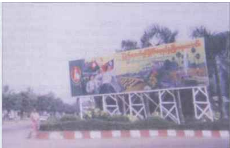
The campaign signboard to persuade the civilians to be members of the Union Solidarity and Development Association, in the capital of Mon State, Moulmein.

By the instruction of USDA's Executive Committee meeting, which is patronized by Senior Gen. Than Shwe, the Township USDA has to increase its public relations activities in order to increase its members. The meeting set to its members they need to organize the people in villages and town ward communities to join into its organization, to have the general people interests in the organizations' works, to show how the USDA has effectively involved in development activities and to enter into deep grass-root communities and show USDA's capacities.