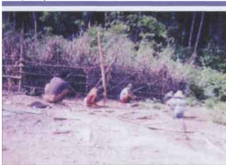
A group of villagers were forced to fence in Kanbauk-Myaingkalay gas pipeline in Ye Township, Mon State

labour, I believe that - as far as I know - there is no other organization to free us except the ILO. In our country, our people greatly suffer the pains of forced labour - some people have to give away their lives. In order to escape from this kind of world, I contacted all organizations within my reach with intention of reporting to the ILO. I knew that if I did this kind of job, I would be tired, poor, starved, imprisoned and even killed. Would I do it? I decided to do it and proceeded"