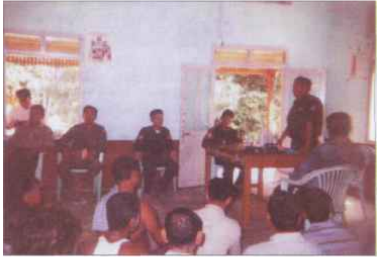
A security and administration meeting between Commander from Local battalion and village headmen in a Mon village

Therefore, it is formed with its main supporters or cadres from USDA, government servants and police officers. The formation of PSO paramilitary force is likely the formation and structure of Burmese Army. USDA leaders are also key persons in this paramilitary force in order to use USDA effectively to side along with Burmese Army.