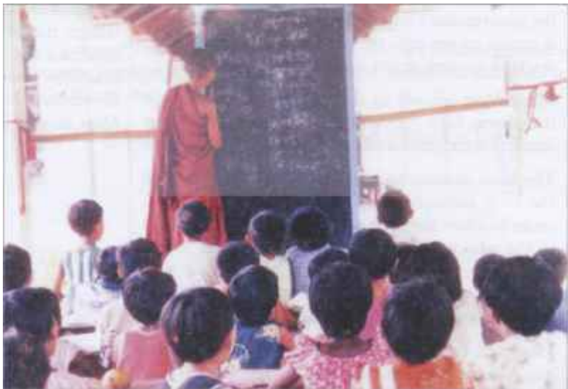
A Mon Literacy Training in one of the monasteries in Ye Township, Mon State

The village school was formerly Mon school and it was established by the Mon community and New Mon State Party's Education Department provided 'teachers' to these Mon village schools since over 30 years ago.