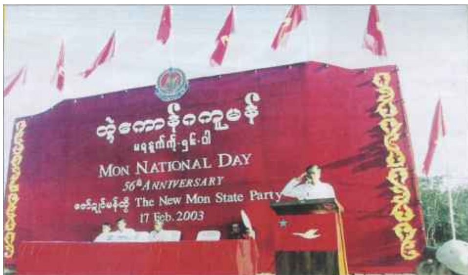
A Mon National Day Cerebration

Almost every year, the military regime orders villages not to put up the signboard for the Mon National Dav.