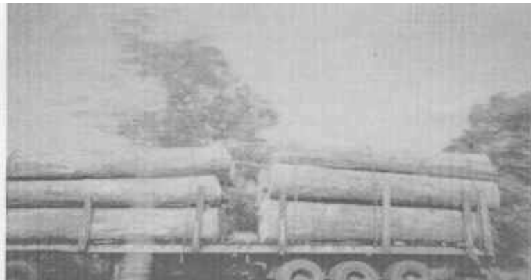
Logging in Thailand-Burma border in Three Pagoda Pass

UNOCAL and TOTAL, the biggest corporate investors in Burma, are today the target of consumer boycotts