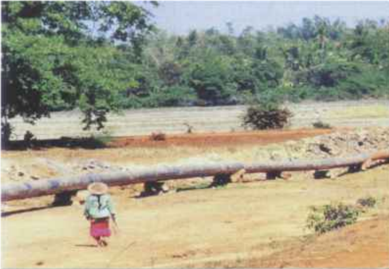
Kanbauk-Myaingkalay gas pipeline in Mon State

to the Burmese Army or SPDC since 1993 and it gets a special business opportunity to do any type of business and they are allowed by the regime.