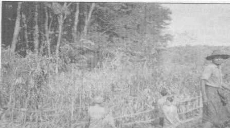
Forced labour in fencing pipeline

"The Burmese Army ordered one unarmed villager per post to protect against any attack by the