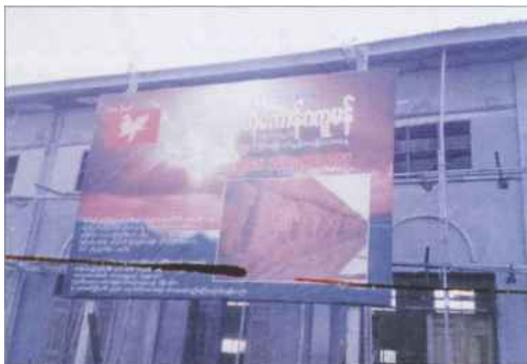
Mon National Day's Signboard put by Cerebrating Committees

"But we refused to bring down the signboard. The local authorities did not pull it down either but ordered us not to put up more signboards in other villages. We cannot put up any more signboards