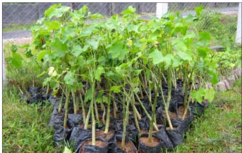
Government's Physic nut (Castor-oil) plants in front of Mudon Township's authorities office, Mon State

According to an anonymous source from Ba-Yan village, those households who could not go to grow the castor-oil plants had to hire others to fulfill their responsibility and buy 70 plants at the rate of