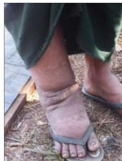
Elephantitis; a common occurrence inside IDP areas

Before MSF left there was facilities to treat Malaria and TB, there were doctors who could treat patients and there were funds for medicine and for the transportation of patients with serious conditions to Thailand. Now the clinics have the capacity to treat malaria, and other basic problems, given of course that they can buy medicines. Transportation has had to be paid for by the patients as it is so