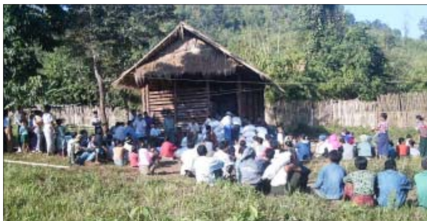
New IDP arrivals in Ta-Dein village

Every year people arrive in the NMSP ceasefire areas fleeing conflict and human rights violations, it is estimated that 15 000 people have arrived in the past year. Conflict between the SPDC and a Mon splinter group in Southern Ye Township has caused internal displacement. The SPDC has re instigated its counter-insurgency program of forced relocation and has placed movement restrictions on villages which prevent them from tending their gardens.