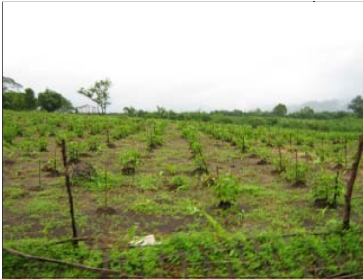
Physic nut (castor-oil) plantations in Ye township, Mon State

The reporter said that residents from southern part of Mudon Township such as Kyone-Phite, Kan-Ka-Lay, Wet-tae, Nyong-Gone, Naing-Hlone, Set-twae, Taw-Guu, Thagon-Taing and Kamar-Wet villages were also required to buy branches of castor-oil plants at the rate of 350 kyat per branches and forced to grow in front of their house and along the road.