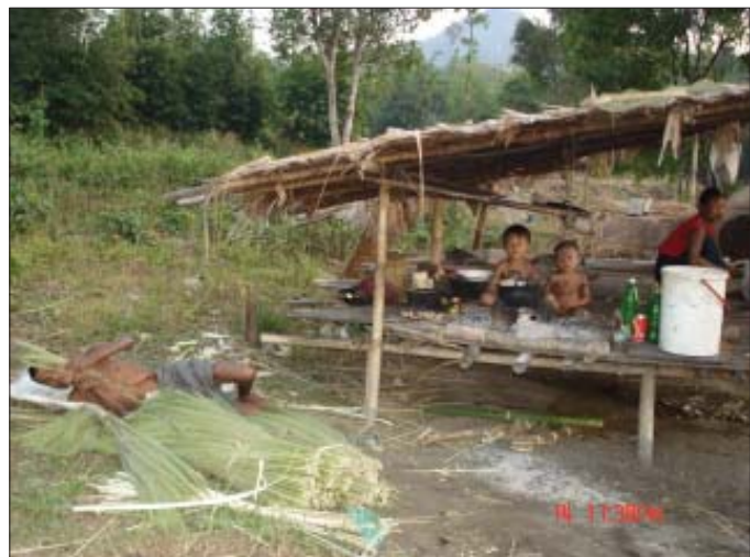
Livelihood of unable person with two children in Cheik-Doik IDP site

People live in the valleys where the weather is always cool. The areas are small and the people live in small bamboo houses without enough fencing to keep out the cold. The IDP camps are crowded and living conditions are not very good. There is not enough food for the children and there is a lot of child malnutrition.