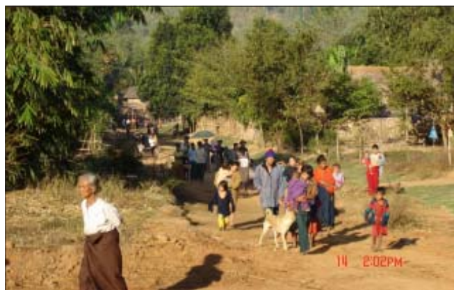
IDPs are going to the NMSP's clinic in Cheik-Doik village

Previously MSF clinics have offered free treatment. However this was not without conditions, if a person got malaria they might go to the clinic for free treatment. However because there are so many cases of