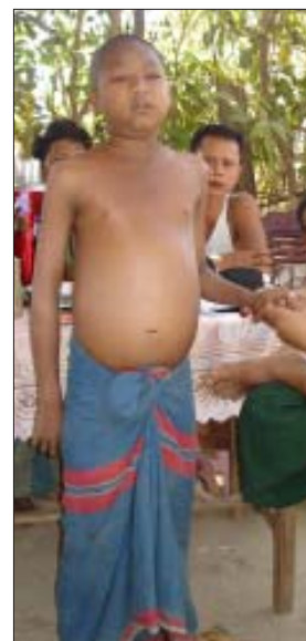
A malnutrition boy in Ta-Dein IDPs village

level with countries at the bottom of the World Health Organisation (WHO) development index like Sierra Leone, Angola and Niger. This report showed these areas to be worse than official statistics for Burma. National figures show from 0-1 years old out of 1 000 live births, 76 deaths; for under 5 these are at 106 out of 1 000. However BPHWT research showed that IDP suffer for 0-1 year olds, 91 deaths and under five the figure is 221 out of every 1 000.