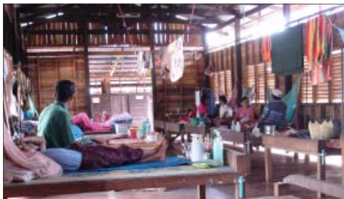
Patients in Palaing-Japan NMSP's hospital

A recent report by the Backpackers Health Worker Team revealed shocking statistics regarding health for IDP populations in Eastern Burma. Basic health indicators like infant and mortality rates showed these areas to be at a similar