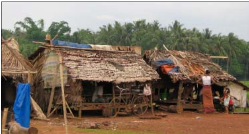
New huts built by the brick makers near Toung-Pyin village, La-mine Sub-Town

The Light Infantry Battalion military LIB No. 587 led by Colonel Hla Myint made a brick production site for the military business near Toung-Pyin village water reserve since June 6, 2006. The battalions brought laborers for the military's brick factory from the middle parts of Burma and allowed them to live and build small huts on the villagers land without asking permission from farm owner. According to a local source there are five Burmese Brick Makers' huts, which are close to the Toung-Pyin village water reserve in La Mine Sub-Township.