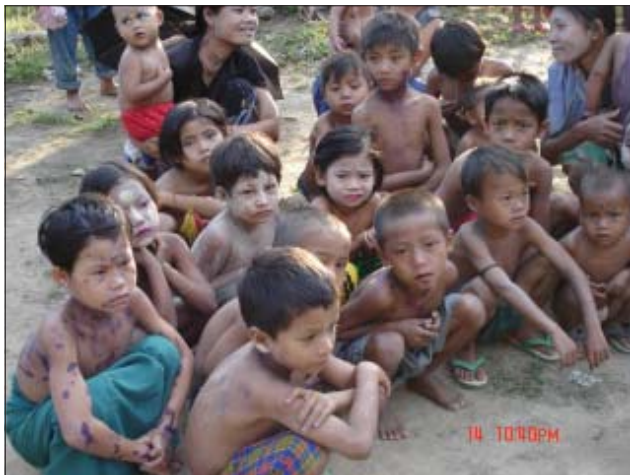
Internal displace children are waiting for health assessment

MSF came to Mon and Karen states in 1990 in response to the humanitarian crisis that was unfolding. They sought to work in areas where the local population had little or no access to medical care. Unfortunately over the years the Burmese government made access to these populations increasingly difficult until MSF decided they could no longer work effectively and choose to leave.