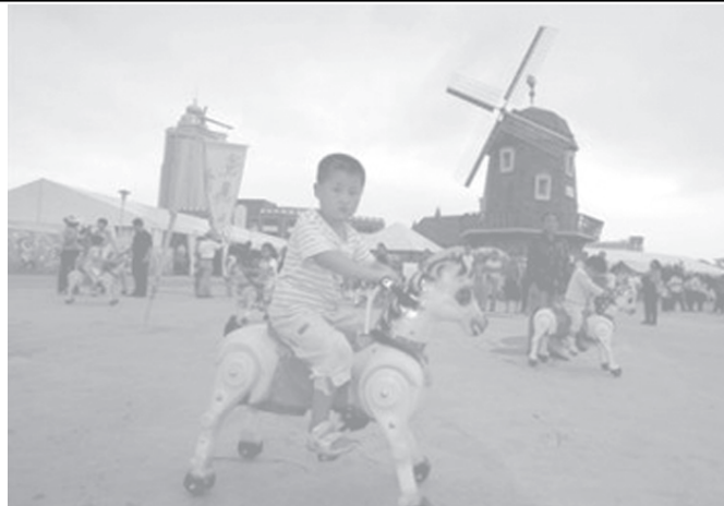
A child rides on a pony at the amusement park set in the city of Qingdao, Shandong Province, China, on 18 Aug, 2005.

"Though it is not unusual for the killer virus to proliferate during every rainy season, the damage is likely to be worse this time."—MNA/Reuters