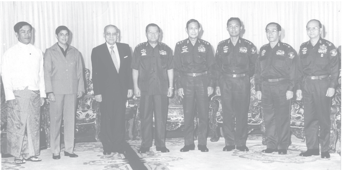
Senior General Than Shwe poses for documentary photo together with Mr Ali Alatas, Special Envoy of the UN Secretary-General at Credentials Hall of Pyithu Hluttaw Building. (News on page 1)