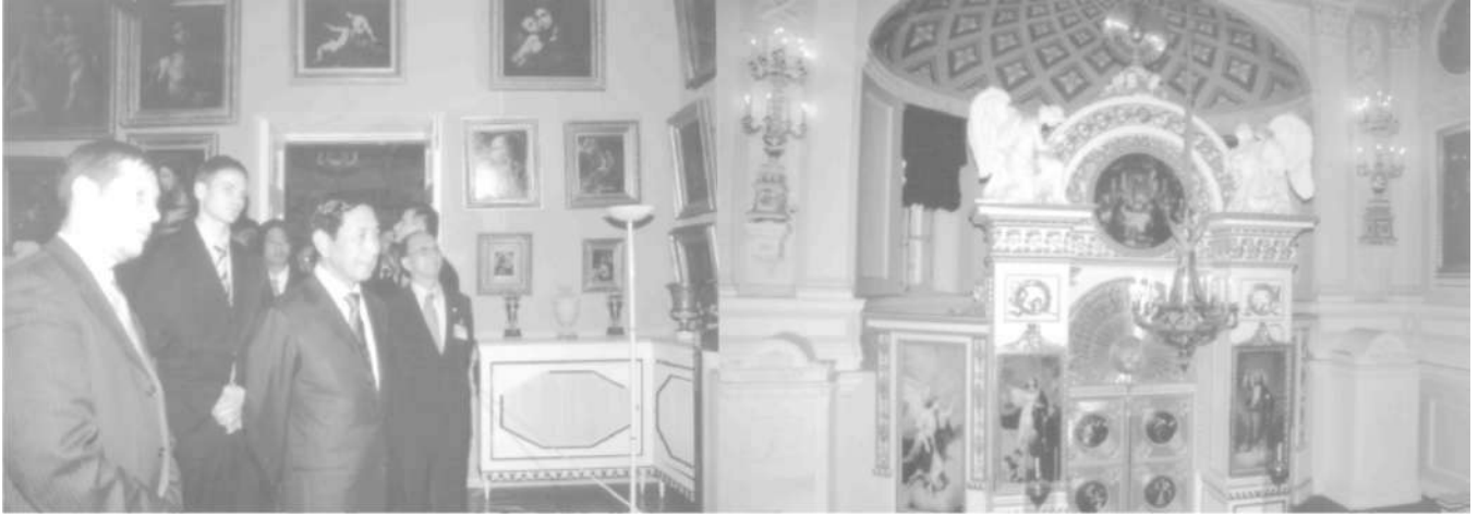
Vice-Senior General Maung Aye and wife Daw Mya Mya San and party visit Palovsky Palace in Palovsky City. (News on page 1)—MNA