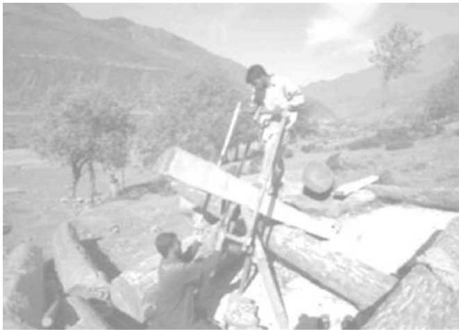
Earthquake survivors cut log meant for rebuilding their house in the village of Uri, 110 kilometres (69 miles) northwest of Srinagar, India, on 7 April, 2006.