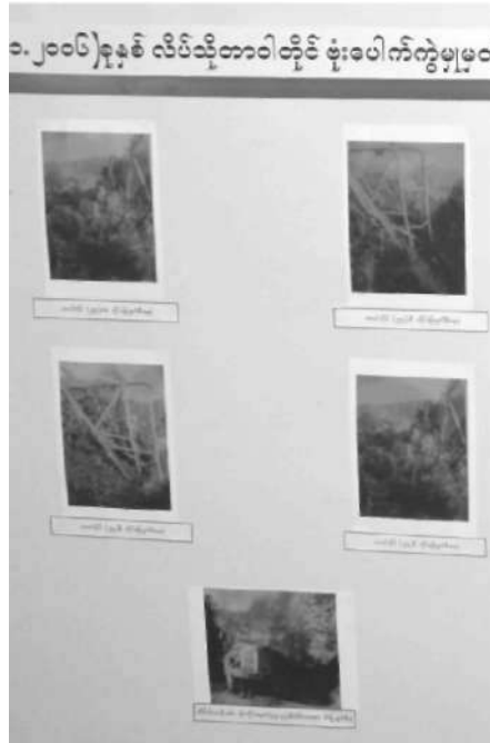
Documentary photos show bomb blast at Leiktho Pylon on 12-1-2006.