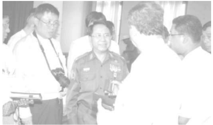
Minister Brig-Gen Kyaw Hsan greets local and foreign journalists.

Nowadays the government does not launch any particular operation and it is responsible for safeguarding lives and property of the people. Unless the security forces cleared the plan to blow up the railways, there would be many casualties. The government took security measures to protect the lives and property of the people. Places where destructive