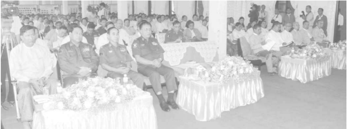
Editorial staff of local magazines and journals and guests at Press Conference No 3/2006 .