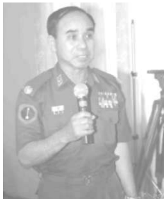
Deputy Minister for Labour Brig-Gen Win Sein. — MNA