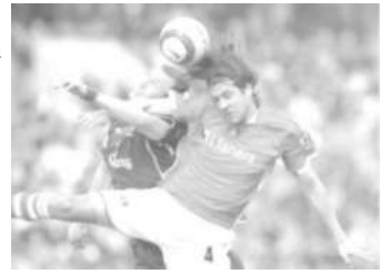
Charlton Athletic defender Gonzalo Sorondo, right, tussles with Everton forward Duncan Ferguson during an English Premier League soccer match at The Valley, London, on 8 April, 2006.

The Welshman opened with a blistering run and left-footed strike after 32 minutes. Pompey striker Lomana LuaLua replied with a fine solo effort of his own four minutes before the break before Bellamy swivelled to blast home his eighth goal in eight league games just after the hour. Todorov netted the equalizer a few minutes after teammate Dejan Stefanovic had missed a similar chance.