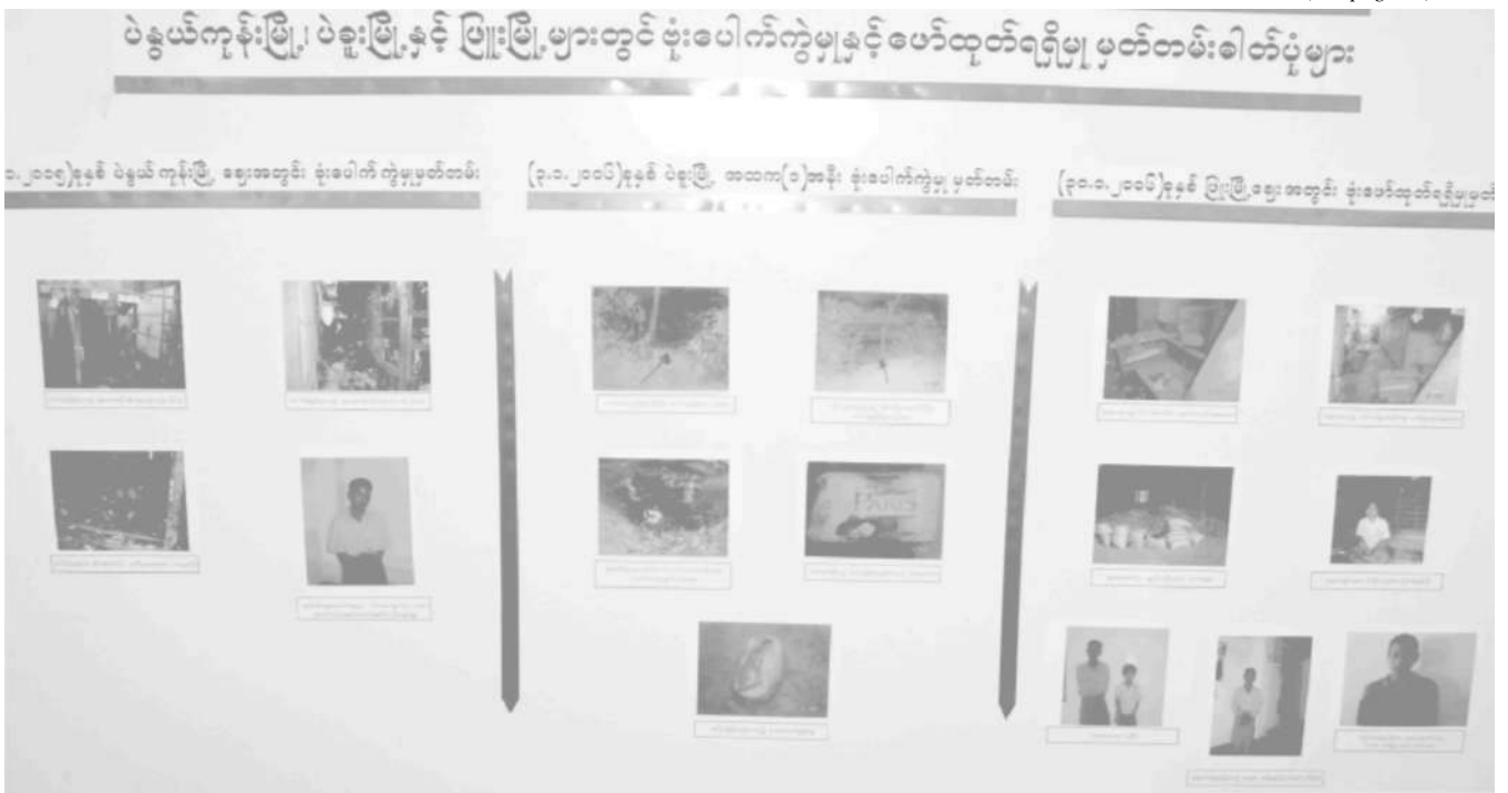
Documentary photos on exposing bomb attacks in Penwagon, Bago and Pyu.