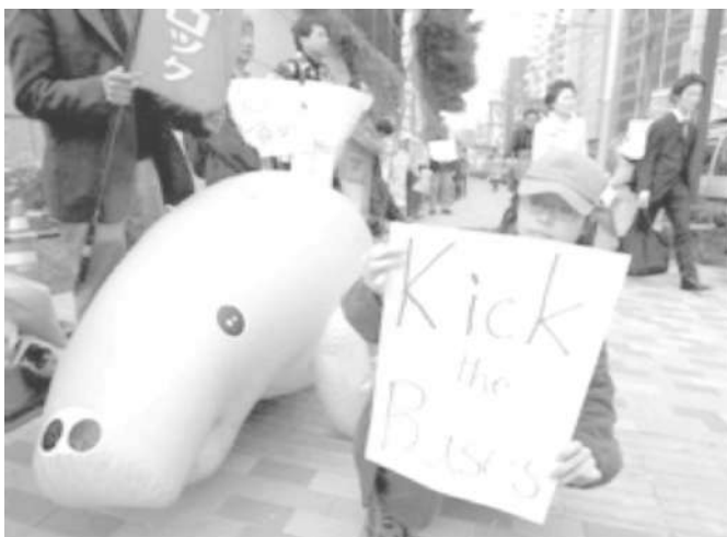
With an inflatable doll of dugong, protesters stage a rally opposing to the US military base relocation in Okinawa, outside Japan's defence agency in Tokyo, on 8 April, 2006.