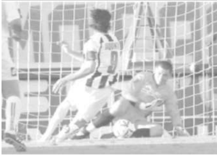
Udinese's Vincenzo Iaquinta, foreground left, scores against Livorno's goalkeeper Marco Amelia during the Italian first division soccer match between Livorno and Udinese at Armando Picchi Stadium in Leghorn, Italy, on 8 April, 2006.