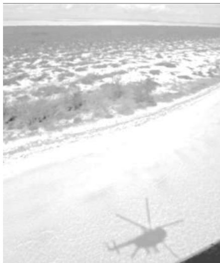
A helicopter of the Cuban Army casts a shadow while flying over a key on the northern coast of Cuba in the eastern Camaguey Province, on 5 April, 2006. Cuban authorities are cracking down on drug traffickers who use the island-dotted coast line to smuggle cocaine and marijuana from Colombia and Jamaica to the United States in the ongoing drug enforcement operation ACHE III.