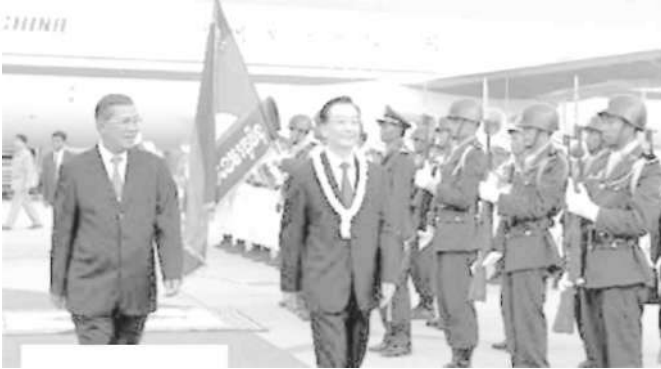
Cambodian Prime Minister Hun Sen (L) holds a red-carpet ceremony to welcome visiting Chinese Premier Wen Jiabao (R, Front) at an airport in Phnom Penh, capital of Cambodia, on 7 April, 2006.