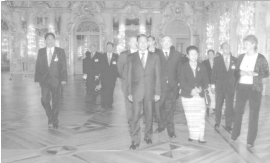
Vice-Senior General Maung Aye and wife Daw Mya Mya San and party visit Ekaterinsky Palace in Pushkinn City, St Petersburg.