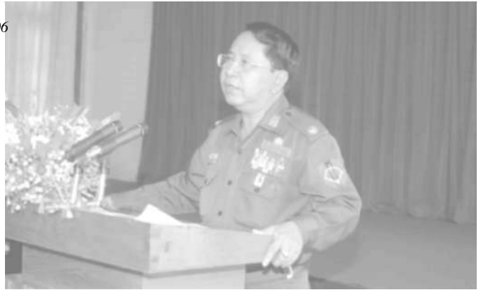
Minister Brig-Gen Kyaw Hsan addresses the press conference No 3/2006.

In previous press conferences, I had explained in detail how internal and external terrorists attempted to launch a three-pronged attack against the Government; how they synchronized external attack and underground attack when the Government exposed in time their above-ground attack; how they were desperate and blasted bombs when the people did not accept their terrorist acts; (See page 8)