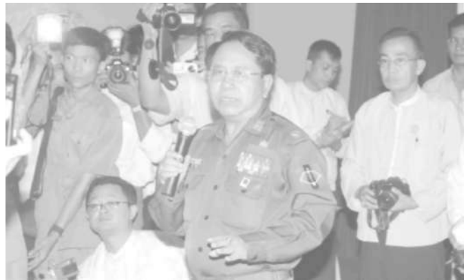
Minister Brig-Gen Kyaw Hsan answers the queries raised by those present at the press conference.

families would be well looked after if they had accomplished the mission; otherwise the saboteurs would be killed and their families would be under control; and if it was impossible to blast bombs at targeted places the saboteurs were to explode bombs at schools and busy places. According to further information received, it was revealed that the terrorist groups led by expatriate Sein Win of NCGUB were conspiring to launch media attack against the Government. It was also learnt that they had planned to blast bombs in Yangon, Mandalay and Pyinmana cities by joining hands with ABSDF and KNU whose members have expertise in exploding mines. Their motive was to frighten the people and cause the Government lose people's confidence.