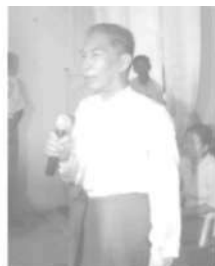
U Aung Thein. MNA