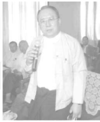
Governor of Central Bank of Myanmar U Kyaw Kyaw Maung. MNA

Local and foreign newsmen, officials of local media raised queries regarding the clarifications by Minister for Information Brig-Gen Kyaw Hsan, other issues and clarifications of five persons who involved in connection with FTUB Pyithit Nyunt Wai and Thein Win of NDD. Questions and replies are as follows.