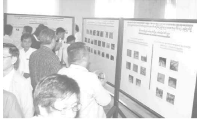
Journalists view documentary photos on display at the press conference.

Information was received in January that a group comprising 9 men and 3 women from KNU