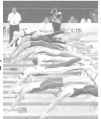
Swimmers compete in the Women's 50 Metres Freestyle semi-final at the FINA World Short Course Swimming Championships in Shanghai, China, on 8 April, 2006.

yet rue the points dropped at Fratton Park because they have now played two games more than Arsenal, who have 53 points and face Manchester United at Old Trafford on Sunday. Having inflicted a fifth consecutive league defeat on Manchester City, Spurs manager Martin Jol played down the pressure on his side in the Champions League race. "If Arsenal win all their games then maybe we could have a problem," he told Sky Sports.—MNA/Reuters