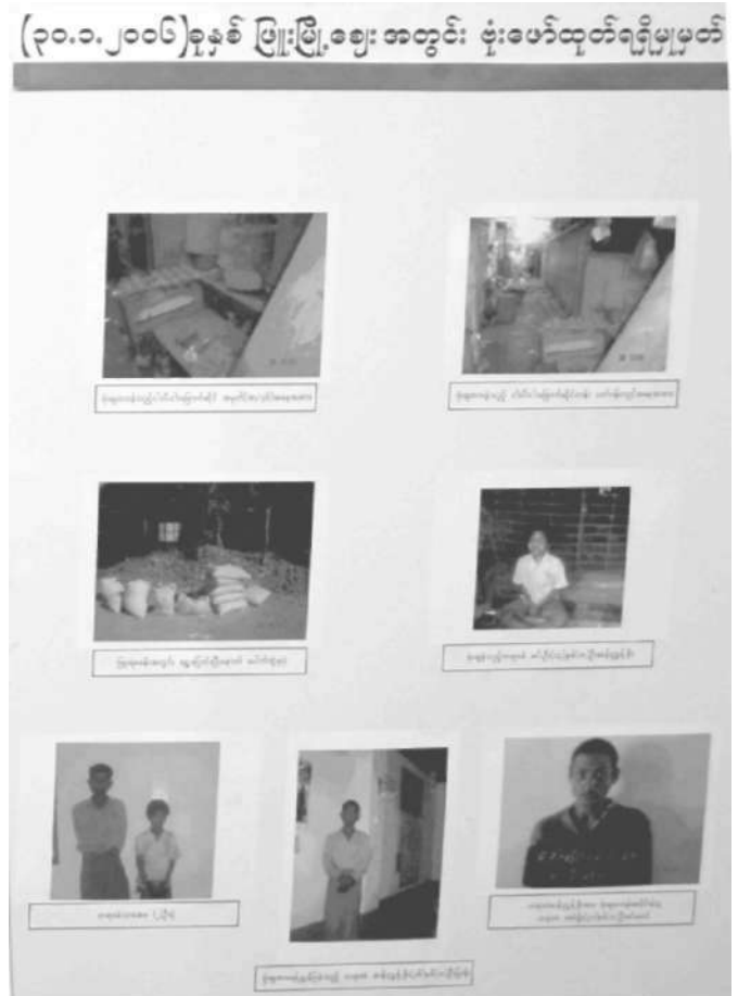
Documentary photos show bomb explosion at the market in Pyu on 30-1-2006.