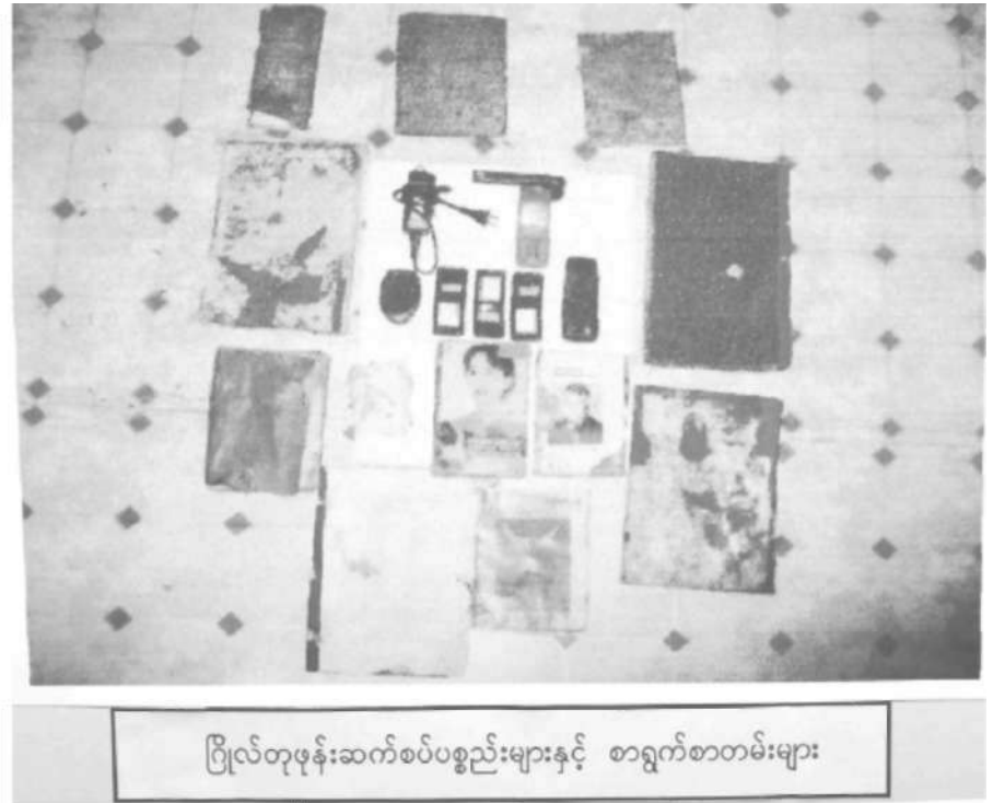
Satellite phone equipment and documents

As they are of the same type, they formed the so-called fronts, alliances and national councils. The group called National Democratic Front (NDF) comprises KNU, KNPP, SDU, SSA-S, CNF and ALP terrorist groups. The NDF office is in the other country. Its chairman is Phado Ba Thin Sein of KNU. A similar group, Democratic Alliance of Burma (DAB), is formed