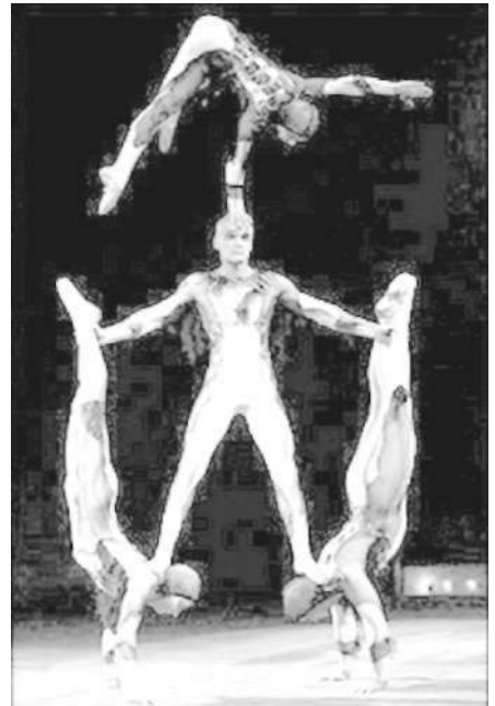
Circus artists of the Atlantis ensemble perform during this season's premiere of Circus Krone, in Munich recently.