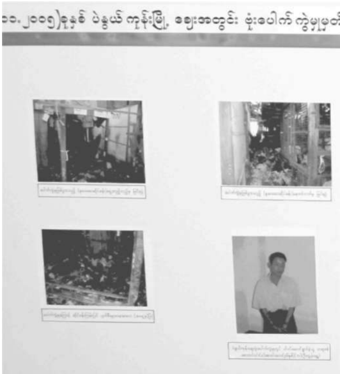
Documentary photos show bomb blasts in the market of Pyu on 11-2-2005.