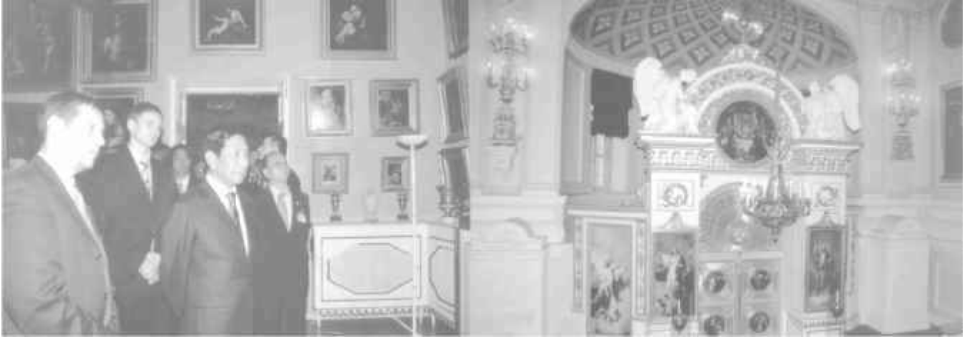
Vice-Senior General Maung Aye and wife Daw Mya Mya San and party visit Palovsky Palace in Palovsky City. (News on page 1)