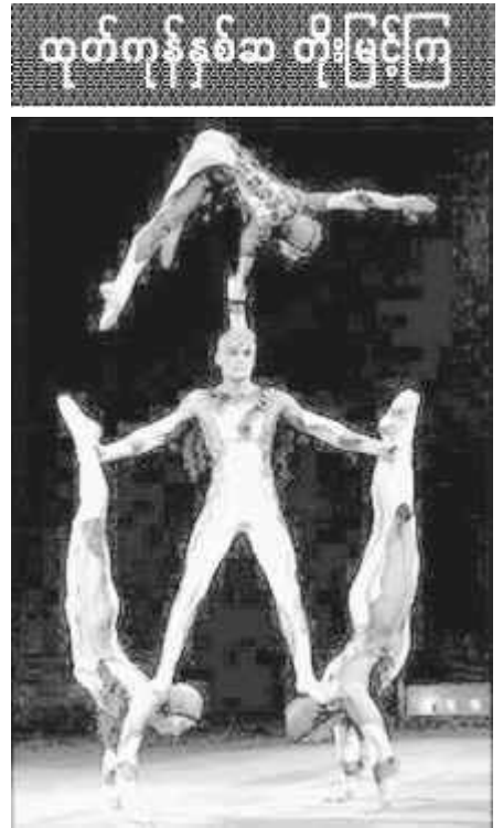
Circus artists of the Atlantis ensemble perform during this season's premiere of Circus Krone, in Munich recently.