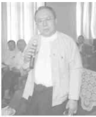
Governor of Central Bank of Myanmar U Kyaw Kyaw Maung.

Local and foreign newsmen, officials of local media raised queries regarding the clarifications by Minister for Information Brig-Gen Kyaw Hsan, other issues and clarifications of five persons who involved in connection with FTUB Pyithit Nyunt Wai and Thein Win of NDD. Questions and replies are as follows.