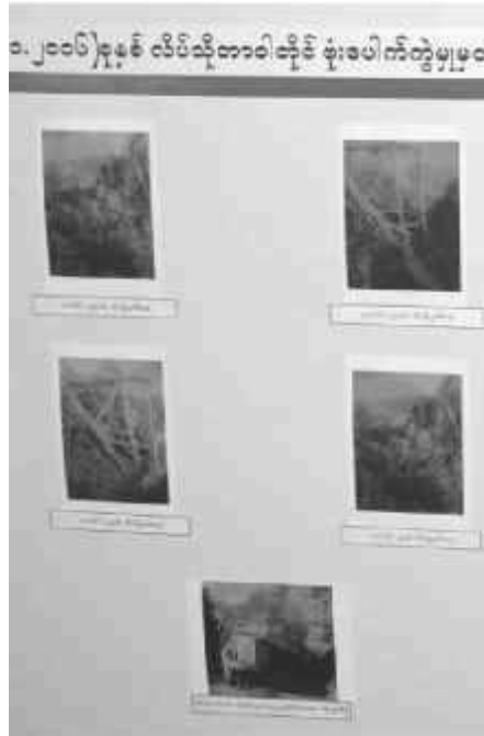
Documentary photos show bomb blast at Leiktho Pylon on 12-1-2006.