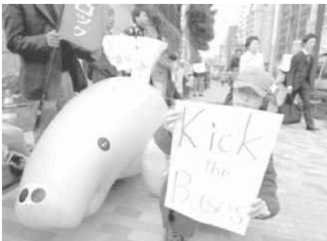
With an inflatable doll of dugong, protesters stage a rally opposing to the US military base relocation in Okinawa, outside Japan's defence agency in Tokyo, on 8 April, 2006.