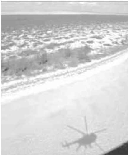
A helicopter of the Cuban Army casts a shadow while flying over a key on the northern coast of Cuba in the eastern Camaguey Province, on 5 April, 2006. Cuban authorities are cracking down on drug traffickers who use the island-dotted coast line to smuggle cocaine and marijuana from Colombia and Jamaica to the United States in the ongoing drug enforcement operation ACHE III.