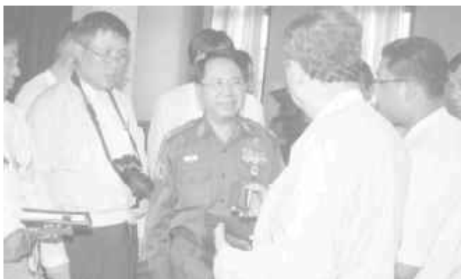
Minister Brig-Gen Kyaw Hsan greets local and foreign journalists.

Nowadays the government does not launch any particular operation and it is responsible for safeguarding lives and property of the people. Unless the security forces cleared the plan to blow up the railways, there would be many casualties. The government took security measures to protect the lives and property of the people. Places where destructive