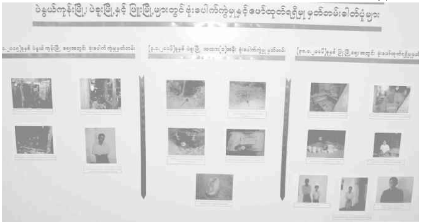
Documentary photos on exposing bomb attacks in Penwagon, Bago and Pyu.