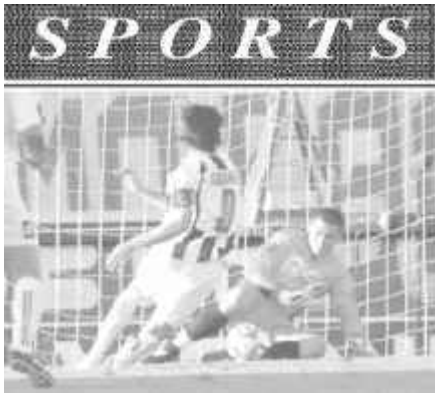
Udinese's Vincenzo Iaquinta, foreground left, scores against Livorno's goalkeeper Marco Amelia during the Italian first division soccer match between Livorno and Udinese at Armando Picchi Stadium in Leghorn, Italy, on 8 April, 2006.