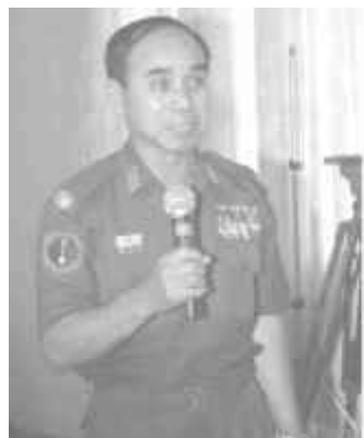
Deputy Minister for Labour Brig-Gen Win Sein.