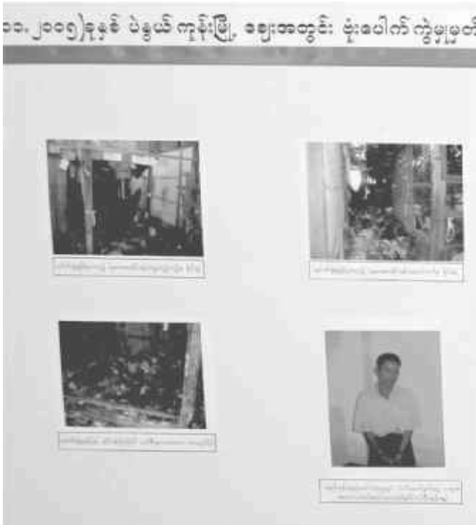
Documentary photos show bomb blasts in the market of Pyu on 11-2-2005.