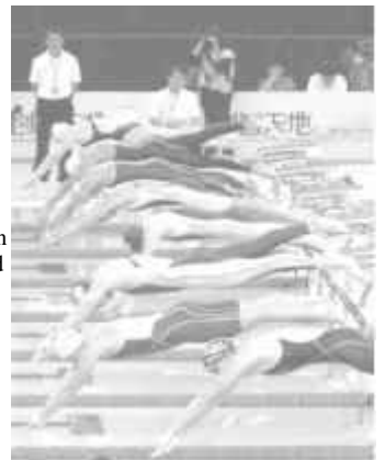
Swimmers compete in the Women's 50 Metres Freestyle semi-final at the FINA World Short Course Swimming Championships in Shanghai, China, on 8 April, 2006.

yet rue the points dropped at Fratton Park because they have now played two games more than Arsenal, who have 53 points and face Manchester United at Old Trafford on Sunday. Having inflicted a fifth consecutive league defeat on Manchester City, Spurs manager Martin Jol played down the pressure on his side in the Champions League race. "If Arsenal win all their games then maybe we could have a problem," he told Sky Sports.—MNA/Reuters