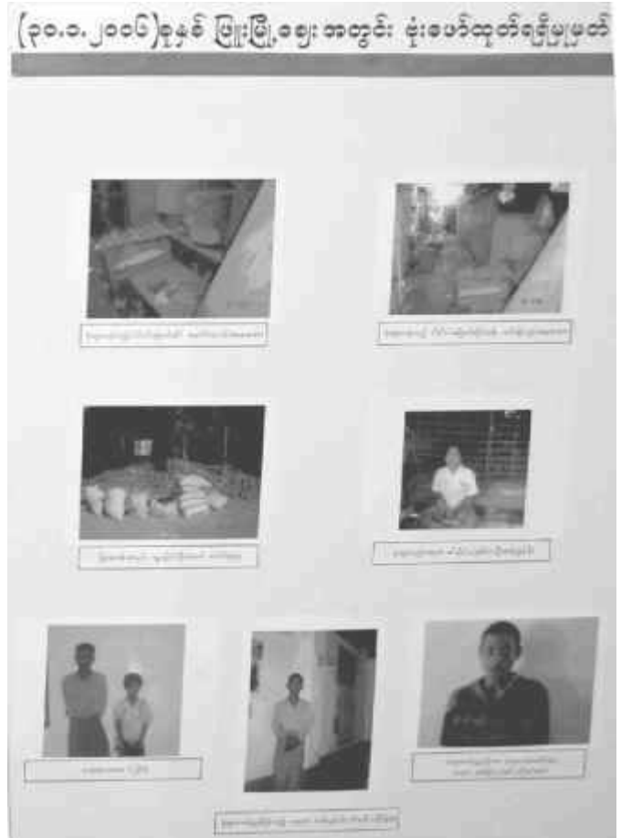
Documentary photos show bomb explosion at the market in Pyu on 30-1-2006.