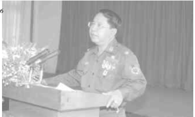
Minister Brig-Gen Kyaw Hsan addresses the press conference No 3/2006.— MNA

In previous press conferences, I had explained in detail how internal and external terrorists attempted to launch a three-pronged attack against the Government; how they synchronized external attack and underground attack when the Government exposed in time their above-ground attack; how they were desperate and blasted bombs when the people did not accept their terrorist acts; (See page 8)