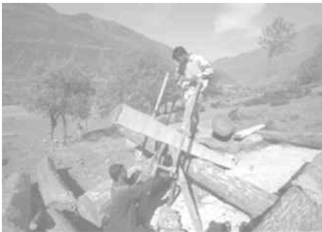
Earthquake survivors cut log meant for rebuilding their house in the village of Uri, 110 kilometres (69 miles) northwest of Srinagar, India, on 7 April, 2006.

Forecast for Mandalay and neighbouring areas for 10-4-2006: Partly cloudy.