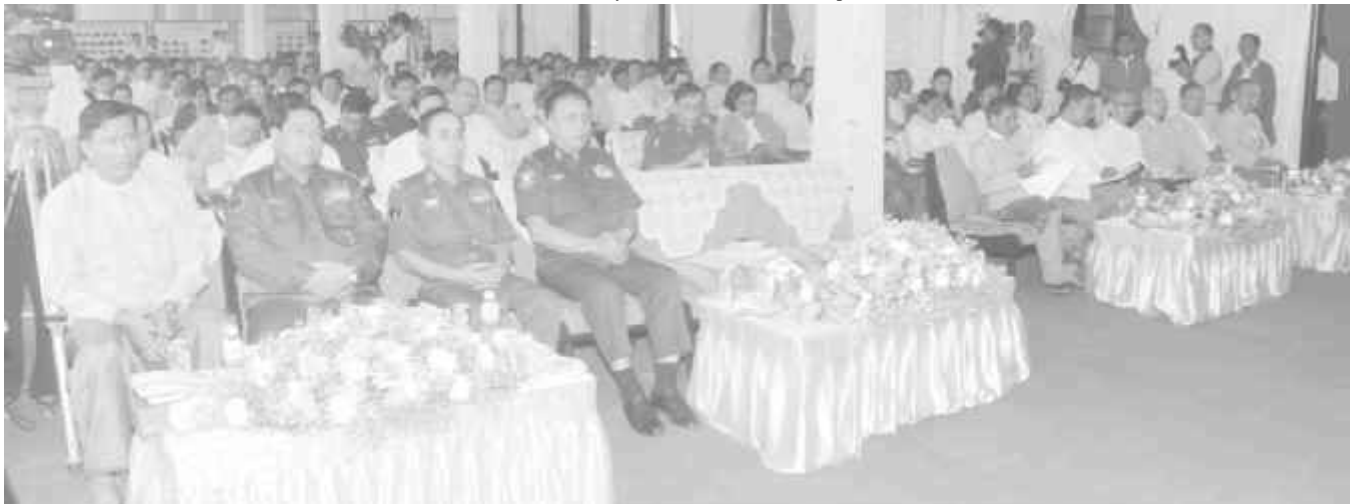
Editorial staff of local magazines and journals and guests at Press Conference No 3/2006 .