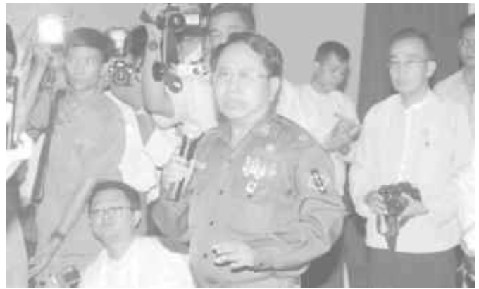
Minister Brig-Gen Kyaw Hsan answers the queries raised by those present at the press conference.

families would be well looked after if they had accomplished the mission; otherwise the saboteurs would be killed and their families would be under control; and if it was impossible to blast bombs at targeted places the saboteurs were to explode bombs at schools and busy places. According to further information received, it was revealed that the terrorist groups led by expatriate Sein Win of NCGUB were conspiring to launch media attack against the Government. It was also learnt that they had planned to blast bombs in Yangon, Mandalay and Pinyinmana cities by joining hands with ABSDF and KNU whose members have expertise in exploding mines. Their motive was to frighten the people and cause the Government lose people's confidence.