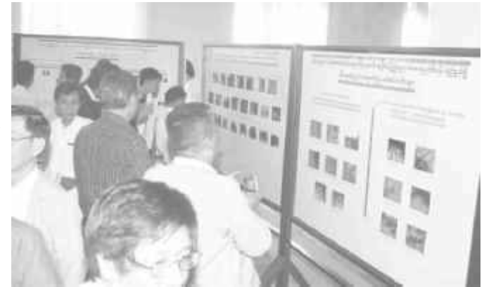
Journalists view documentary photos on display at the press conference.

Information was received in January that a group comprising 9 men and 3 women from KNU