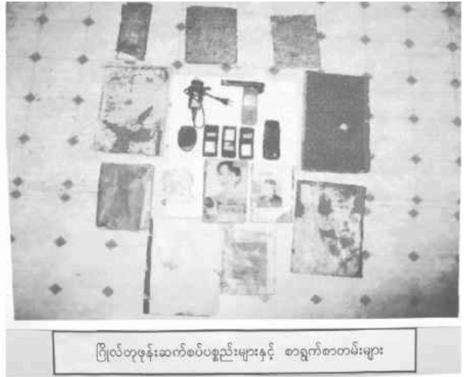
Satellite phone equipment and documents

As they are of the same type, they formed the so-called fronts, alliances and national councils. The group called National Democratic Front (NDF) comprises KNU, KNPP, SDU, SSA-S, CNF and ALP terrorist groups. The NDF office is in the other country. Its chairman is Phado Ba Thin Sein of KNU. A similar group, Democratic Alliance of Burma (DAB), is formed