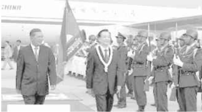
Cambodian Prime Minister Hun Sen (L) holds a red-carpet ceremony to welcome visiting Chinese Premier Wen Jiabao (R, Front) at an airport in Phnom Penh, capital of Cambodia, on 7 April, 2006.