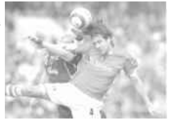
Charlton Athletic defender Gonzalo Sorondo, right, tussles with Everton forward Duncan Ferguson during an English Premier League soccer match at The Valley, London, on 8 April, 2006.

The Welshman opened with a blistering run and left-footed strike after 32 minutes. Pompey striker Lomana LuaLua replied with a fine solo effort of his own four minutes before the break before Bellamy swivelled to blast home his eighth goal in eight league games just after the hour. Todorov netted the equalizer a few minutes after teammate Dejan Stefanovic had missed a similar chance.