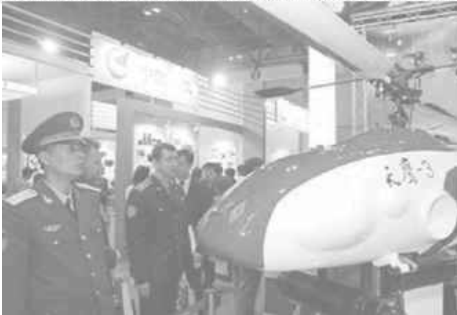
People visit the Fifth China International Defence Electron Expo at the Beijing Exhibition Hall in Beijing, capital of China, on 26 April, 2006. Approximately 300 exhibitors from at home and abroad took part in the exhibition, opened on Wednesday.—INTERNET

ပညာရေးနှင့် ခေတ်မီမှုများတိုးတက်သော နိုင်ငံတော်ကြီး တည်ဆောက်ရန်