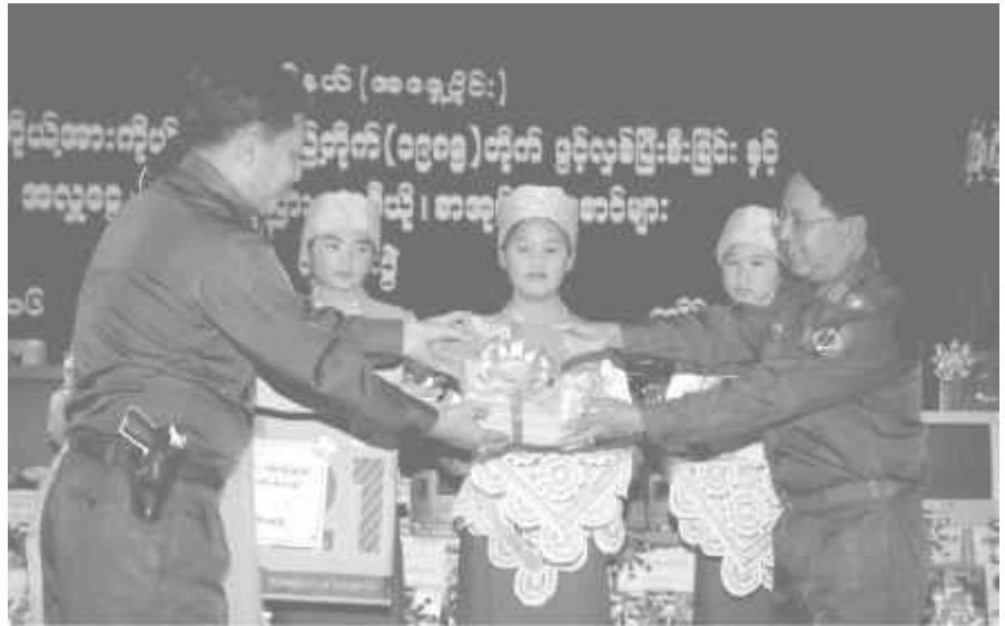
Commander Maj-Gen Min Aung Hlaing and wife Daw Kyu Kyu Hla present a 21-inch TV and 150 books for village libraries to Minister for Information Brig-Gen Kyaw Hsan.

The commander said that the Information and Public Relations Department has set up self-reliant village libraries across the nation to enhance the knowledge of rural people . So far, 53,554 libraries have been (See page 9)