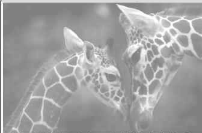
Mother giraffe looks onto her nine-month-old child at the Frankfurt Zoo, central Germany, on 27 April, 2006.