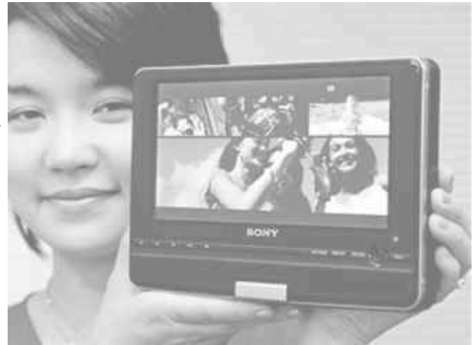
Japan's electronics giant Sony employee displays the new portable DVD player DVP-FX810 recently.