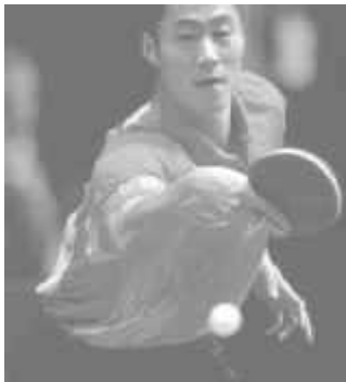
China's Wang Liqin returns the ball during a third-round match of Group A against Denmark's Michael Maze at the 48th World Team Table Tennis Championships in Bremen, north Germany, on 26 April, 2006. China beat Denmark 3-0.

In the 17 May Paris final Barcelona will meet Arsenal, who also advanced 1-0 on aggregate after a goalless draw at Villarreal on Tuesday, reaching the final for the first time.