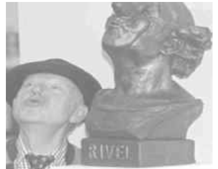
Russian clown legend Oleg Popov poses next to a bust, depicting famous Spanish clown Charlie Rivel, and imitating Rivel's wellknown facial expression as he visits a special exhibition on the occasion of the 30th anniversary of the German Circus Roncalli, in Cologne, Germany, on 26 April, 2006.