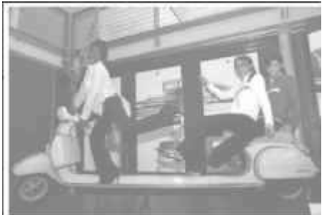
Models smile while posing on the limousine version of the Vespa PX 125 during Vespa's 60th anniversary celebrations at the Piaggio Museum in Pontedera, near Pisa, northern Italy, on 27 April, 2006.