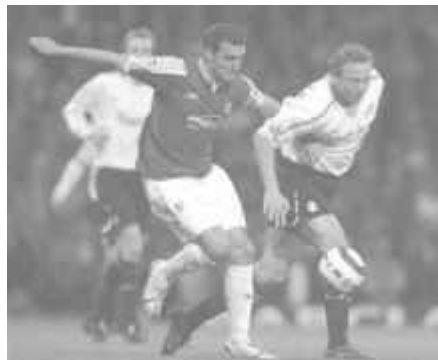
West Ham United's Lionel Scaloni, left, tackles Liverpool's Jan Kromkamp during their English Premier League soccer match at the Upton Park stadium, London, on 26 April, 2006.