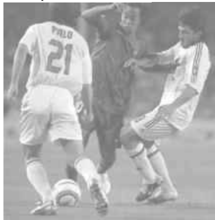
Barcelona's Ronaldinho from Brazil (C) tries to keep control of the ball against AC Milan Andrea Pirlo (L) and Germano Ivan Gattuso during the second leg of their Champions League semifinal soccer match at Nou Camp stadium in Barcelona, on 26 April, 2006.

Barcelona's last final appearance was the 4-0 defeat by Milan in 1994, two years after they had beaten Sampdoria for their solitary success in Europe's top club competition.