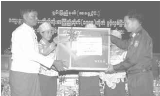
Commander Maj-Gen Min Aung Hlaing accepts TV sets donated by District PDCs of Shan State (East).