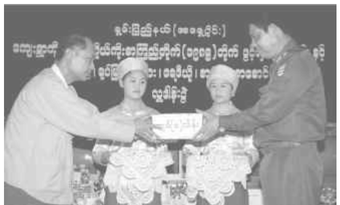
Minister for Agriculture and Irrigation Maj-Gen Htay Oo accepts cash donations of departments concerned from Shan State (East).