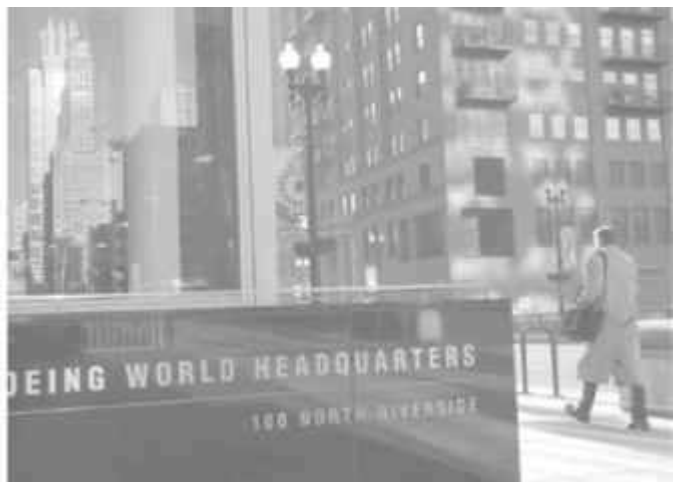
A pedestrian walks past the Boeing World Headquarters office building in Chicago, on 26 April, 2006. Boeing said on Wednesday that first-quarter profit rose a greater-than-expected 29 percent, as sales of its commercial planes offset a drop in revenue at its defence unit.