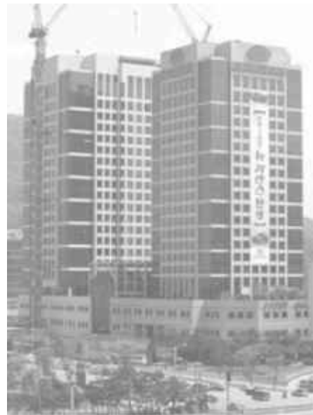
The picture showing Hyundai Motor Co head office in Seoul, South Korea, on 27 April, 2006. INTERNET