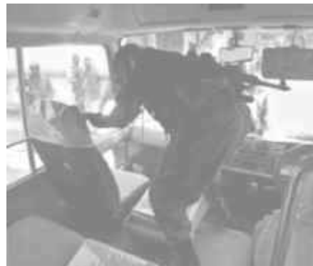
A Sri Lankan soldier checks a car for explosives at a roadside checkpoint in Colombo, Sri Lanka on 27 April, 2006. Police found five headless corpses near the Sri Lankan capital on Thursday, a senior police officer said, and authorities were investigating if the deaths are linked to a recent upsurge in fighting with Tamil rebels.