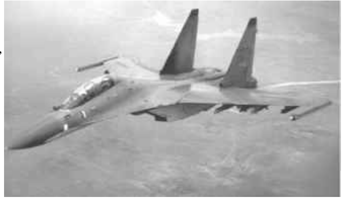
A new-type fighter of PLA Air Force carries out training. Implementing a series of important instructions by President Hu Jintao on intensifying military training, the People's Liberation Army (PLA), guided by the scientific development concept, has persisted in reform and innovation and intensified training through scientific measures this year.