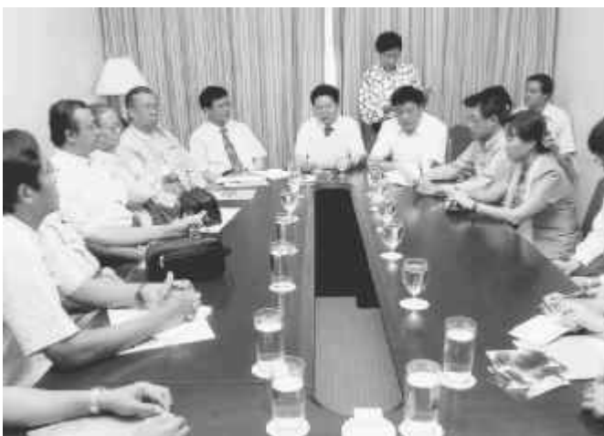
The introduction of hair-growing medicine 101 in progress.

It is needed to be free from diseases to be able to lead a healthy life and to be convinced of the trap of narcotic drugs in line with the two aims of the Ministry of Health — to enable every citizen to enjoy longevity and to be free from diseases. As producing healthy human resources is an important national task in a bid to build a new nation, emphasis is to be placed on making sure that new generation youths are free from the bad habit of drug abuse.