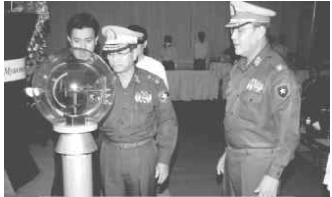
Lt-Gen Myint Swe formally opens the Fifth Myanmar ICT Week. — MNA

In addition, a plan that can be called international level Cyber City has been laid down. Under the plan, production blocks for software producers at home and abroad for the development of ICT indus-