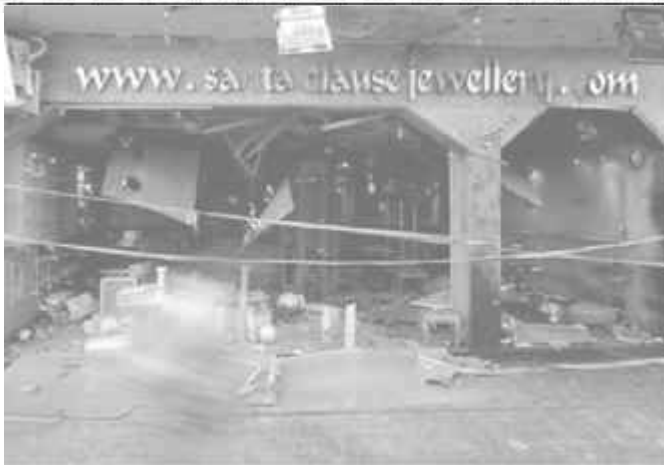
A resident runs past a shop destroyed by explosion near the place where one of the three explosions took place in the touristic resort of Dahab in Egypt's Sinai Peninsula, on 25 April, 2006.