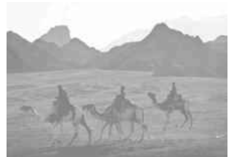
Egyptian Bedouins ride camels in a desert in the Sinai Peninsula on 26 April, 2006.