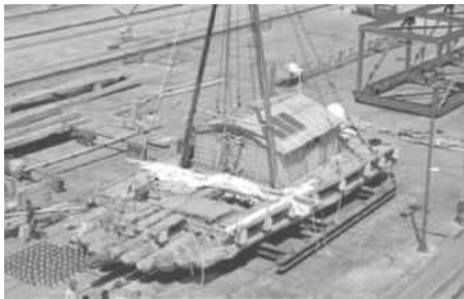
The Tangaroa wooden raft is seen at the port of Callao in Lima, on 26 April, 2006. The Tangaroa expedition aims to recreate Thor Heyerdahl's legendary Kon-Tiki voyage, from Peru to the Polynesia, across the Pacific Ocean in a balsaraft in 1947. The team, which includes Heyerdahl's grandson Olav, will launch the Tangaroa from Callao on 28 April.