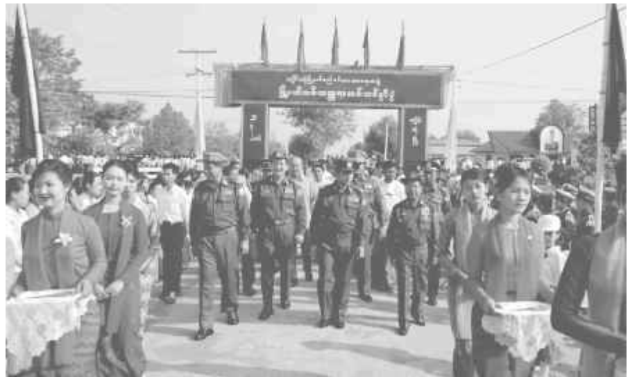
Commander Maj-Gen Min Aung Hlaing and party inspect newly opened circular town road. — MNA

Also present on the occasion were Minister for Agriculture and Irrigation Maj-Gen Htay Oo, Minister for Information Brig-Gen Kyaw Hsan, Minister for Progress of Border Areas and National Races and Development Affairs Col Thein Nyunt, local authorities, departmental heads, members of social organizations and local people. — MNA