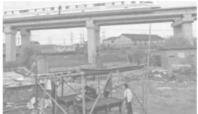
Men play snooker near a bridge as the Maglev train passes by in Shanghai, on 26 April, 2006.