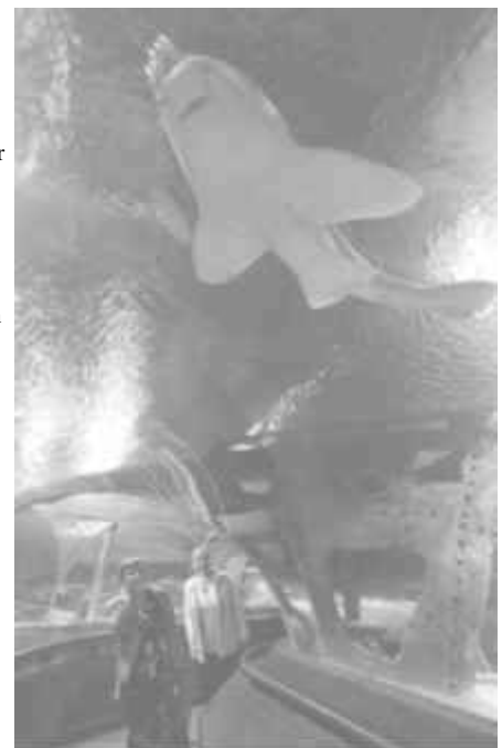
Visitors look at a shark as they walk inside a tunnel of Russia’s first oceanarium, recently built in St Petersburg, Russia, on 26 April, 2006. INTERNET

The disease has recently hit the animals in six out of 12 districts and towns in the province, mainly Duc Trong District. — MNA/Xinhua