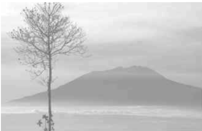
A view of the Mount Lawu volcano, which is 10,712 feet (3,265 m) is seen from the Selo village, near Indonesia's city of Boyolali, on 26 April, 2006.—INTERNET.

Addressing the 25th plenary session of the Intergovernmental Panel on Climate Change (IPCC) opened on Wednesday in capital Port Louis of the island country Mauritius, Environment Minister of the country Anil Bachoo said the possible impacts of climate change on SIDS are currently not fully appreciated partly due to lack of information and detailed scientific research.—MNA/Xinhua