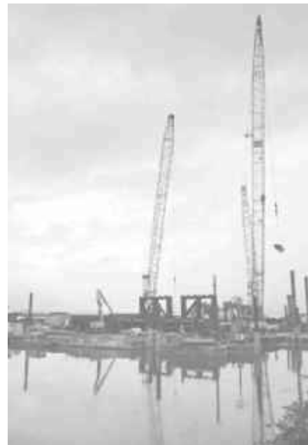
Cranes are used to construct a floodgate between the Seventeenth Street Canal and Lake Pontchartrain in the Lakeview area of New Orleans on 26 April, 2006. INTERNET