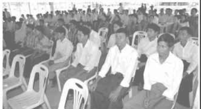
Local people who suffered trouble due to atrocities of KNU insurgents seen at the hall in Mone of Kyaukkyi Township. MNA