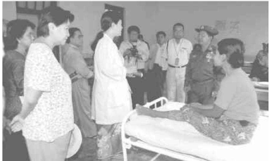
Minister Brig-Gen Kyaw Hsan comforts a mine victim who is undergoing treatment at Mone Station Hospital. —MNA

Along the journey, I happened to recall the ceremony held in Thabyenyunt Village. Chairman of the Information Committee of the State Peace and Development Council Minister for Information Brig-Gen Kyaw Hsan was together with the team. At Thabyenyunt Village, the minister dealt with power struggles and killing and torturing one another among the members of KNU Brigade (7), and various forms of adversities and stresses and strains local people