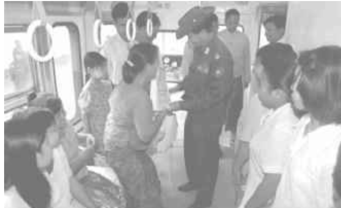
Minister for Rail Transportation Maj-Gen Aung Min gives souvenir to a passenger in 107 Express Train. — MNA

Furthermore, Myanma Railways will make arrangements for running of Nay Pyi Taw-Pyay-Nay Pyi Taw Express Trains beginning 25 May to ensure better transport for local people in western region of Yoma and for State service personnel who are discharging duties in Nay Pyi Taw. — MNA