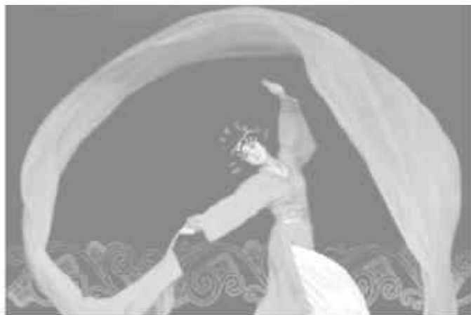
A Mainland Chinese performer of the Shaanxi Traditional Opera Research Institute performs 'water sleeves' during the rehearsal for her upcoming performance in Hong Kong on Tuesday, 16 May, 2006. The performance will be held from 16 to 18 May.

Forecast for Mandalay and neighbouring areas for 19-5-2006: Partly cloudy.