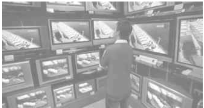
A man looks at televisions in Singapore, on 17 May, 2006. Singapore's economy grew faster than expected in the first quarter, backed by sustained demand for electronics goods and a stronger services sector, leading the government to raise its 2006 growth forecast to 5-7 percent.