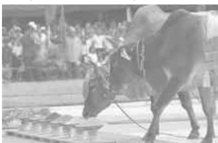
Cambodian Royal oxen eat corn during the annual ploughing ceremony in Phnom Penh in this May 26, 2005 file photo. Cambodia's sacred oxen have forecast a bountiful harvest but thin rains, leading farmers to call on the government to build more irrigation systems and canals.

PHNOM PENH, 17 May—Cambodia's sacred oxen have forecast a bountiful harvest but thin rains, leading farmers to call on the government to build more irrigation systems and canals.