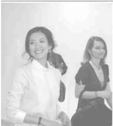
Chinese actress Zhang Ziyi, a member of the Jury of the 59th International Cannes Film Festival attends a Press conference in Cannes, southern France, on 17 May, 2006. The 59th Cannes film festival opened officially on Wednesday.