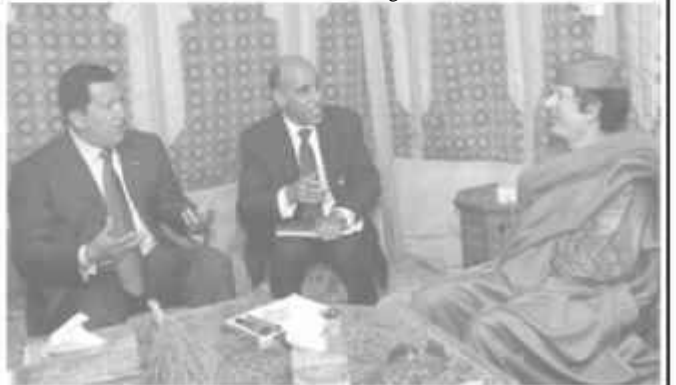
In this photo released by Venezuela's Miraflores Press, Venezuela's President Hugo Chavez, left, and Libya's leader Moammar Gadhafi, right, meet as an unidentified interpreter sits between them in Tripoli, Libya, on 17 May, 2006.