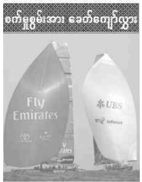
America's Cup challenger Emirates Team New Zealand (L) and defender Alinghi of Switzerland race downwind with spinnakers on the eleventh flight of their match race during the sixth day of the Valencia Louis Vuitton Act 10 in Valencia, eastern Spain, on 16 May, 2006.