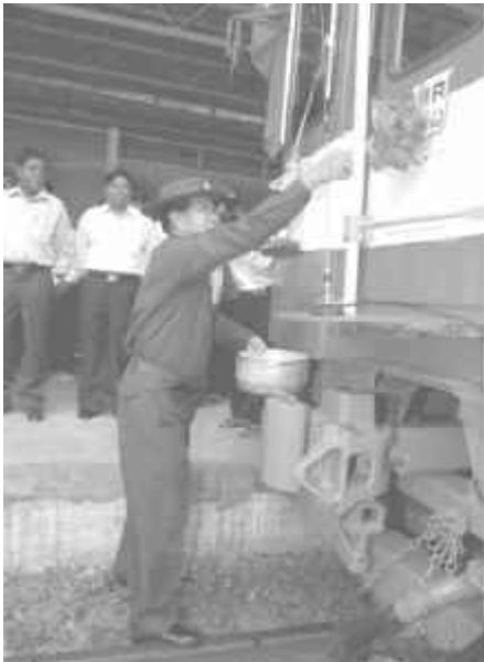
Minister Maj-Gen Aung Min sprinkles scented water on Express Train.