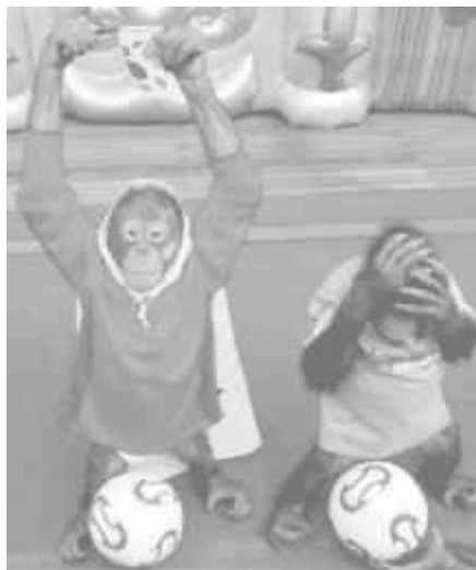
Orangutans in jerseys representing the South Korean (L) and the French soccer teams perform at an animal show wishing South Korean national soccer team victory against France in the 2006 World Cup in Germany, in Seoul, on 18 May, 2006. South Korea have been drawn in World Cup Group G along with France, Switzerland and Togo for next month's tournament in Germany.

KUALA LUMPUR, 18 May — South Korean side Chonbuk Motors recovered from a goal down to beat Chinese champions Dalian Shide 3-1 in Jeonju and advance to the quarterfinals of the AFC Champions League on Wednesday. Needing victory to finish top of Group E, Chonbuk fell behind in the