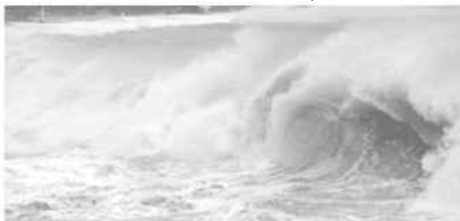
Typhoon Chanchu brings huge waves at Dameisha in Shenzhen, south China's Guangdong Province, on 17 May, 2006. A powerful typhoon slammed into south China on Thursday killing two children and forcing the evacuation of more than 630,000 people, Xinhua news agency said, while Vietnam was searching for 99 fishermen missing at sea.