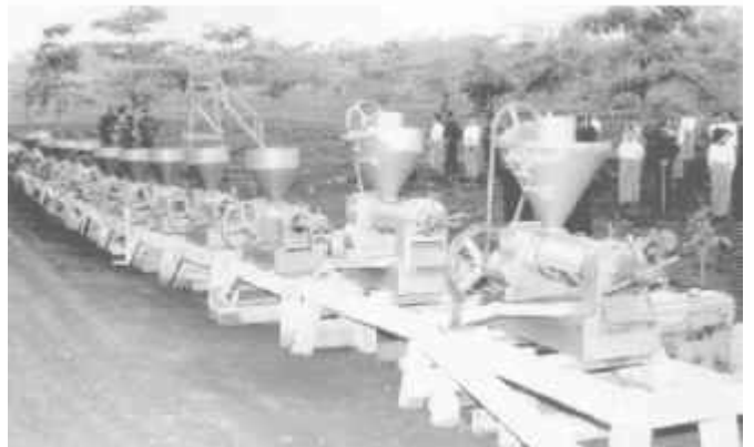
Shan State (North) produces small-scale milling machines to mill physic nut seeds to extract physic nut oil.

to local farmers, private farming companies and local regiments and units with a view to extended