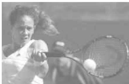
Switzerland Patty Schnyder returns the ball to Russia's Vera Dushevina during their match at the Rome Masters tennis tournament, in Rome, on 17 May, 2006.

the surface was completely different," said Clijsters, who will regain the world number one ranking from Mauresmo if she wins in Rome this week.