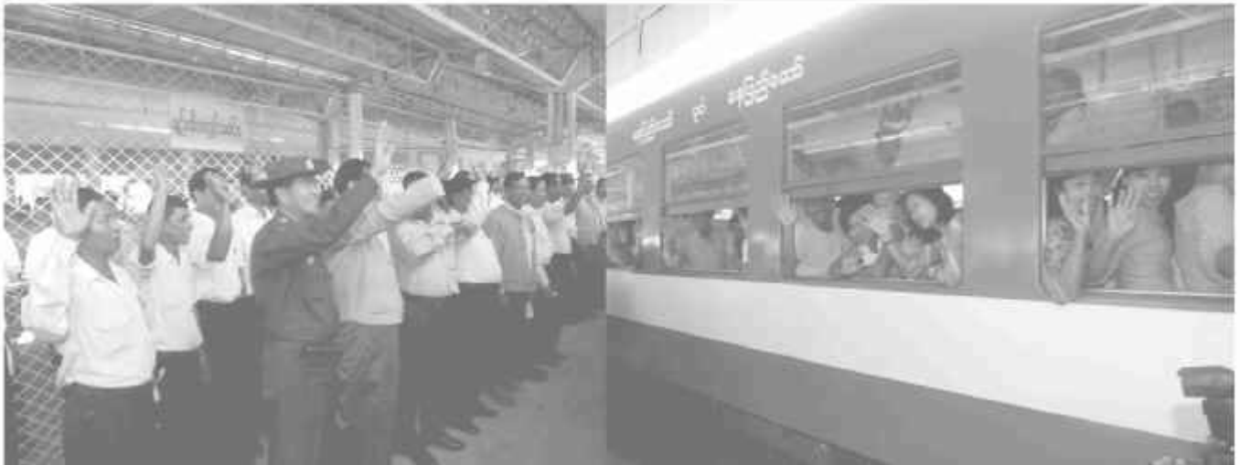
Rail Transportation Minister Maj-Gen Aung Min waves at passengers on board Nay Pyi Taw-Bagan Express Train on departure for Bagan.

NAY PYI TAW, 18 May — A ceremony to launch Nay Pyi Taw-Bagan-Nay Pyi Taw Express Train was held at Pynmana Station in Nay Pyi Taw at 7 am today, attended by Minister for Rail Transportation Maj-Gen Aung Min.