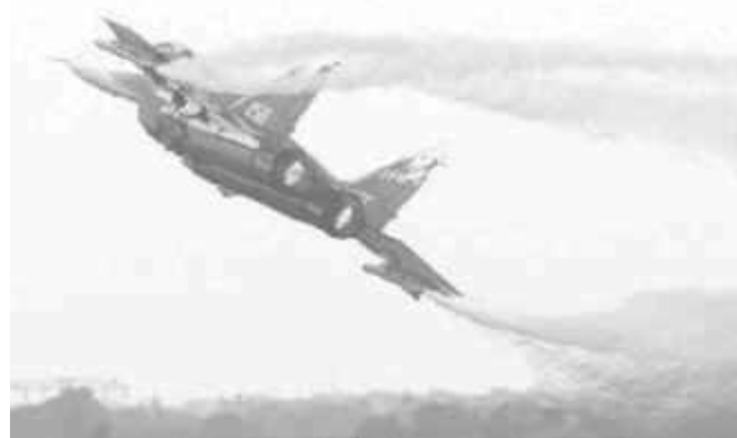
A jet fighter of the type Mikojan MIG-29M OVT of the Russian Aircraft Corporation overflies the exhibition area of the International Aerospace Exhibition (ILA) at Berlin's Schoenefeld airport on the show's opening day on 16 May, 2006.

Tabloids including the Sun and the Mirror ran stories last month on the salaries of BBC presenters and DJs including Chris Moyles, Jonathan Ross and Terry Wogan. British media companies, which have complained about BBC's dominance in radio and TV, seized on the leaked salaries as evidence that the corporation was distorting the talent market by overpaying.