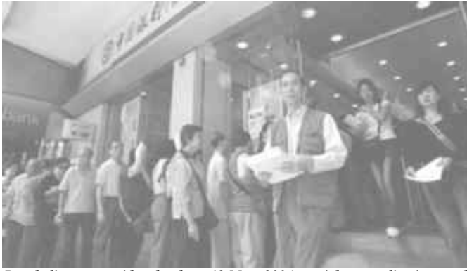
People line up outside a bank on 18 May, 2006, to pick up applications and prospectus to buy share in the Bank of China, whose US$9.9 billion (7.7 billion) initial public offering next month in Hong Kong is expected to be the world's biggest this year.