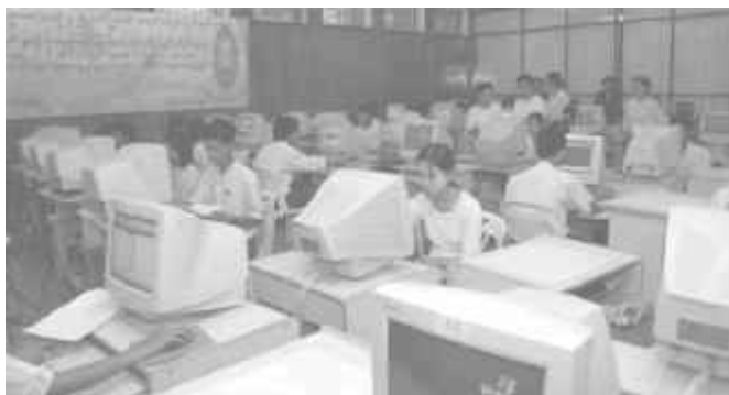
The National Technological Proficiency Test for 6th ASEAN Skill Competition in progress. — MNA

versities and Government Computer Colleges and Technological Colleges under the Ministry of Science and Technology took part in the tests. — MNA