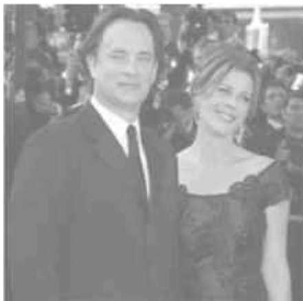
American actor Tom Hanks, left, arrives with his wife American actress Rita Wilson for the screening of 'The Da Vinci Code,' at the 59th International film festival in Cannes, southern France, on 17 May, 2006.