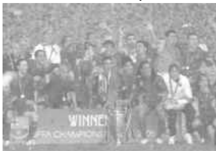
Barcelona players pose with the trophy after Barcelona won the Champions League final against Arsenal in the Stade de France in Saint-Denis, outside Paris, on 17 May, 2006.

And from the resulting short corner, he fired in an angled drive which