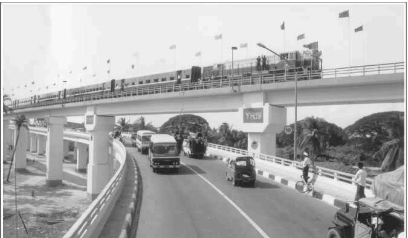
A train crossing over Thanbwin Bridge (Mawlamyine) at the opening day of the rail bridge on 17 April 2006.

Emergence of the State Constitution is the duty of all citizens of Myanmar Naing-Ngan.