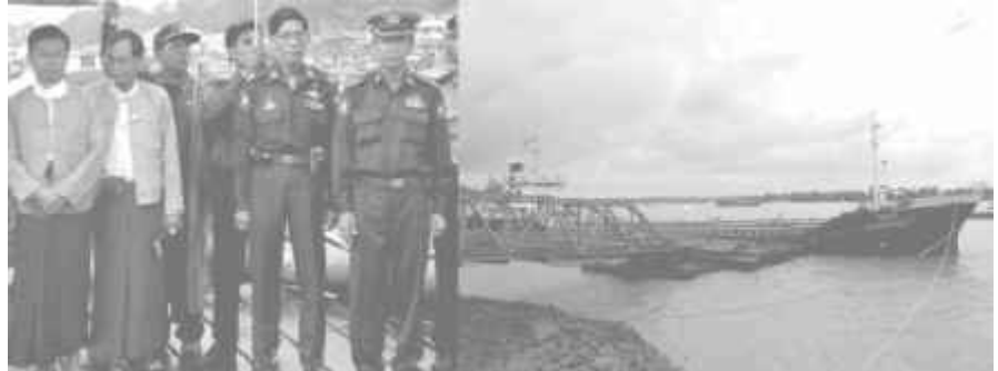
Officials inspect the unloading of 2,700 tons of palm oil from MT Smooth Sea-4 vessel at Htidan Port in Yangon.

YANGON, 18 May — MT-Smooth Sea-4 vessel loaded with 2,700 tons of palm oil arrived today at Htidan Port here.