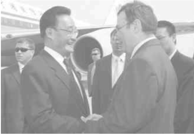
Wu Bangguo (L), chairman of the Standing Committee of China's National People's Congress, shakes hands with the vice-chairman of the Romanian Chamber of Deputies Valer Dorneanu after Wu's arrival at an airport in Bucharest, capital of Romania, on 17 May, 2006.