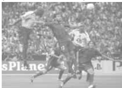
Arsenal's Sol Campbell (L) heads the ball to score during their Champions League final against Barcelona at the Stade de France in Saint Denis near Paris, on 17 May, 2006.