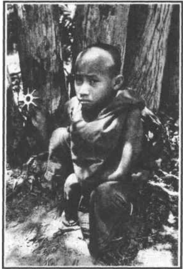
Novice monk holding the remains of a mortar shell which the Myanmar army shot through the roof of his monastery in the Kyeikdon area, Kayin State, 1992.