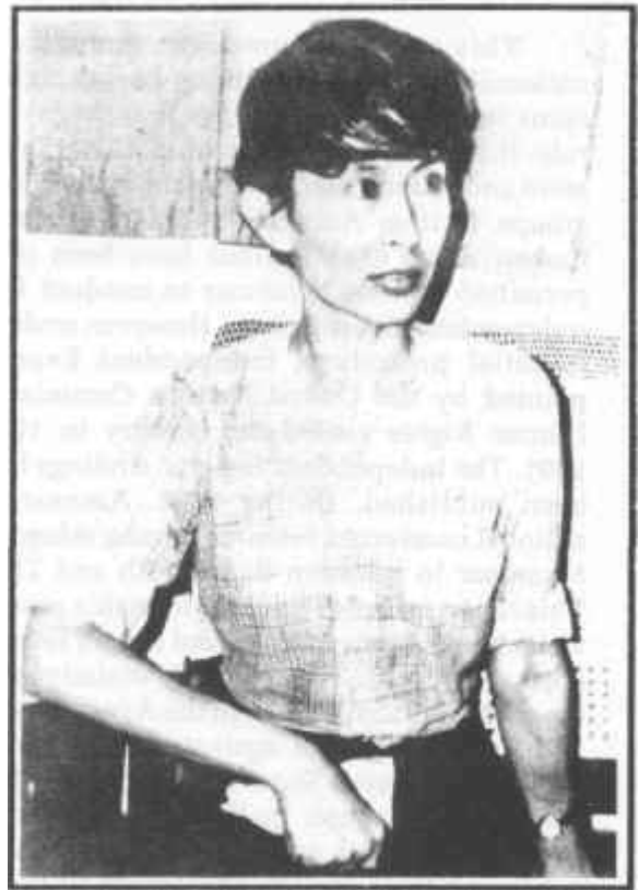
Above: Aung San Suu Kyi, General Secretary of the opposition National League for Democracy, was detained in 1989 and barred from standing in the 1990 elections. In December 1991, still detained without charge or trial, she was awarded the Nobel Peace Prize for her "non-violent struggle for democracy and human rights".