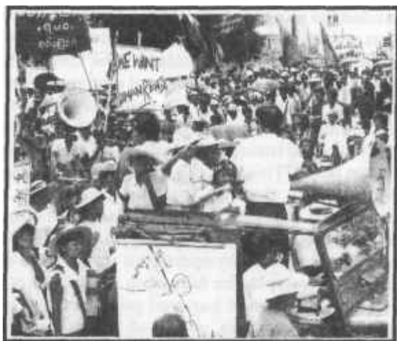
Below: Pro-democracy demonstrations in Mandalay, 1988

was distinct from the political prisoners released under Declaration No. 11/92.