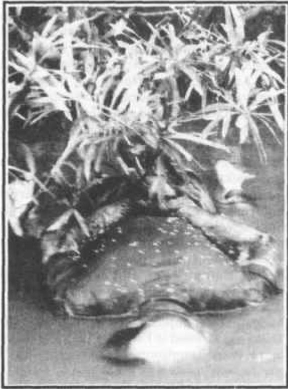
The body of a porter, hands tied behind his back, was found floating in the Thanlwin (Salween) river, 1992.