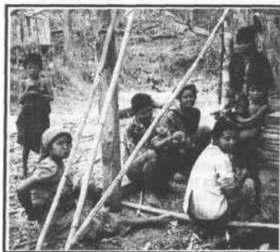
Top: Former porters who escaped to Thailand, showing wounds resulting from beatings by the military, 1992.