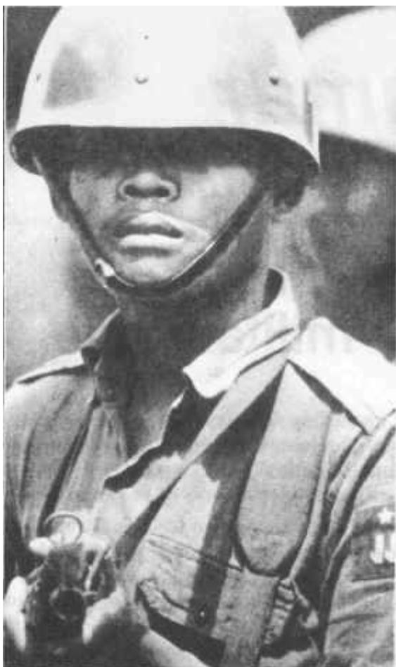
Above: Soldier in Yangon, August 1988, at the scene of demonstrations protesting against the one-party, military-dominated rule of the BSPP. The military shot thousands of demonstrators between March and September 1988.