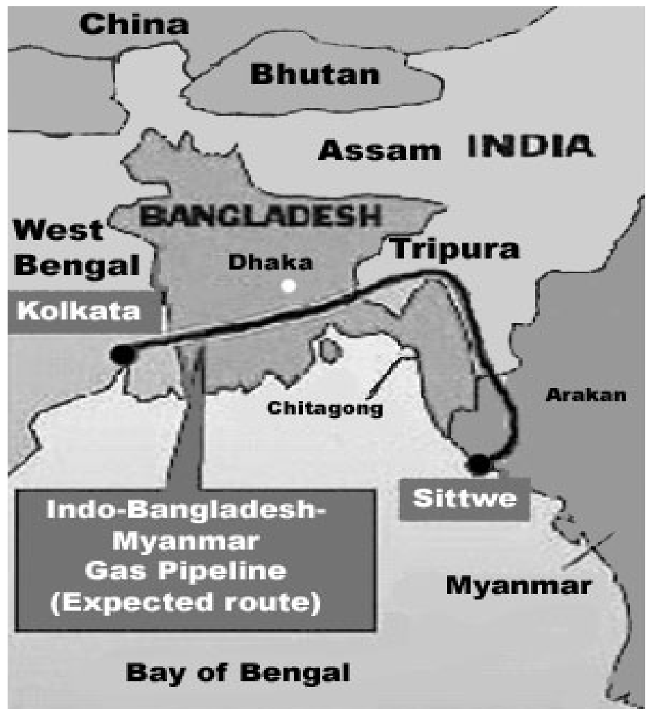
Possible gas pipeline route from Burma to India

If the project goes ahead, Bangladesh will earn an estimated $125 million US annually in transit fees. It would also be the first international pipeline for India, which imports 70 percent of its crude oil need and has started importing liquefied natural gas. According to the Indian Petroleum Minister, Mr Mani Shankar Aiyar, India's demand for gas could reach 400 million standard cubic meters per day by the year 2025, necessitating a constant search for energy sources. India, with a population of 1 billion has