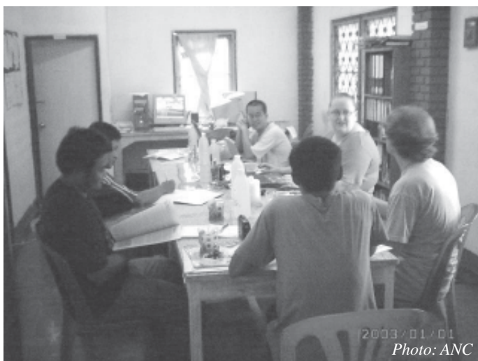
The roundtable meeting is held once a month in order to share information and to promote the Shwe Gas Campaign.