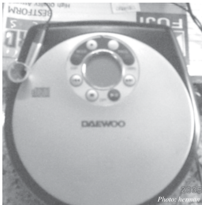
A CD player, one kind of Daewoo products for sale in US

Shwe Gas activists have already started campaigning against Daewoo in Thailand, India and Bangladesh. The Arakanese community in Korea will set up a campaign office to mobilize Korean civil society to promote the Shwe campaign, according to the Arakanese in Korea.