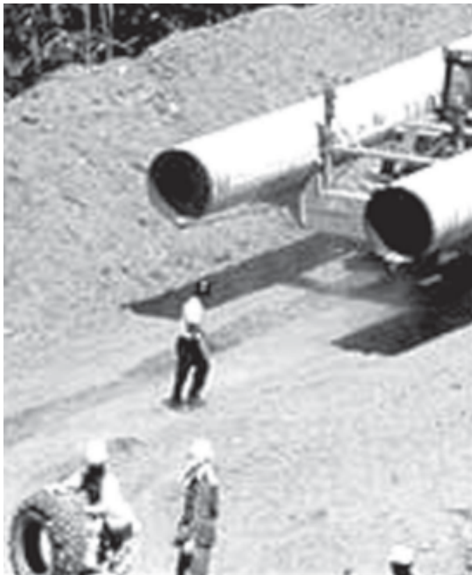
Forced labor is still being used in military-ruled Burma

"Each village had to work on over 4,000 feet of road, using their own equipment and supplying their own food, under pressure by U Thein Tun, chairman of the Paletwa City Corporation," found the survey. "The villages are 18 miles from the road construction and the villagers had to walk to the site in order to provide slave labor, without