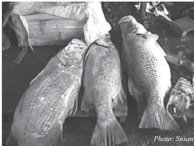
Some Sea Perch in the market of Sittwe City, Capital of Arakan.

global warming or the tsunami, because the entire coastline would be affected. Similarly, mangrove forests exist from as far north as Sittwe to as far south as Ondaw, and are used for prawn farming in many different areas, degrading the natural protection barrier and increasing salinity, yet again only the fish near the exploration site have differed. Lastly, agricultural practices involving chemicals and machinery that could damage topsoil or alter the water