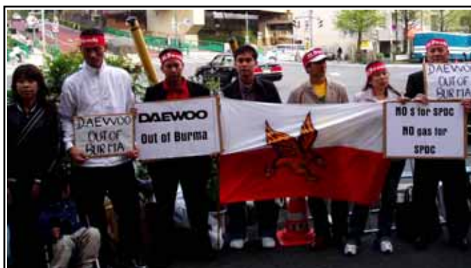
Action of April 18 Global Protest against Daewoo in Japan.

The writer is a freelance columnist and security & defence analyst, whose e-mail address is hhintl@bdmail.net