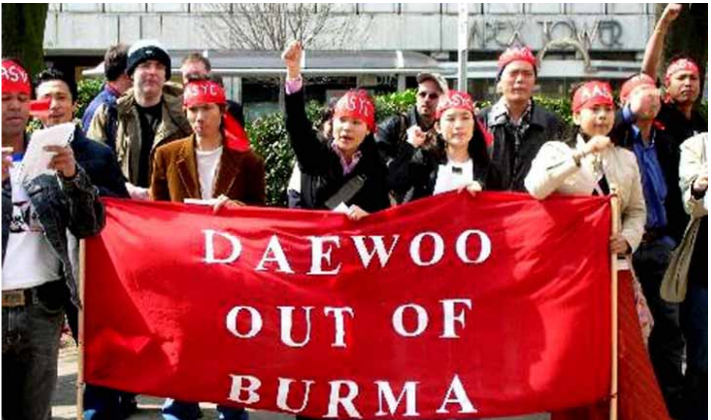
Shwe gas activists demonstrated in front of the South Korea embassy in London, UK to stop Daewoo's Shwe gas exploration in Arakan State, western Burma.