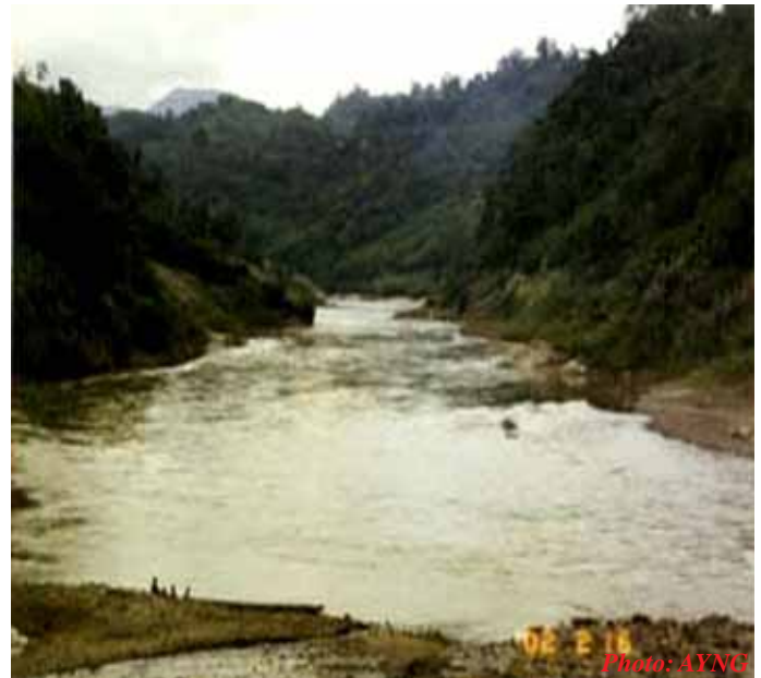
Shwe Gas Pipeline project to India threatens the Kaladan river, one of the biggest rivers in Arakan on which almost half of Arakanese depend.

Shwe natural gas activists contend that it is morally and ethically compelling that KOGAS, a largely state-owned South Korean oil and gas company, and Daewoo