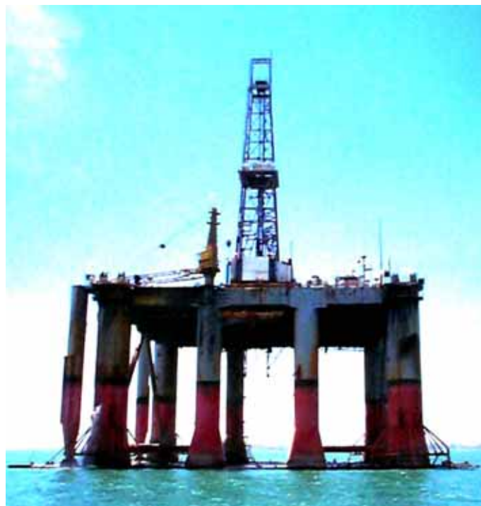
COSL's semi-submersible Nanhai II drilling vessel.

COSL is a leading oilfield services provider in the offshore China market. Its services cover each phase of offshore oil and gas exploration, development and production. //