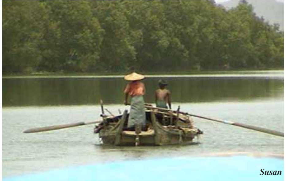
Kaladan’s beauty and thousands of its depended families for their daily survival are threatened by the Shwe gas project pipeline.

Currently, the majority of Arkanese families depend on this river for fishing,