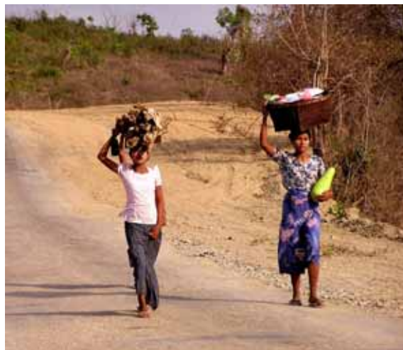
Residents along the Kaladan River, Arakan, are being suffered from starvation as the country's commodities price have been increasing.

Millions of Arakanese people from Kaladan River depend on fishing and farming for their survivals. Shwe Gas activists believe that if the pipeline is implemented, the future of Arakan will become worse than it is today.//